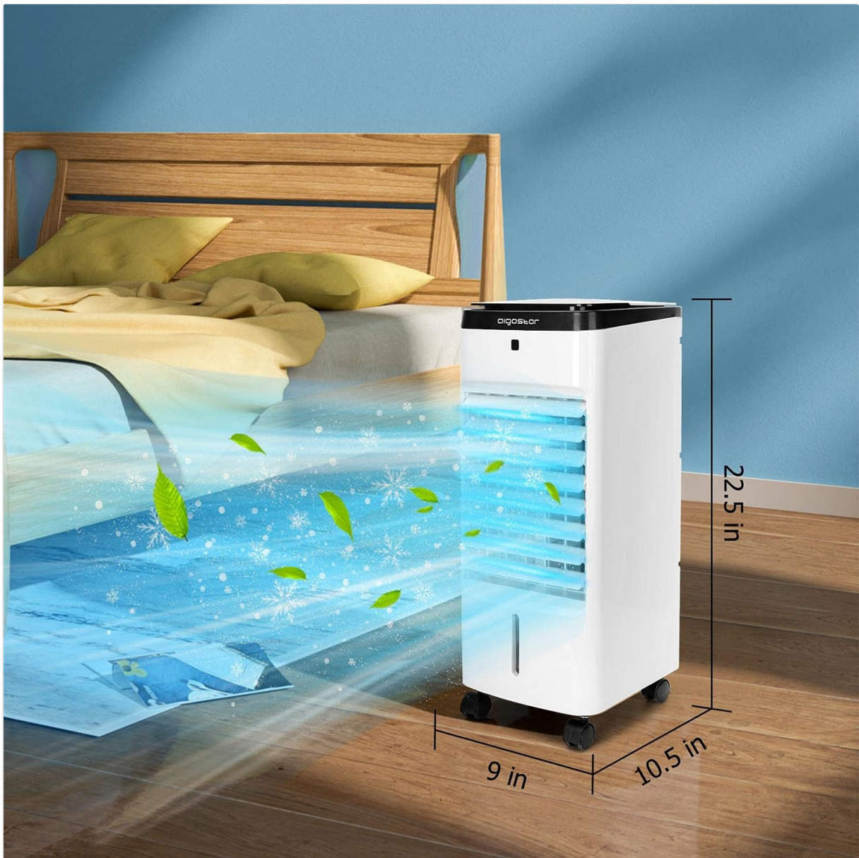
Image 8.2: Visual representation of the air cooler's dimensions (height, width, depth).