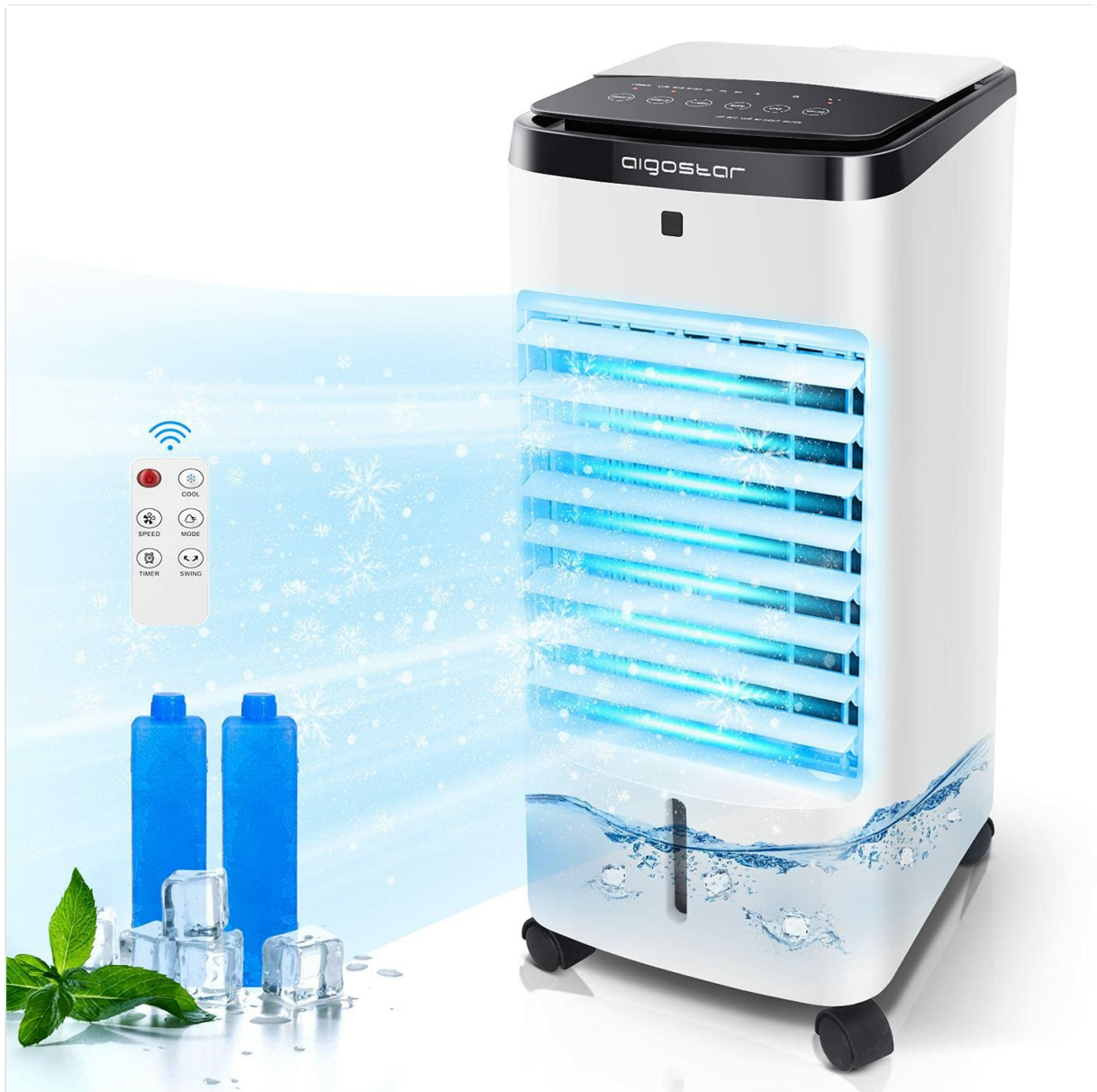
Image 2.1: The Aigostar 3-in-1 Portable Evaporative Air Cooler, showcasing its sleek design and compact form factor.