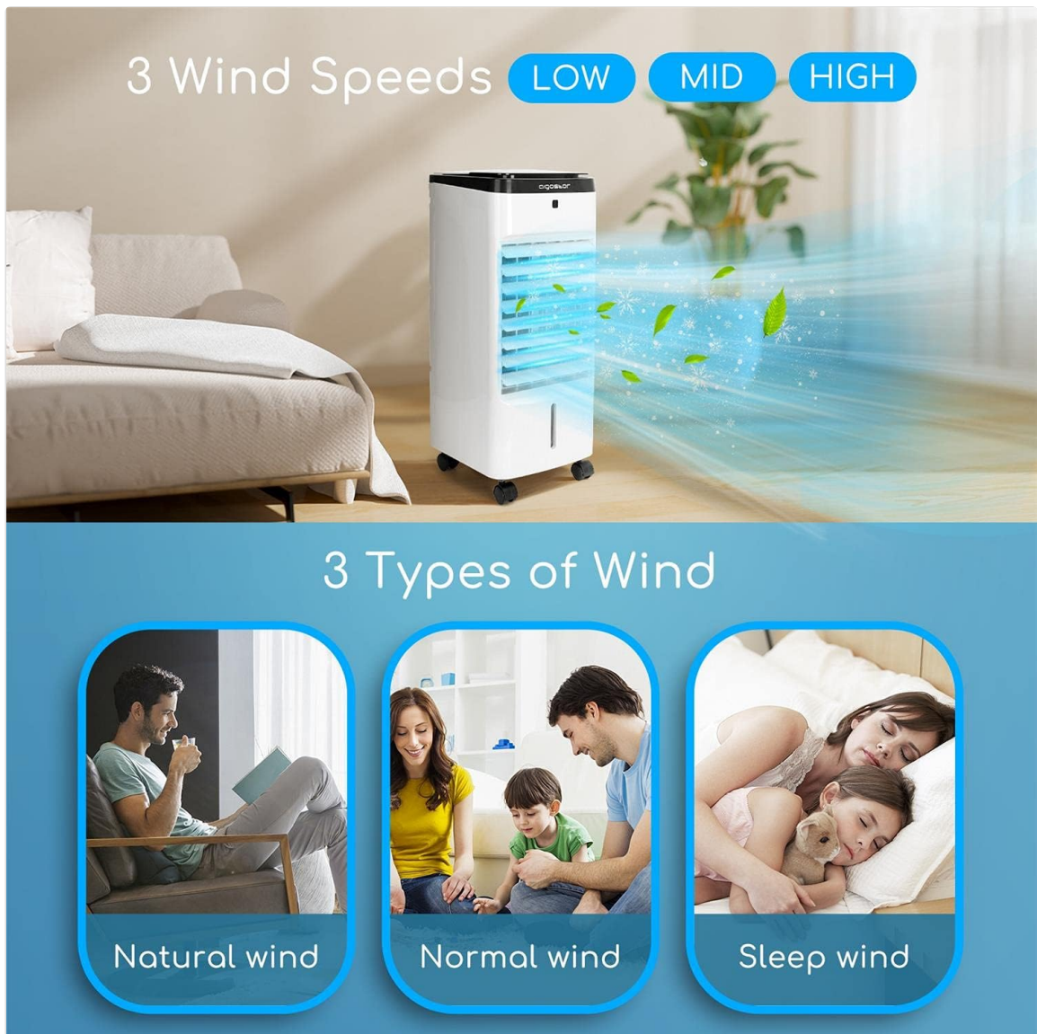
Image 4.3: Illustration of the three wind speeds (Low, Mid, High) and three wind types (Natural, Normal, Sleep).