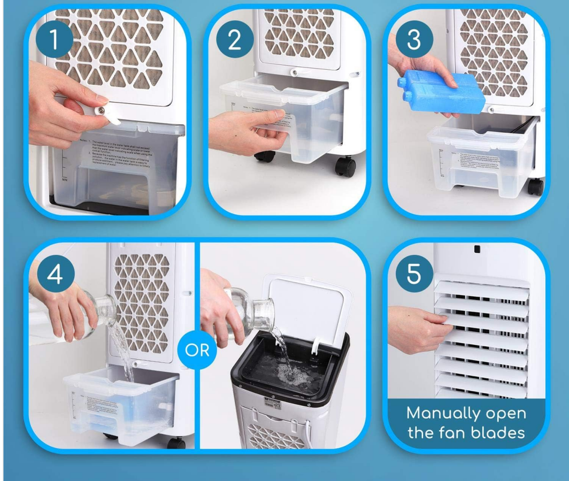
Image 3.1: Visual guide for adding water and ice boxes to the unit.