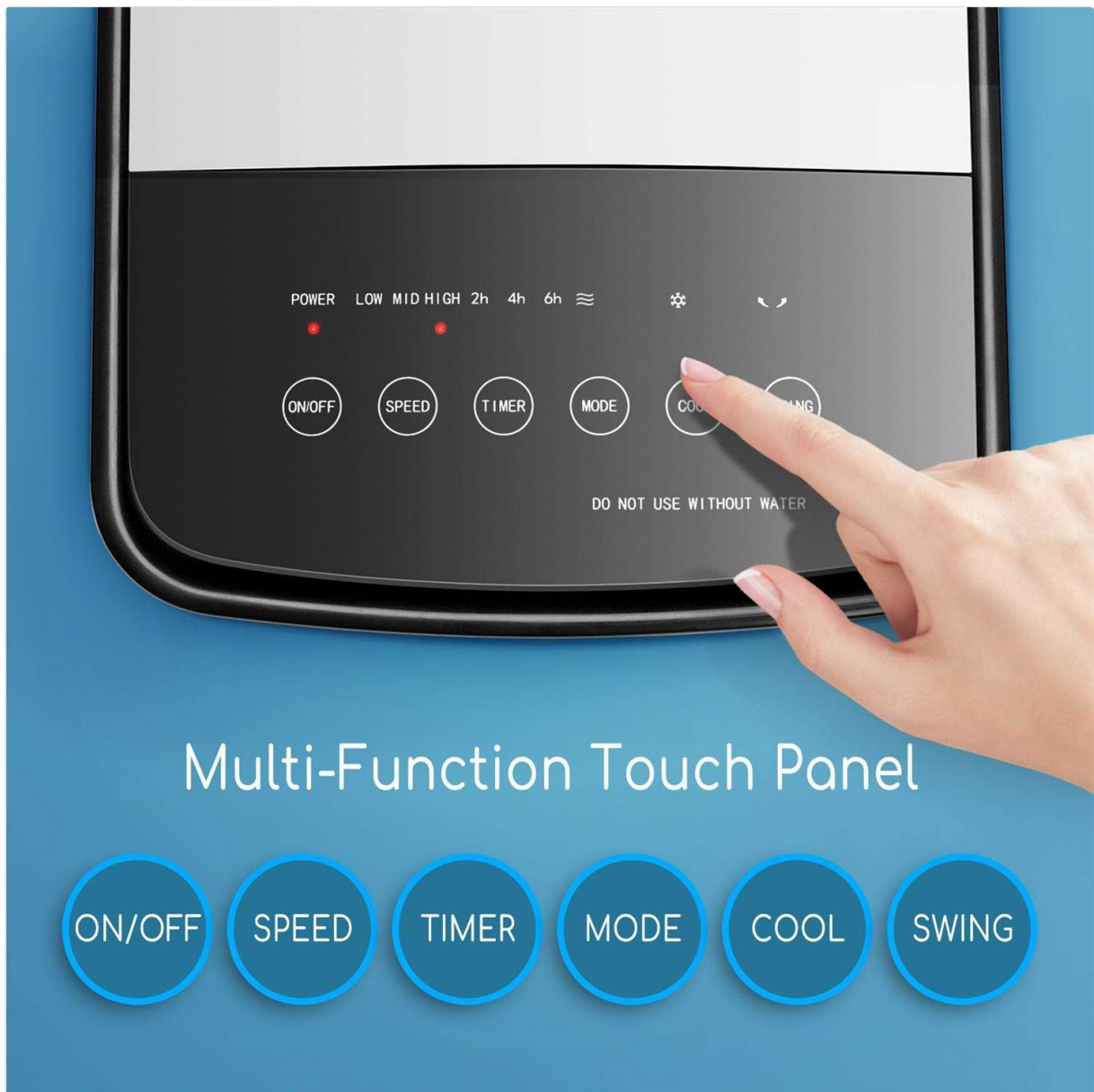
Image 4.1: The multi-function touch panel with clearly labeled buttons for control.