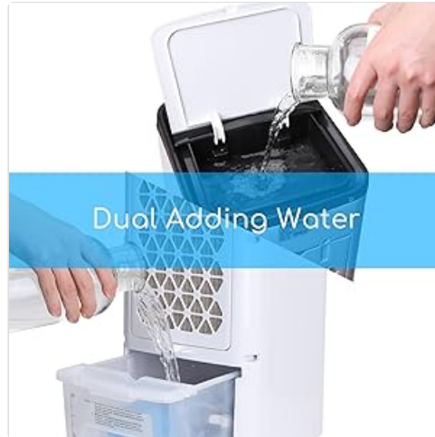
Image 5.1: Illustration of the dual water adding method, allowing water to be poured from the top or directly into the lower tank.