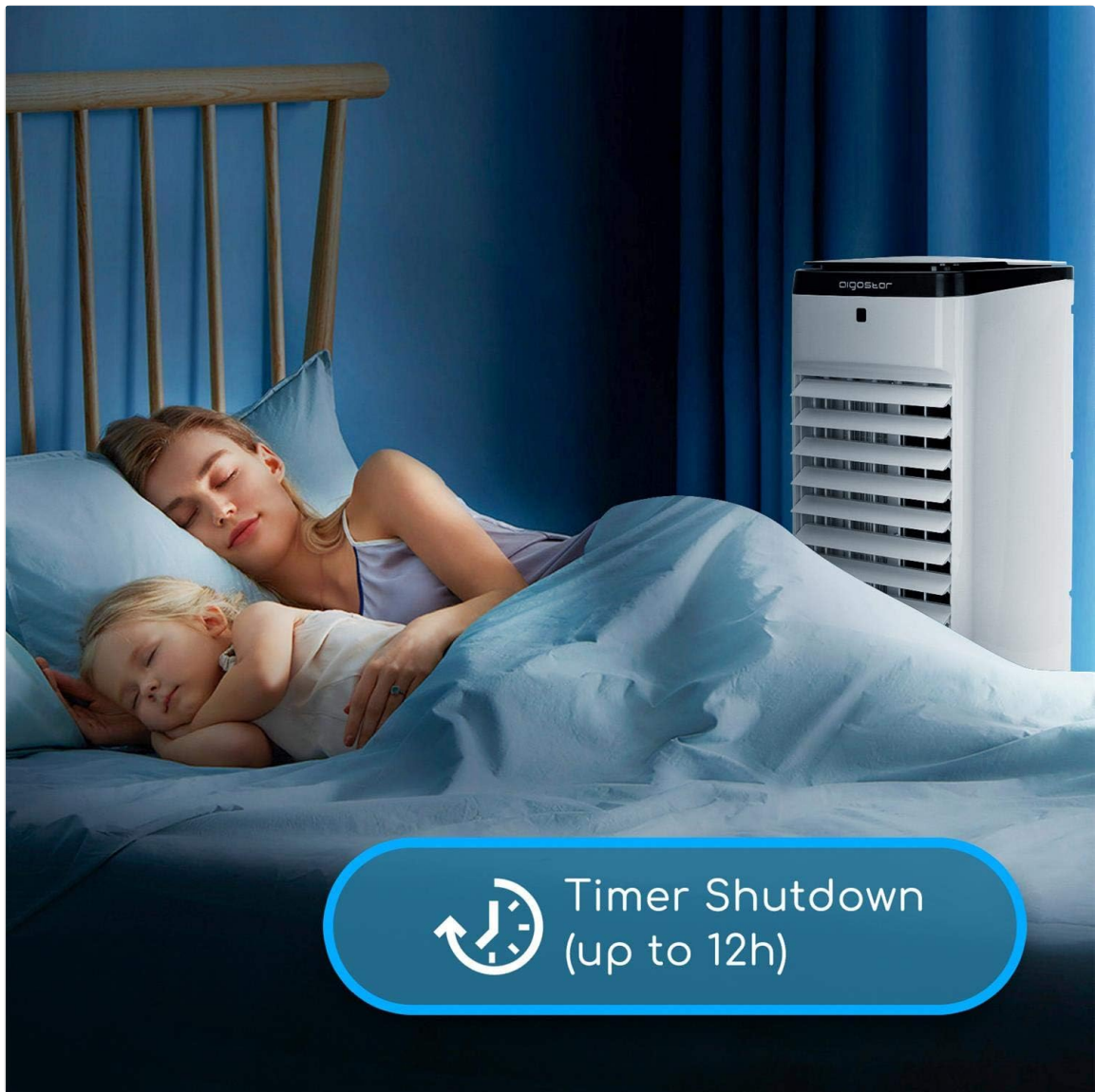
Image 4.4: The timer function allows for automatic shutdown after up to 12 hours, ideal for overnight use.