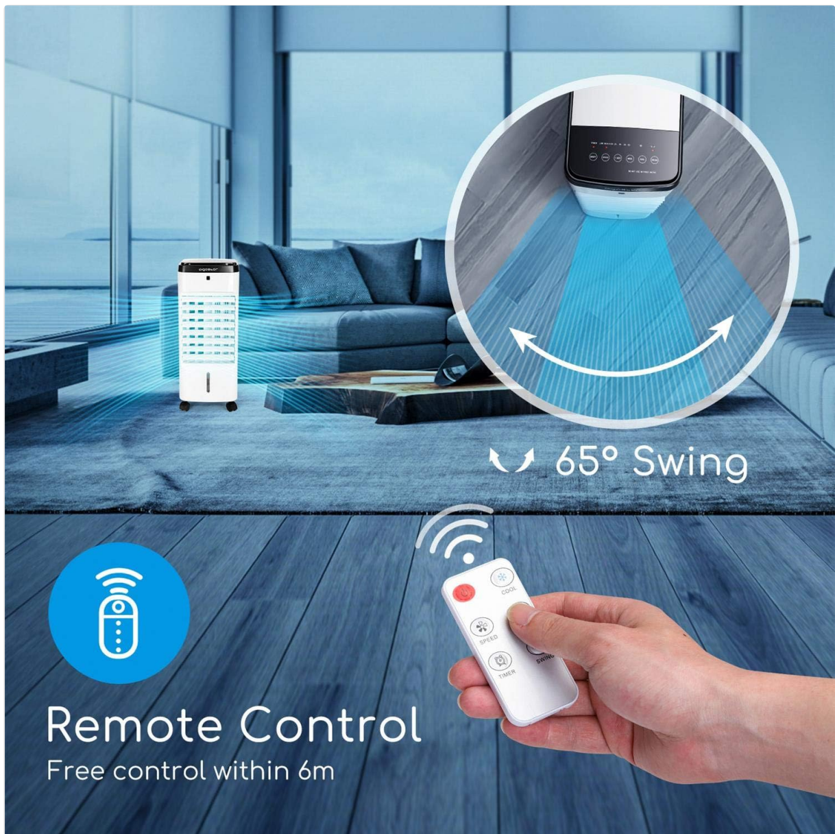
Image 4.2: The remote control for convenient operation from a distance.