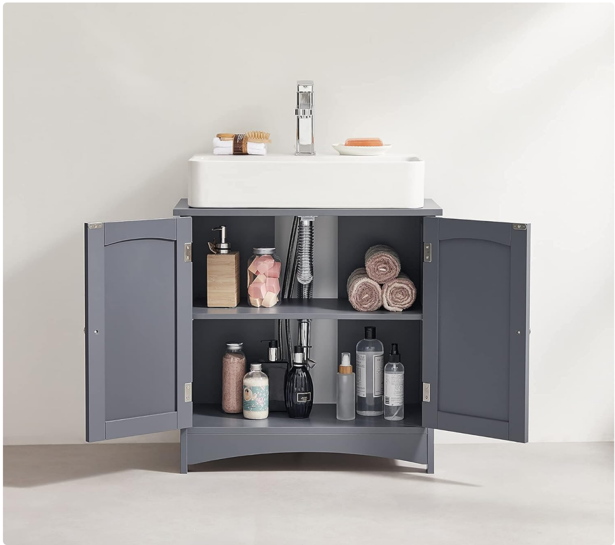
Image: The grey VASAGLE under-sink cabinet with both doors open, revealing an adjustable shelf inside. Various bathroom items like towels, soap dispensers, and bottles are stored within. A white rectangular sink is visible on top.