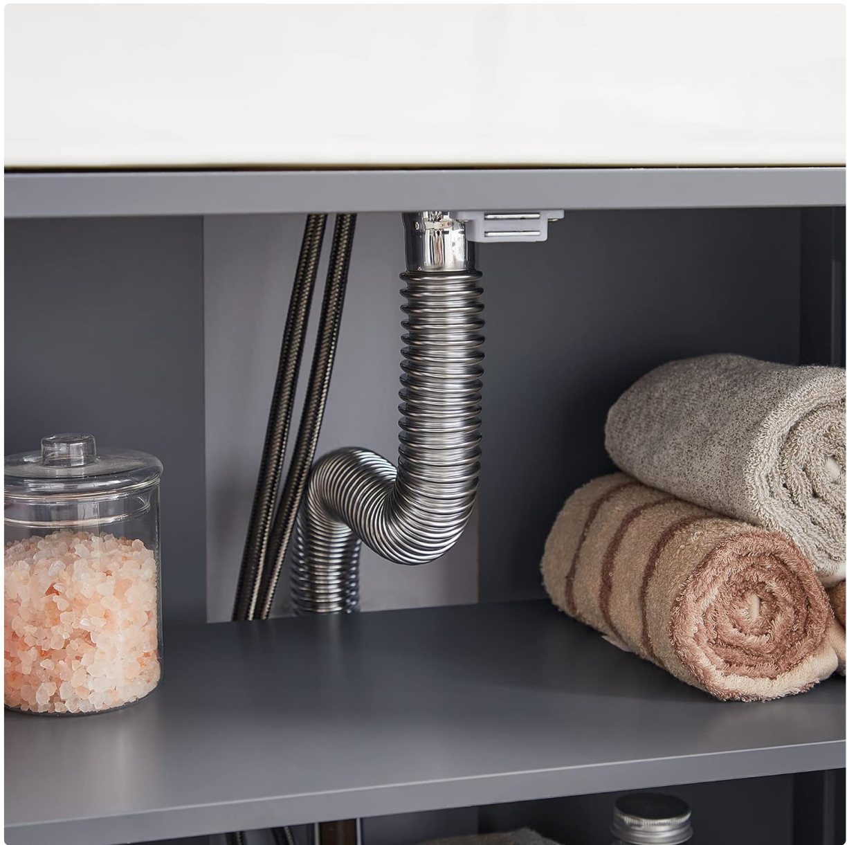
Image: A close-up view inside the VASAGLE under-sink cabinet, focusing on the siphon pipe passing through the top panel and the adjustable shelf below. Towels and bath salts are visible on the shelf.