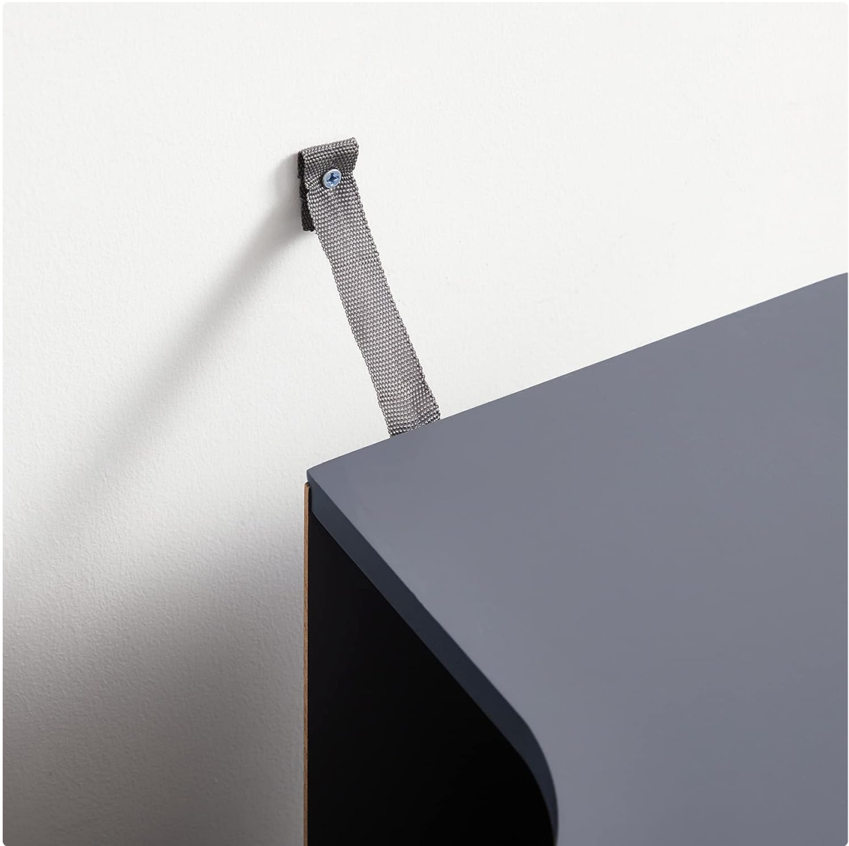
Image: A close-up showing the anti-tip strap securely attached to the top rear of the cabinet and fastened to a wall, illustrating a crucial safety measure.