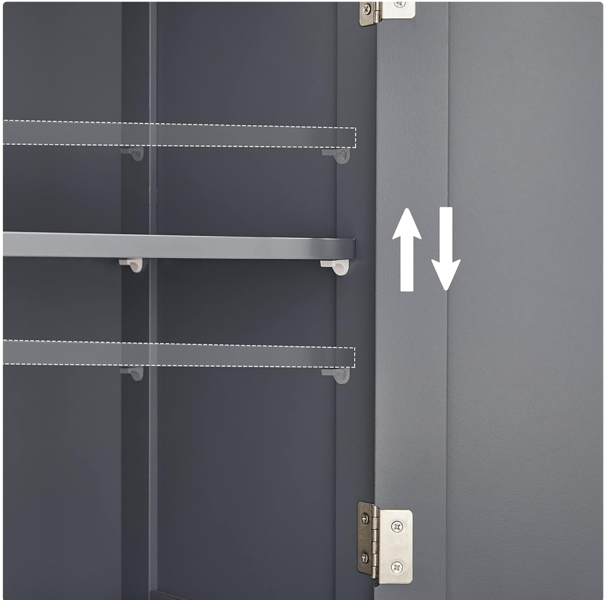
Image: An illustration demonstrating the adjustable shelf mechanism inside the cabinet, showing how the shelf can be moved up or down to three different height positions.

The interior of the cabinet includes one adjustable shelf. This shelf can be positioned at three different heights to accommodate items of varying sizes. To adjust the shelf, remove any items, lift the shelf, and reposition the shelf pins into the desired holes on the side panels. Ensure the shelf is level and securely seated on all four pins before placing items on it.