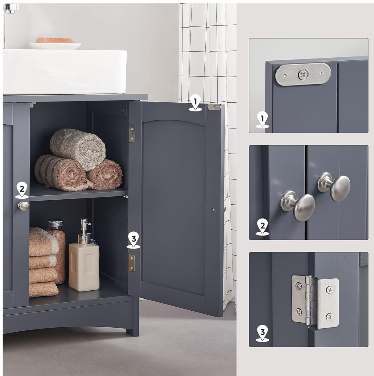
Image: Detailed view of the cabinet's features, including the magnetic catch for the door, the chrome metal door handles, and the metal hinges.