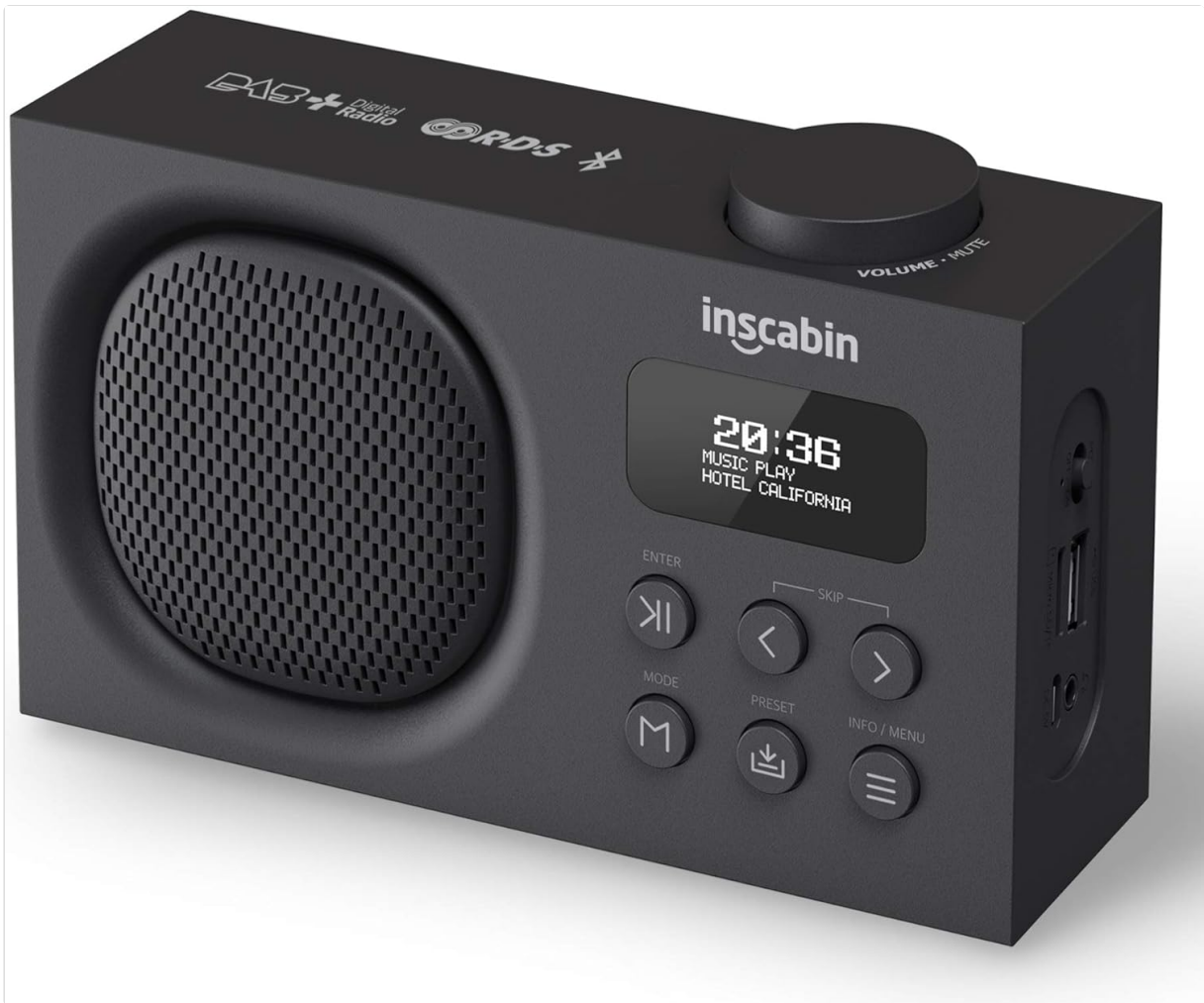
This image displays the front of the Inscabin P2 radio, highlighting its speaker grille, LCD display, control buttons, and the volume knob on top. It provides a clear view of the device's compact design.