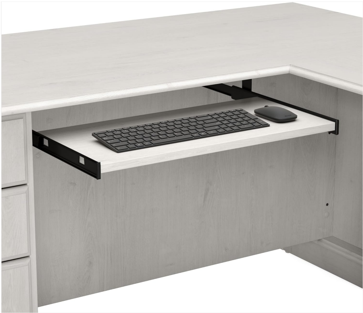
Image 5.2: Close-up view of the retractable keyboard tray. This image shows a keyboard and mouse placed on the extended tray, demonstrating its functionality and space-saving design.