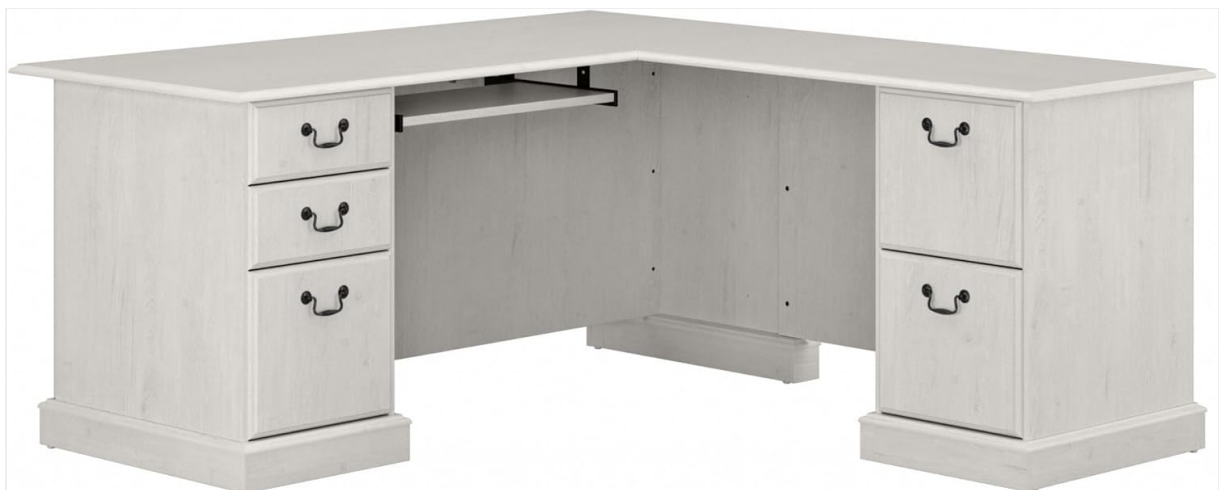
Image 1.1: The Bush Furniture Saratoga L Shaped Computer Desk in Linen White Oak. This image displays the overall design of the desk, featuring its L-shape, integrated drawers on both sides, and a retractable keyboard tray.

The Saratoga L Shaped Computer Desk offers a spacious workspace with integrated storage, designed for home or office environments. It features a durable surface, multiple drawers for organization, and a retractable keyboard tray.