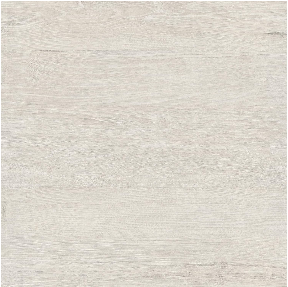
Image 6.1: Detailed view of the Linen White Oak finish. This image illustrates the texture and color of the desk's surface, which should be cleaned with a damp cloth.