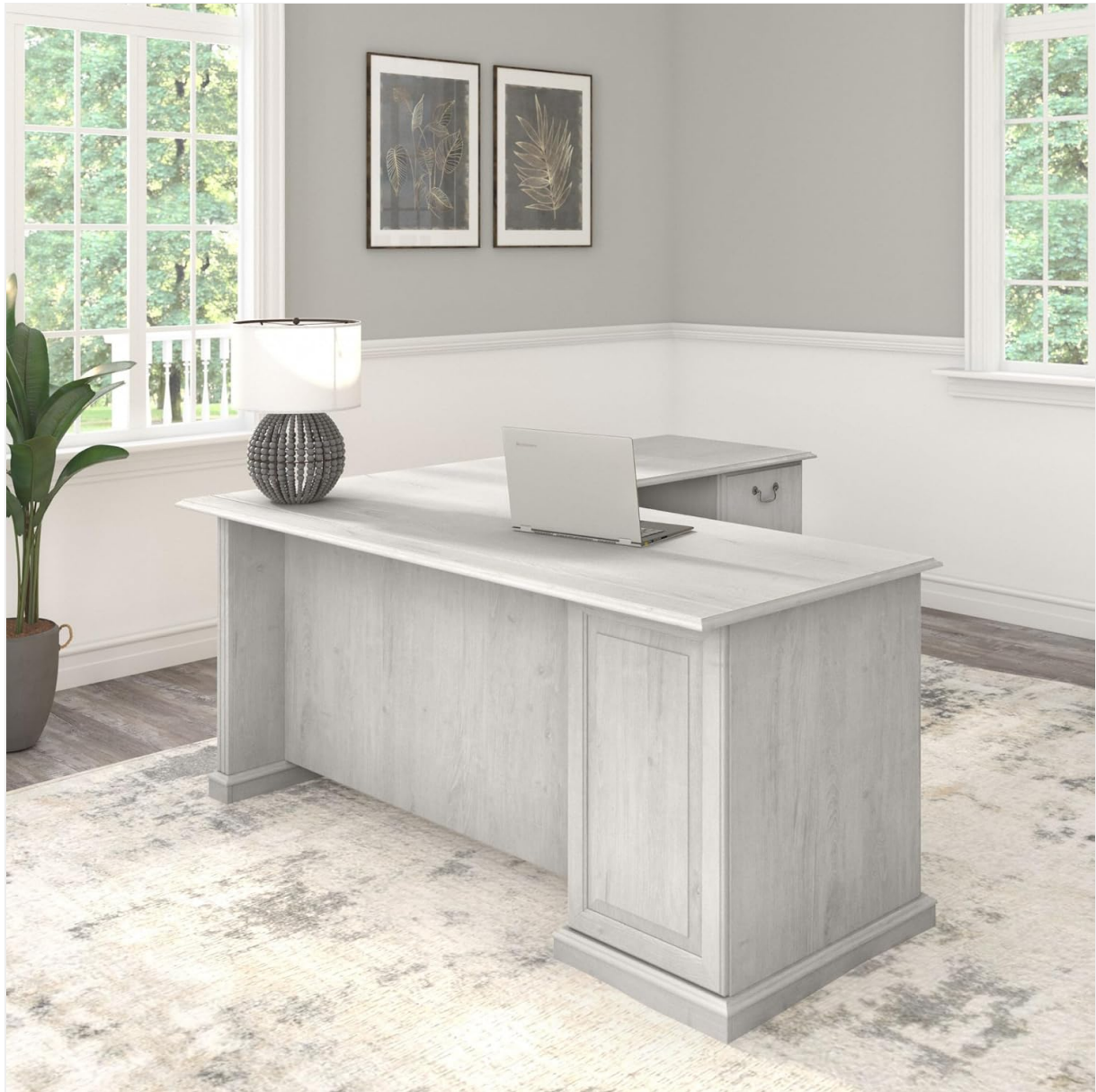
Image 4.1: Rear view of the Saratoga L Shaped Computer Desk. This perspective highlights the finished back design, allowing the desk to be placed facing any direction in a room.

The L-desk can be assembled in a right or left-handed configuration. Refer to the specific instructions in your manual for guidance on this option.