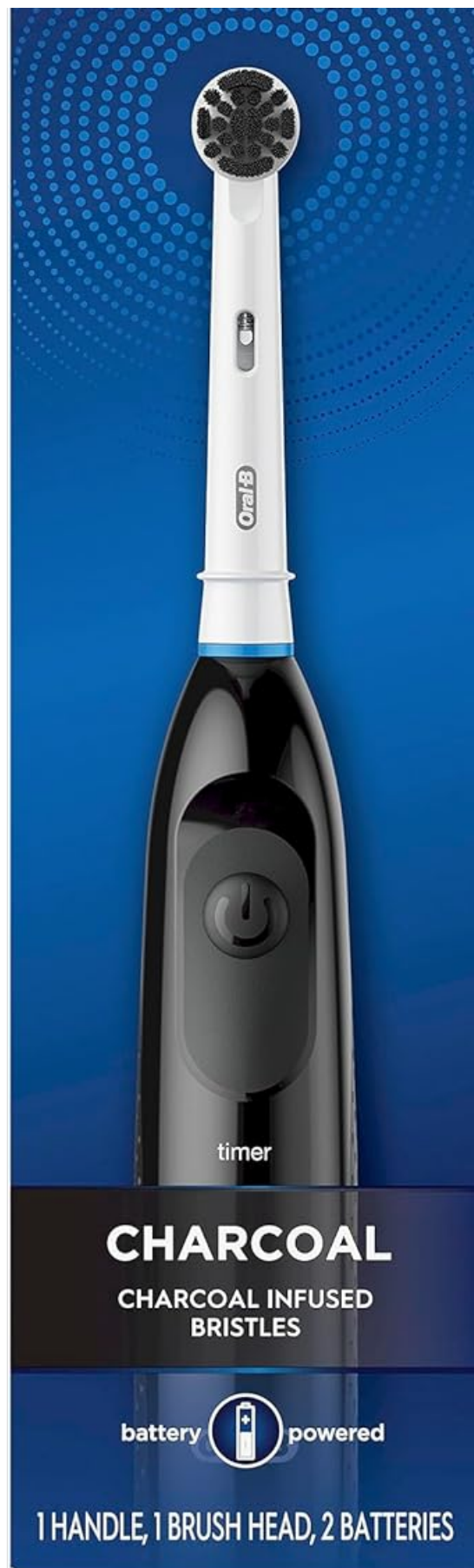
Figure 1: The Oral-B Pro 100 Charcoal Electric Toothbrush as packaged, highlighting its key features and battery-powered nature.