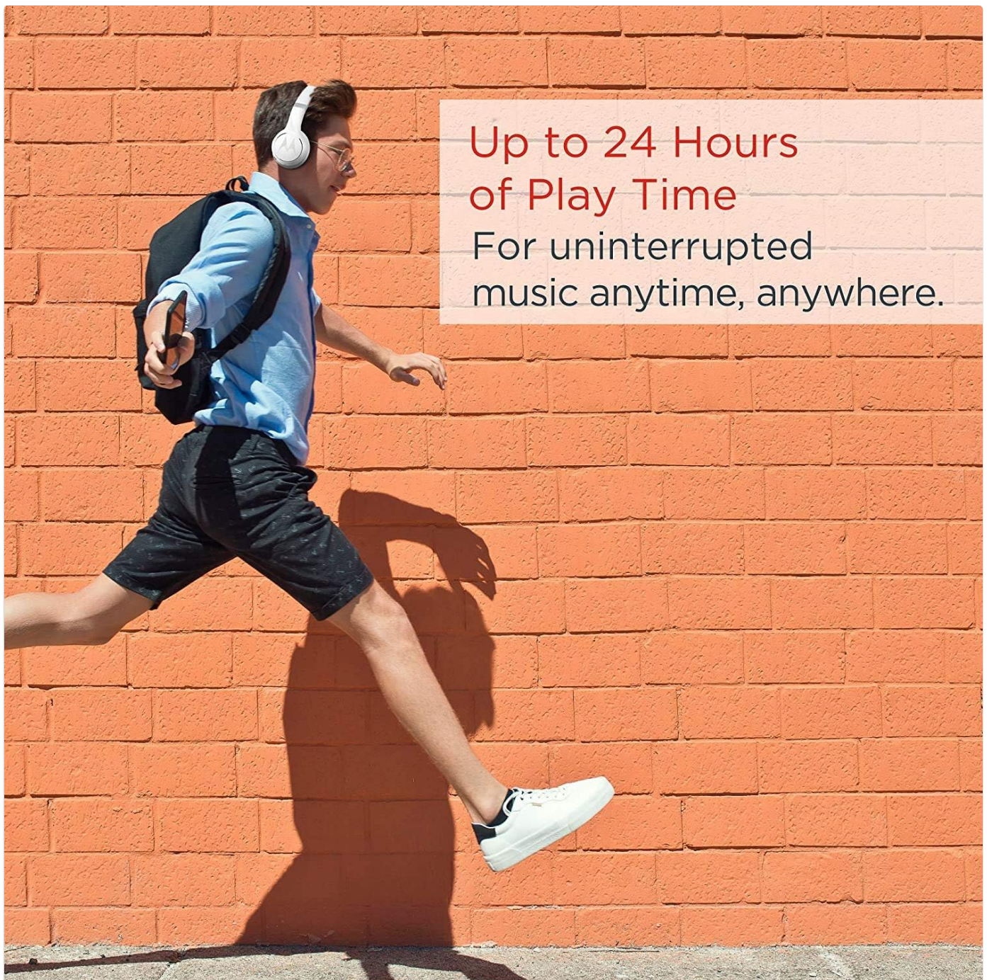
Image: A man running outdoors while wearing the Motorola Escape 220 headphones, illustrating the product's portability and long battery life for uninterrupted music.