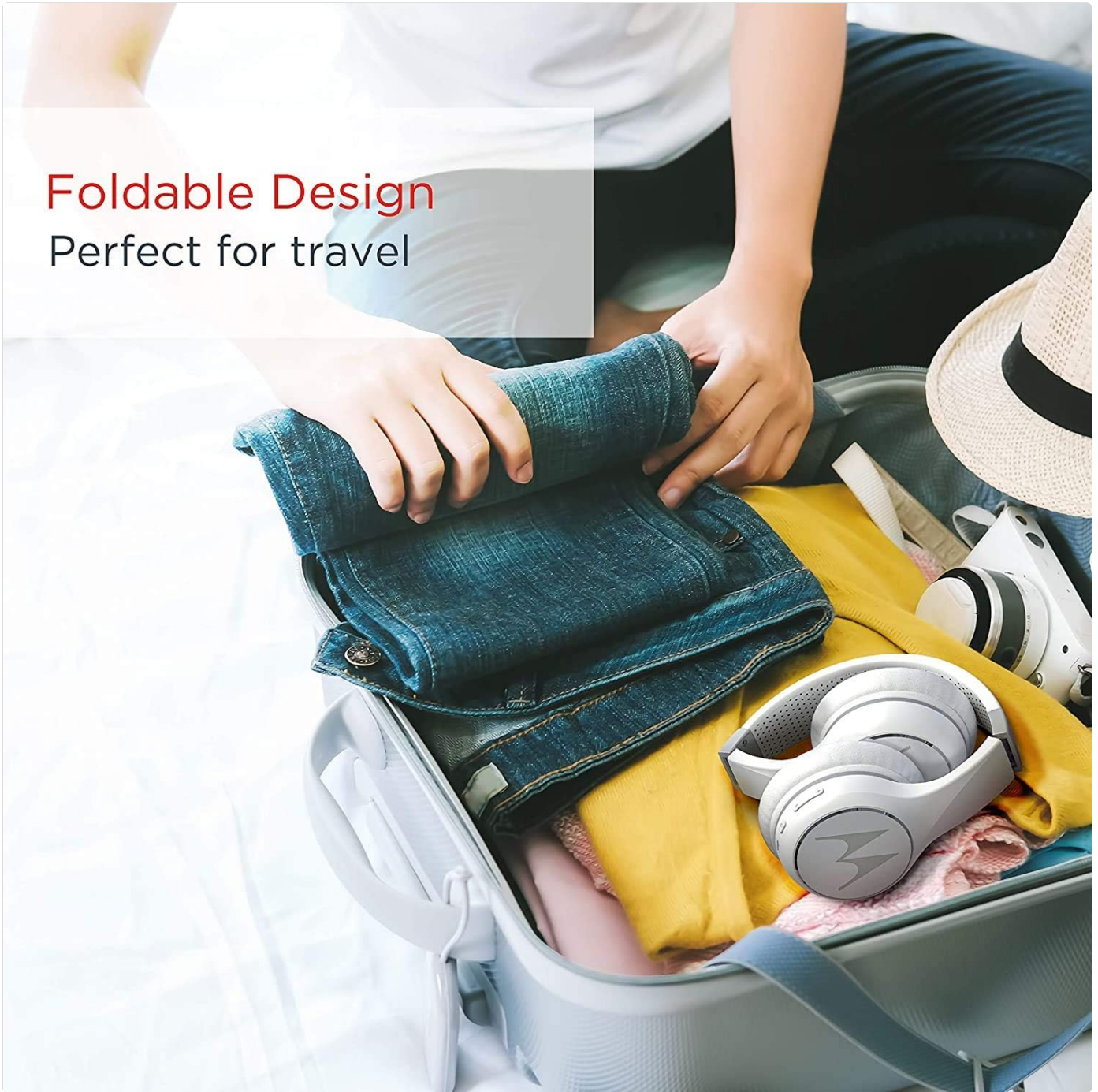
Image: The Motorola Escape 220 headphones being folded and placed into a suitcase, demonstrating their compact and travel-friendly design for easy storage.