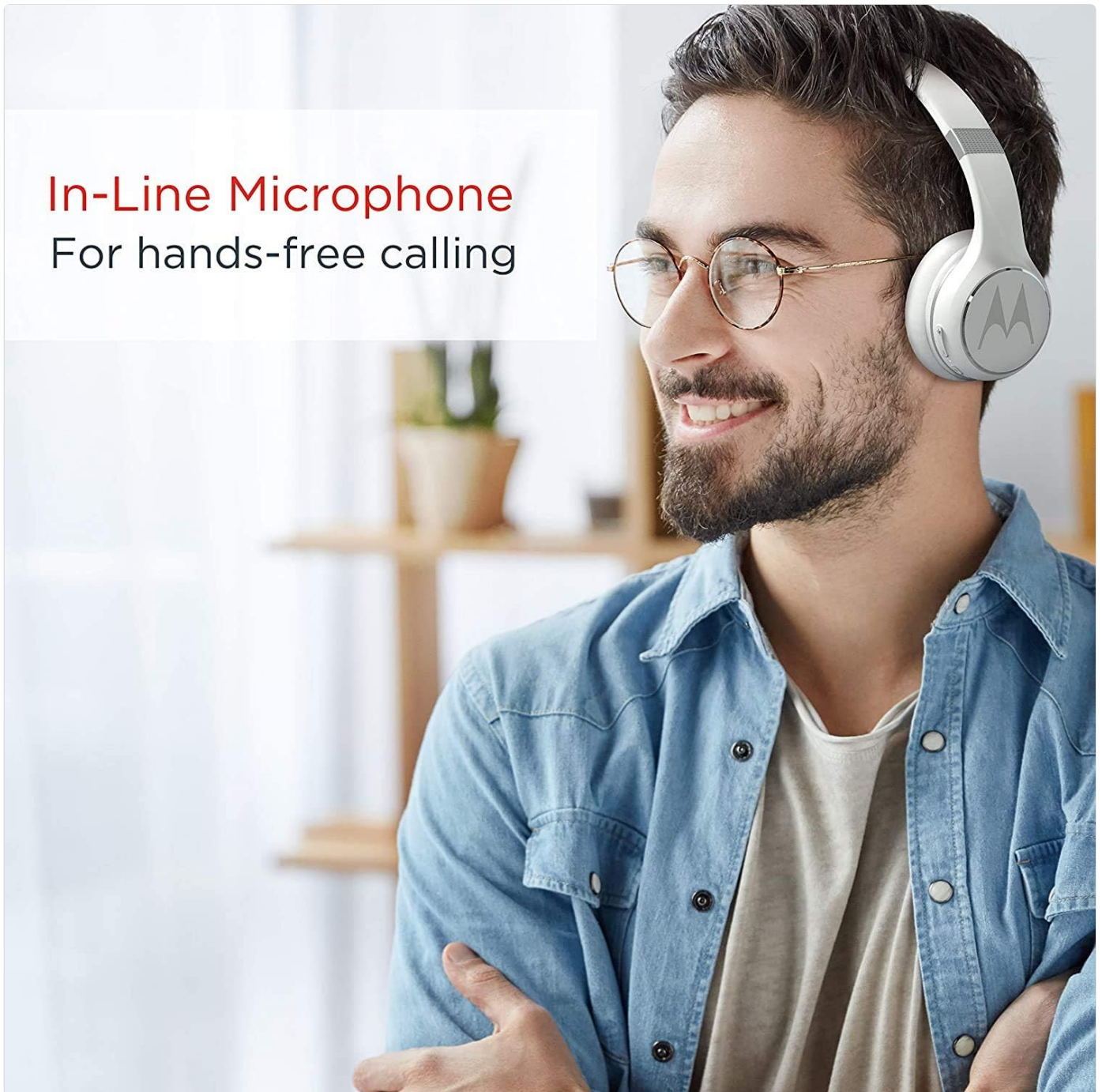
Image: A man smiling while wearing the Motorola Escape 220 headphones, emphasizing the convenience of the in-line microphone for hands-free calling.