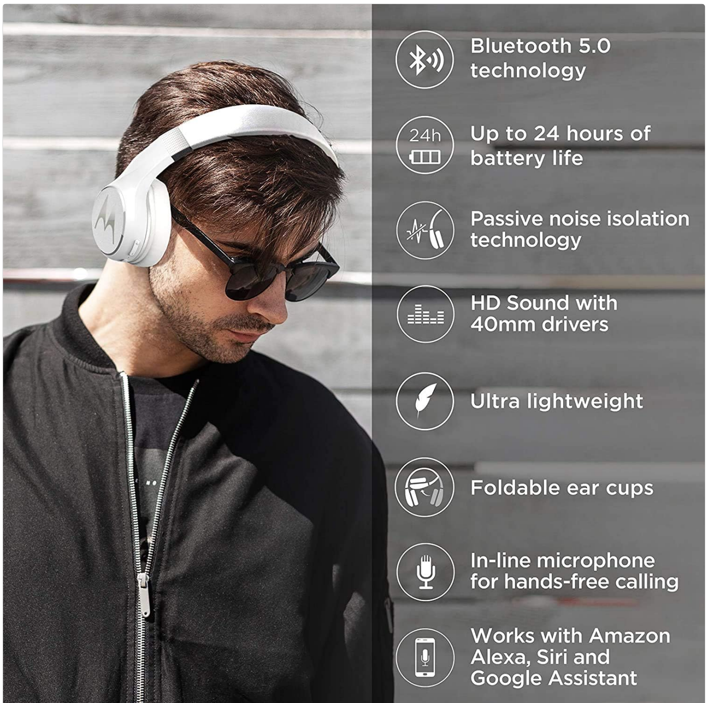
Image: A man wearing the Motorola Escape 220 headphones, with an overlay highlighting key features such as Bluetooth 5.0, 24-hour battery life, passive noise isolation, HD sound, lightweight design, foldable ear cups, in-line microphone, and voice assistant compatibility.