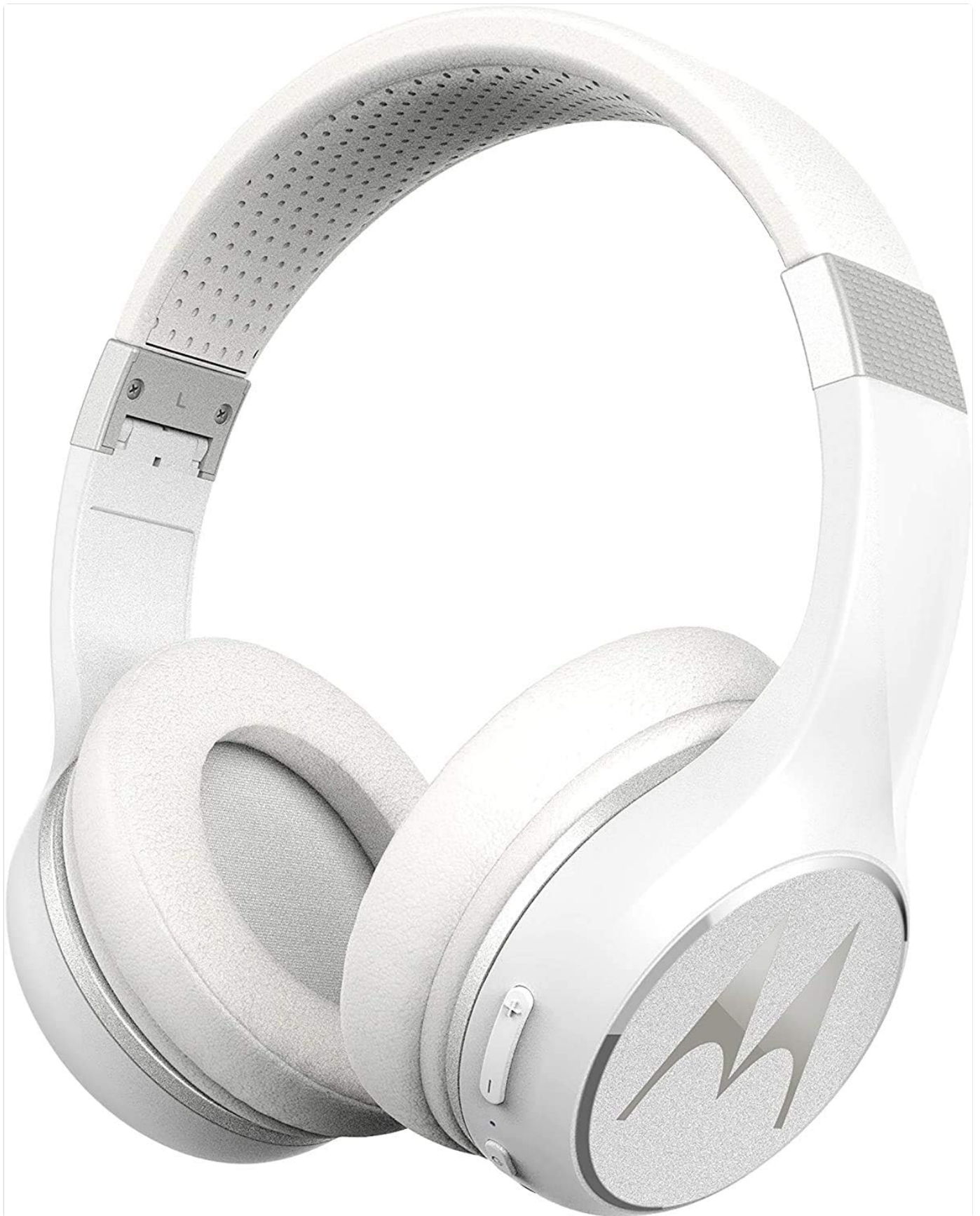
Image: Motorola Escape 220 Over-The-Ear Bluetooth Wireless Headphones, showcasing the white over-ear design with the Motorola logo on the earcups.