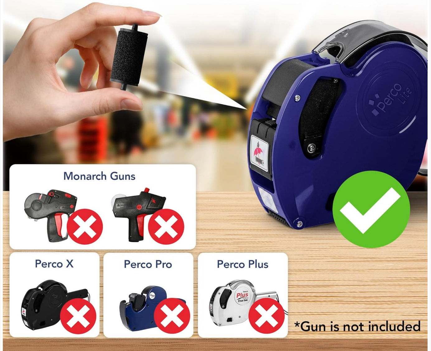
Image 2: Ink Replacement for Perco Lite Guns. This image illustrates the correct ink roller for Perco Lite guns and shows incompatible models (Monarch, Perco X, Perco Pro, Perco Plus) with red 'X' marks, emphasizing compatibility.