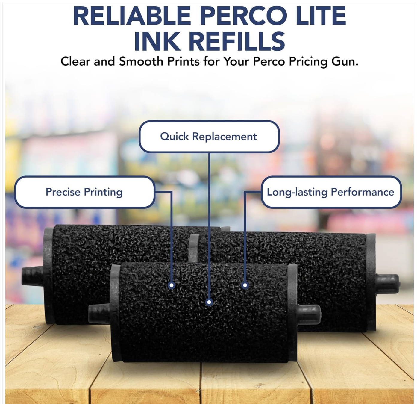
Image 5: Reliable Perco Lite Ink Refills. This image displays three ink rollers with text overlays highlighting "Quick Replacement," "Precise Printing," and "Long-lasting Performance," indicating the benefits of using these ink refills.

The Perco Lite ink rolls are designed to produce sharp and legible prints, ensuring clear and professional tags for your business needs.