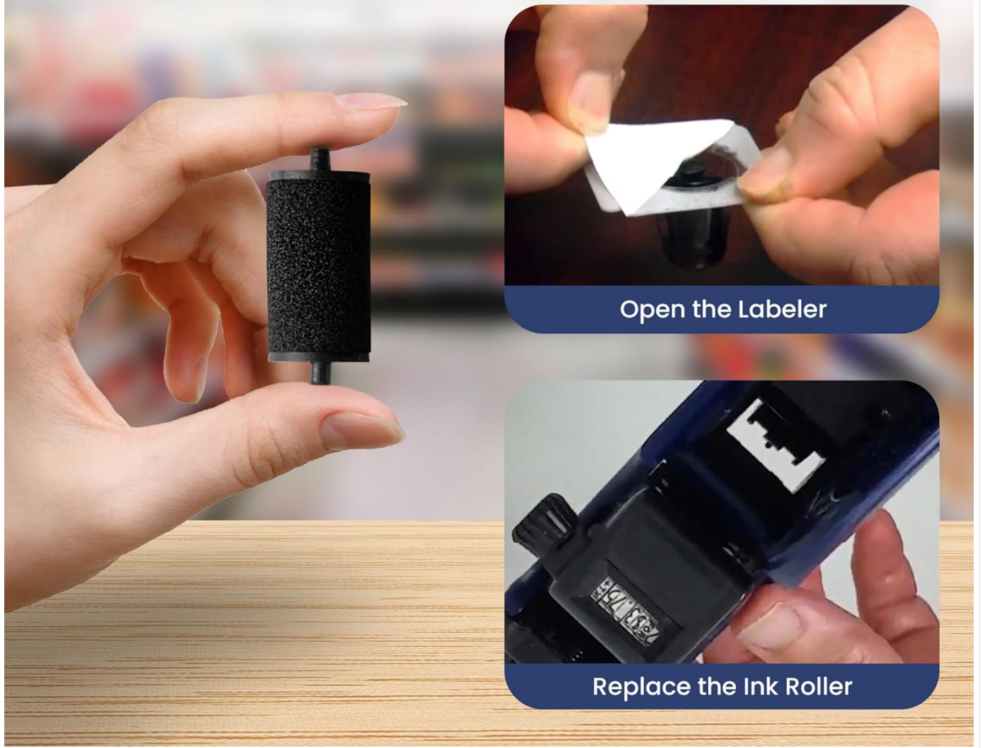
Image 3: Easy to Load Ink Roller Replacement. This image shows a hand holding a new ink roller, and two smaller images demonstrating how to open the labeler and replace the ink roller inside.