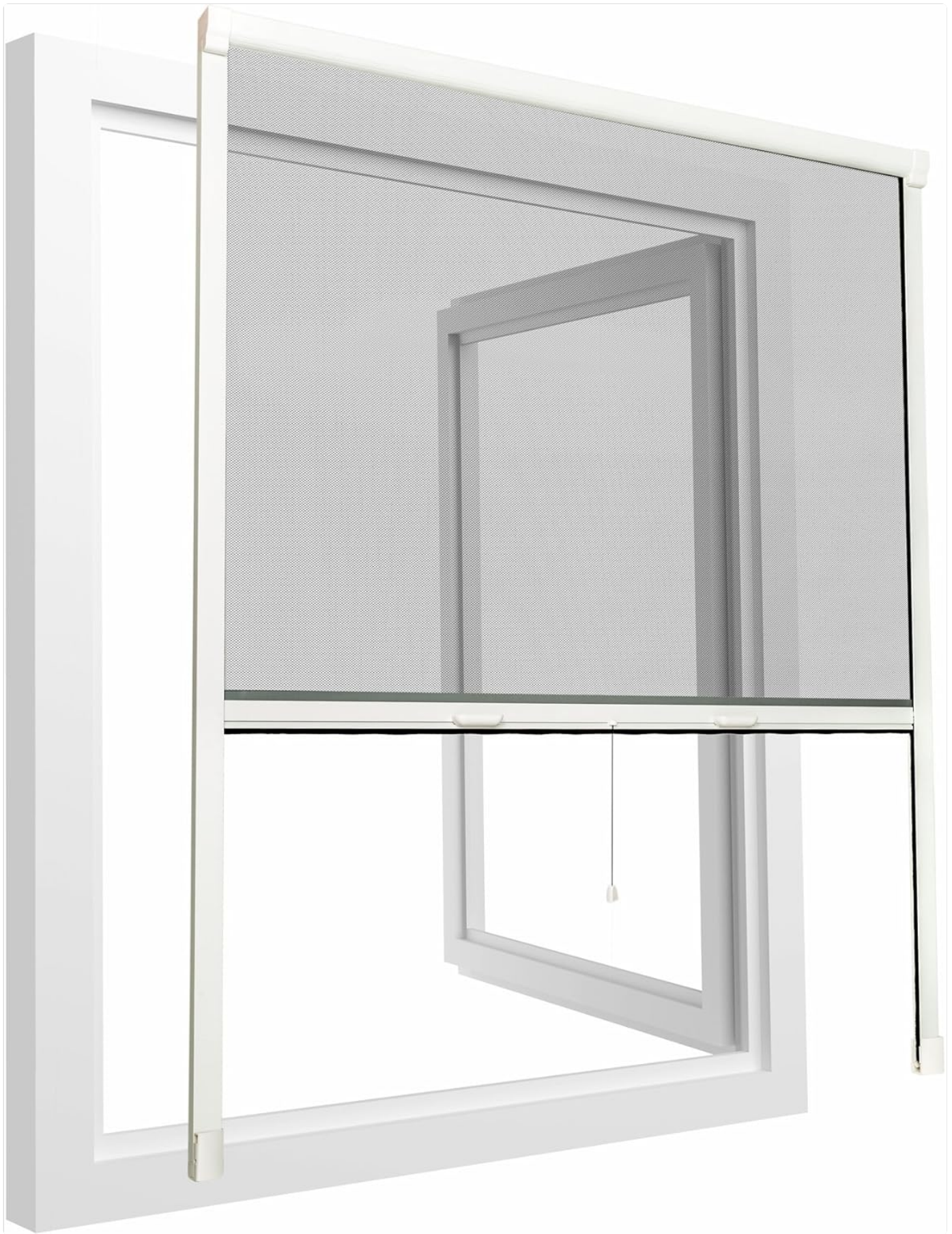
Image 4.2: The blackout roller blind installed on a window, demonstrating its appearance and fit.