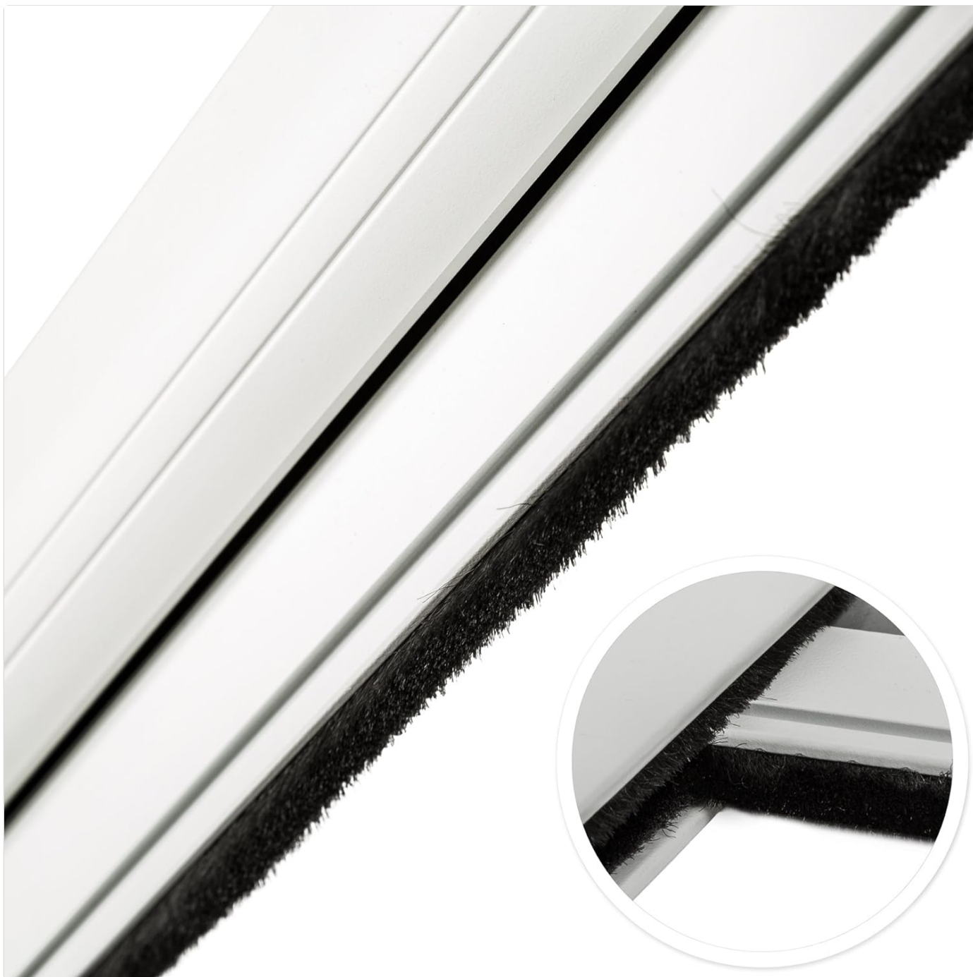
Image 6.1: Close-up of the brush seals, highlighting their role in light reduction and insect protection.