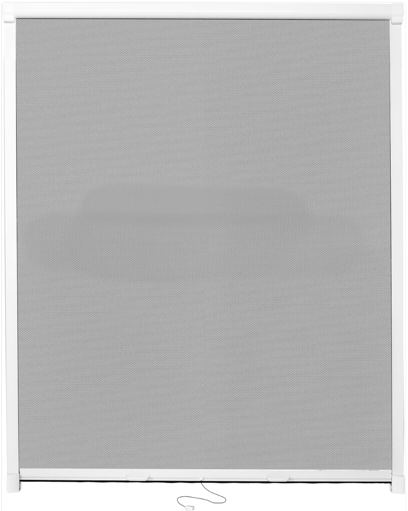
Image 1.1: Full view of the tectake Blackout Roller Blind, showcasing its design and mesh fabric.