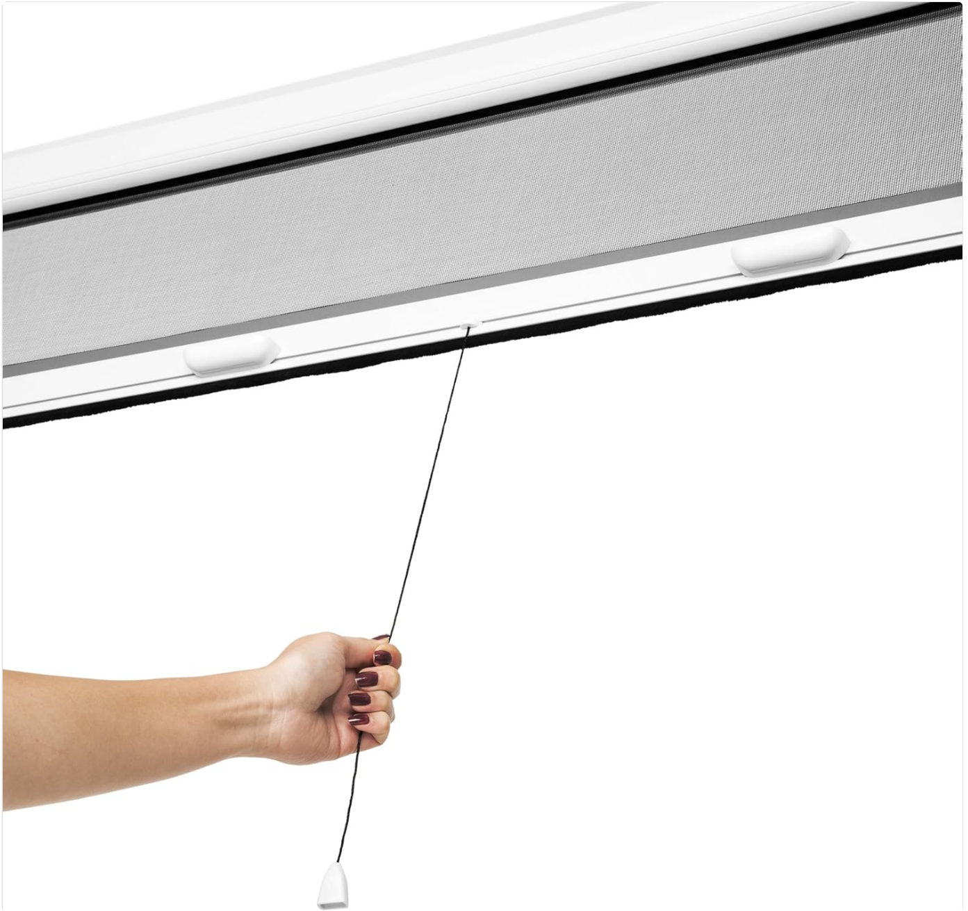
Image 5.1: A hand demonstrating the operation of the roller blind using the pull cord.