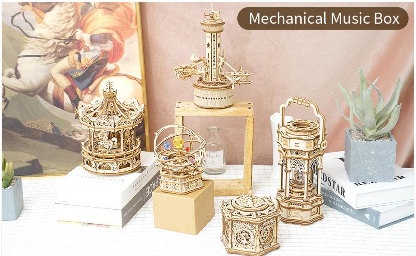
Image 5.1: Assembly in progress, highlighting the detailed wooden components.

Important Note: No official seller assembly videos are available for this specific model. Refer to the printed instruction manual for all assembly guidance.