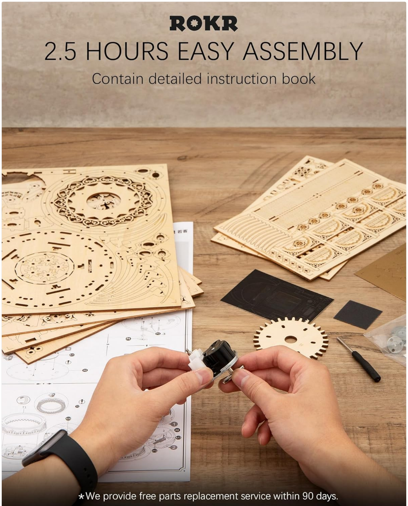
Image 2.1: Detailed view of the music box's solar system design, mechanical gears, and decorative base.