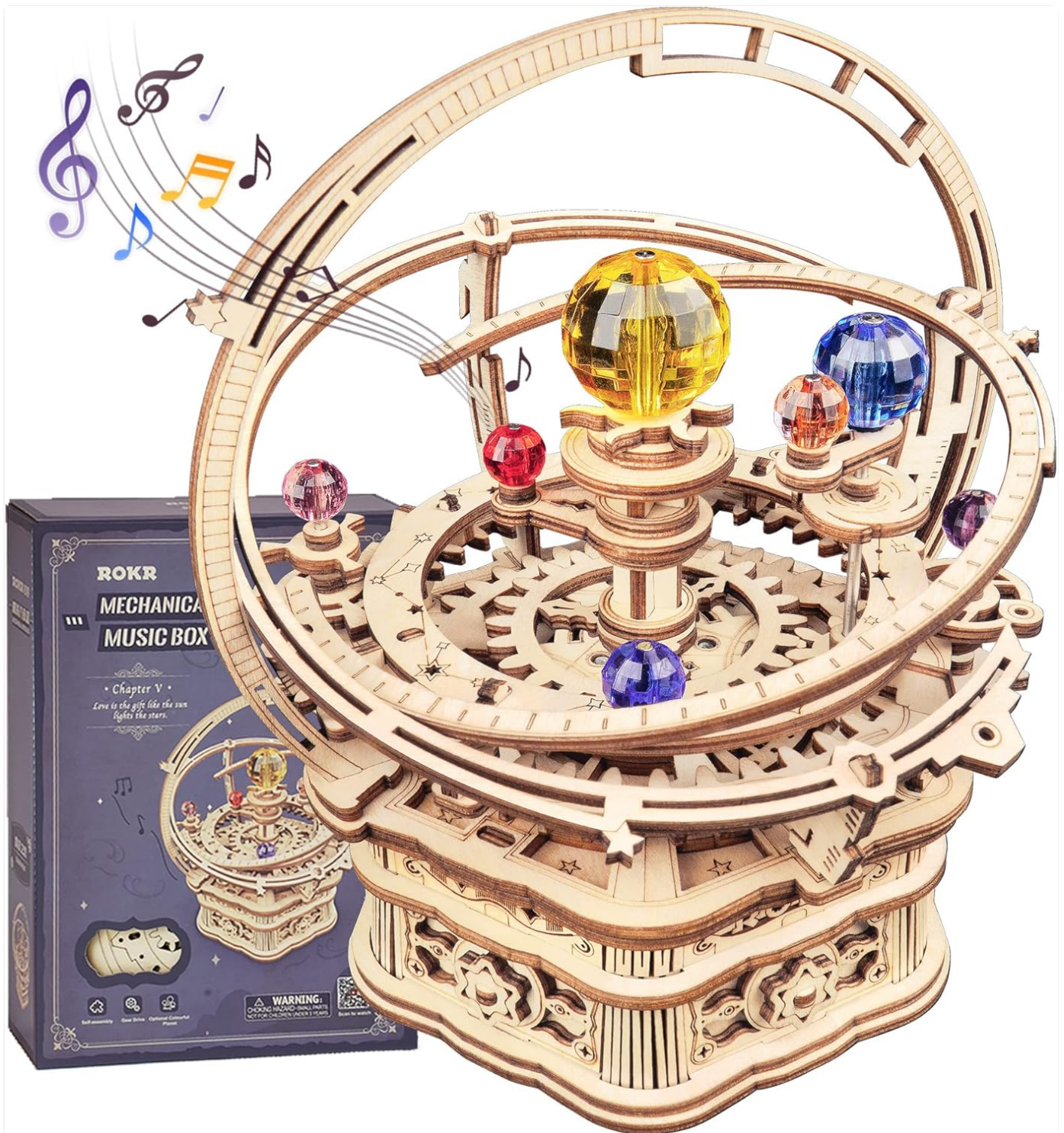
Image 1.1: The ROKR Starry Night Music Box Kit, fully assembled and playing music.