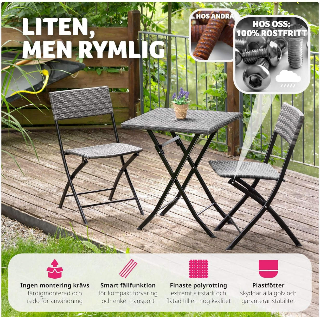
Image 6.1: Detail highlighting the 100% rust-free screws used in the construction of the furniture, ensuring longevity.