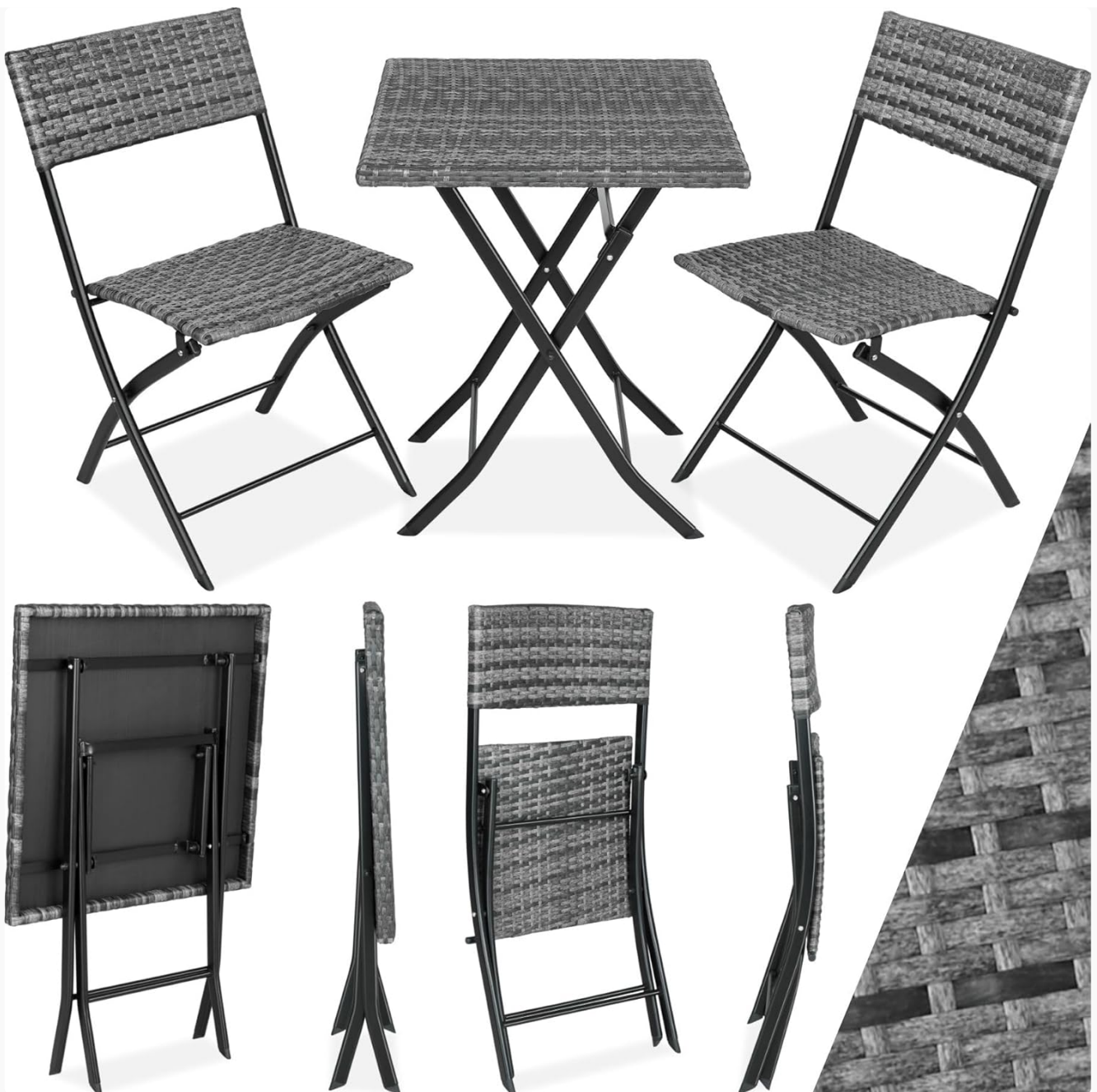
Image 1.1: The tectake Trevi Rattan Cafe Set, featuring two chairs and a table, displayed in an outdoor setting. The set is grey and has a woven poly rattan finish on a dark metal frame.