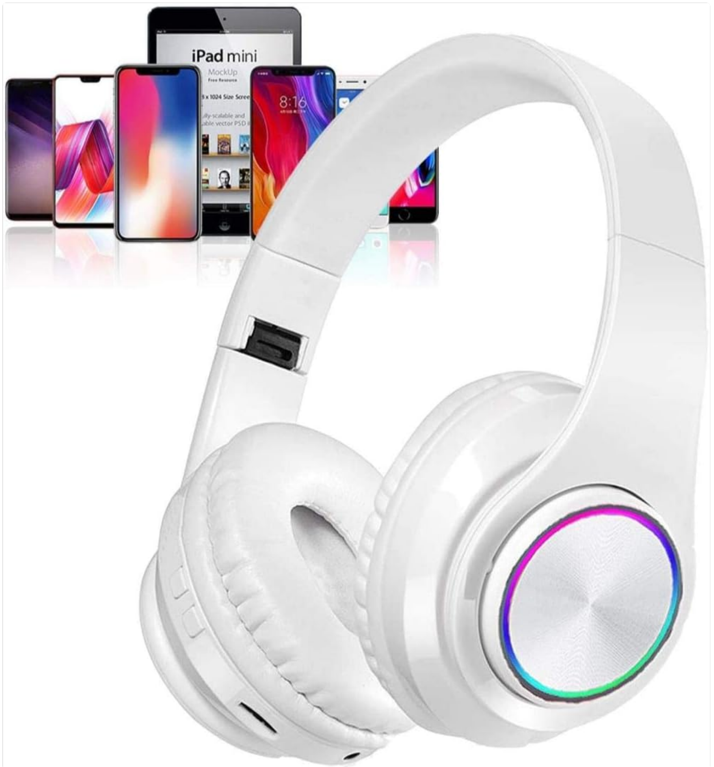
Figure 1: E-Greetshopping B39 Bluetooth Over Ear Headphones (White)