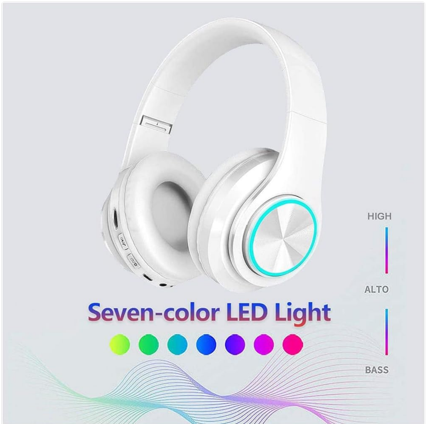
Figure 5: Colorful LED Light Demonstration

Your browser does not support the video tag.