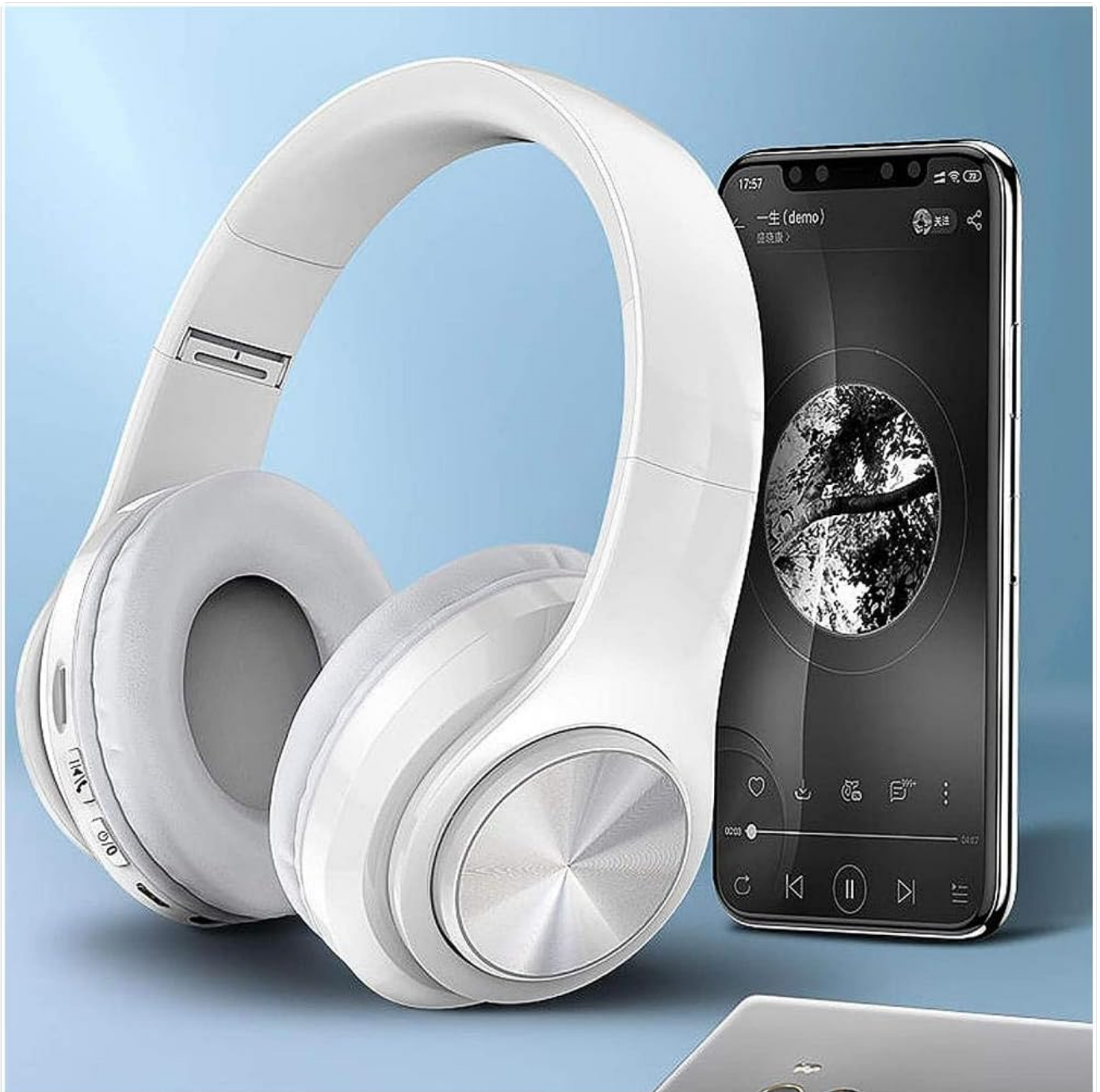
Figure 4: Headphone Controls and Ports