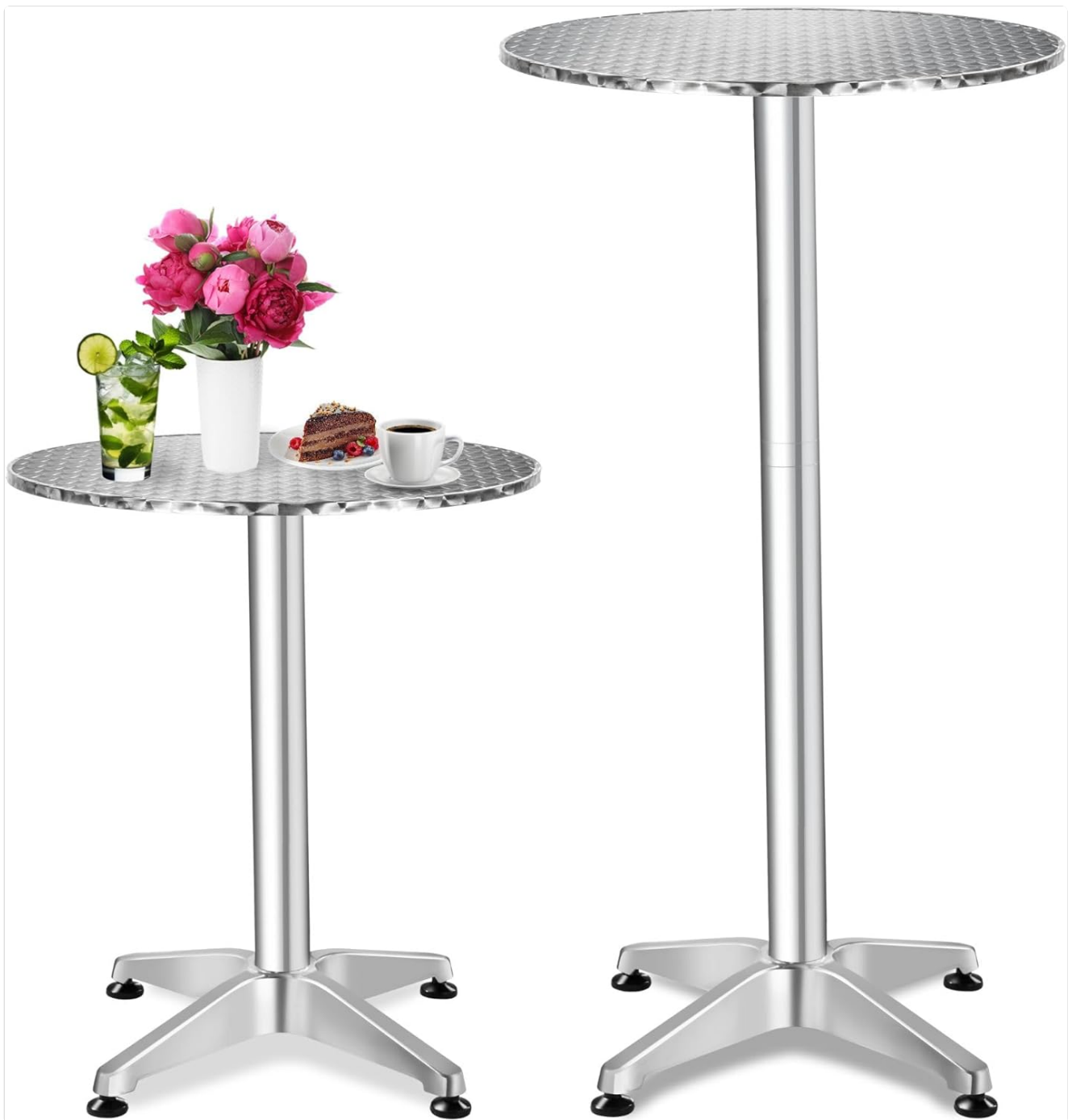
Figure 3: The tectake cafe table can be configured for two heights: 70 cm (left, suitable for dining) and 110 cm (right, suitable for standing). This versatility allows it to function as both a dining table and a bar table.