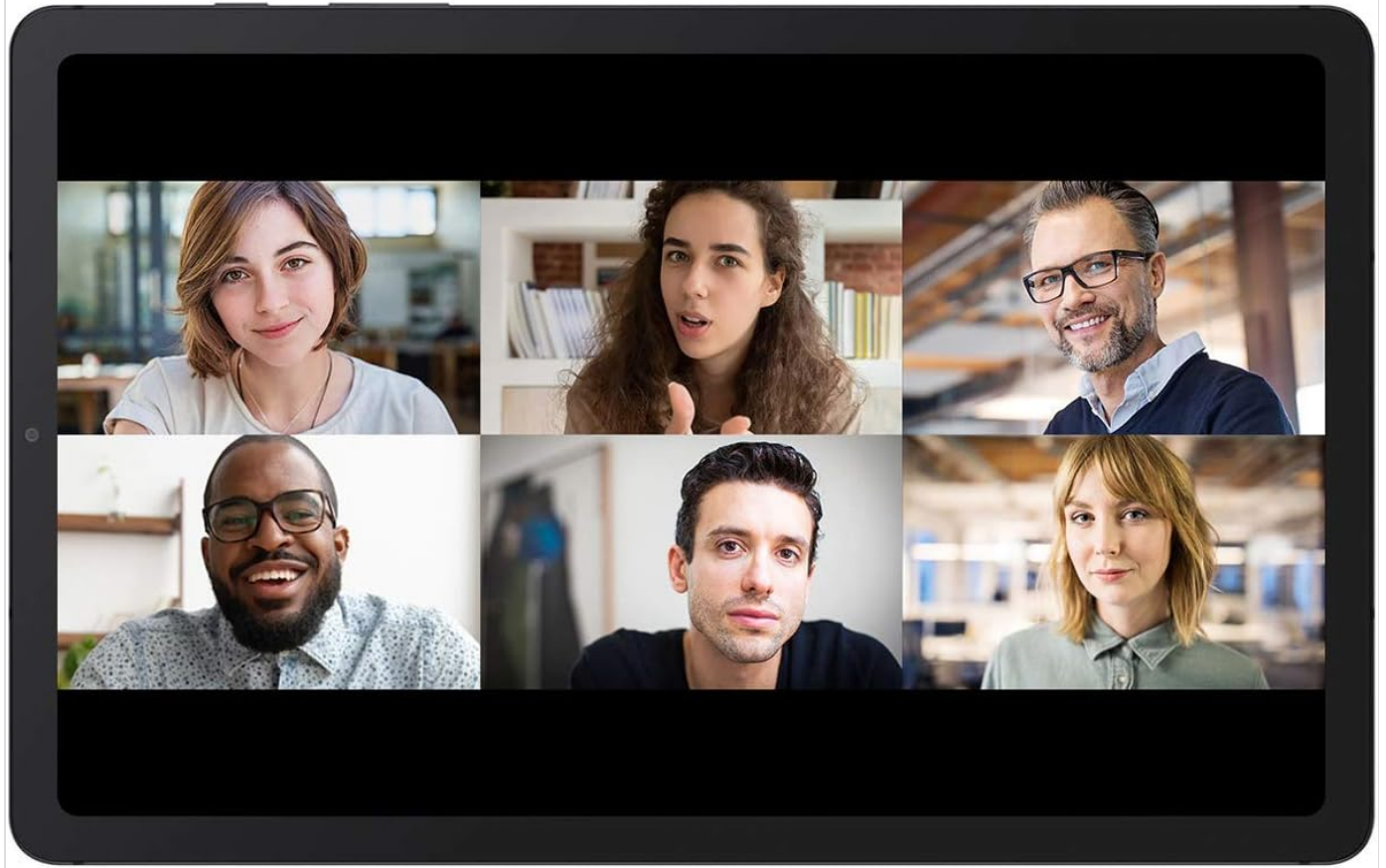
Image: The tablet display showing an active video call with several participants, demonstrating the front-facing camera's utility.

Interact with the world through the 8MP rear camera, equipped with autofocus for recording, capturing and sharing. Video chat with friends and family on the 5MP front-facing camera.