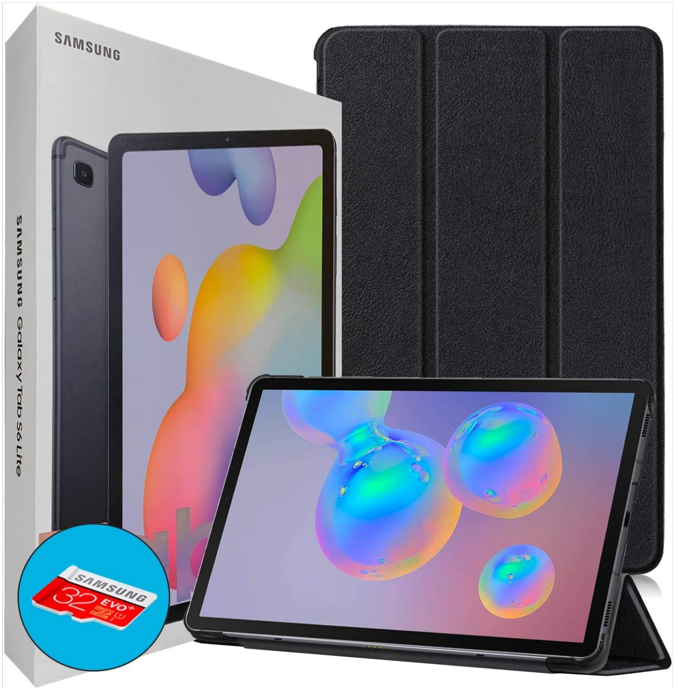
Image: The complete bundle including the tablet, S Pen, protective case, and 32GB microSD card, as packaged.