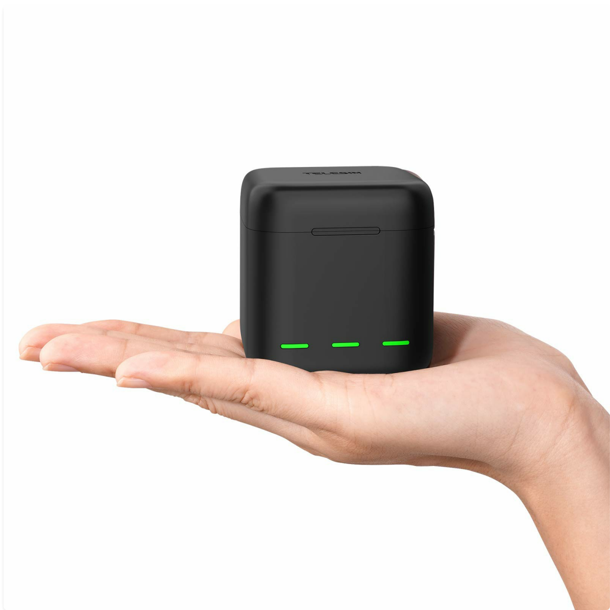
Image: The TELESIN Triple Battery Charger, a compact black cube with three green indicator lights, held in a hand.