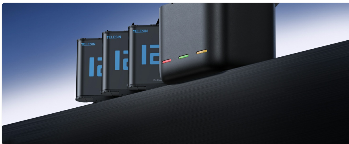
Image: The TELESIN charger connected to a wall adapter via a USB-C cable, with batteries inside, illustrating the power connection and charging process.