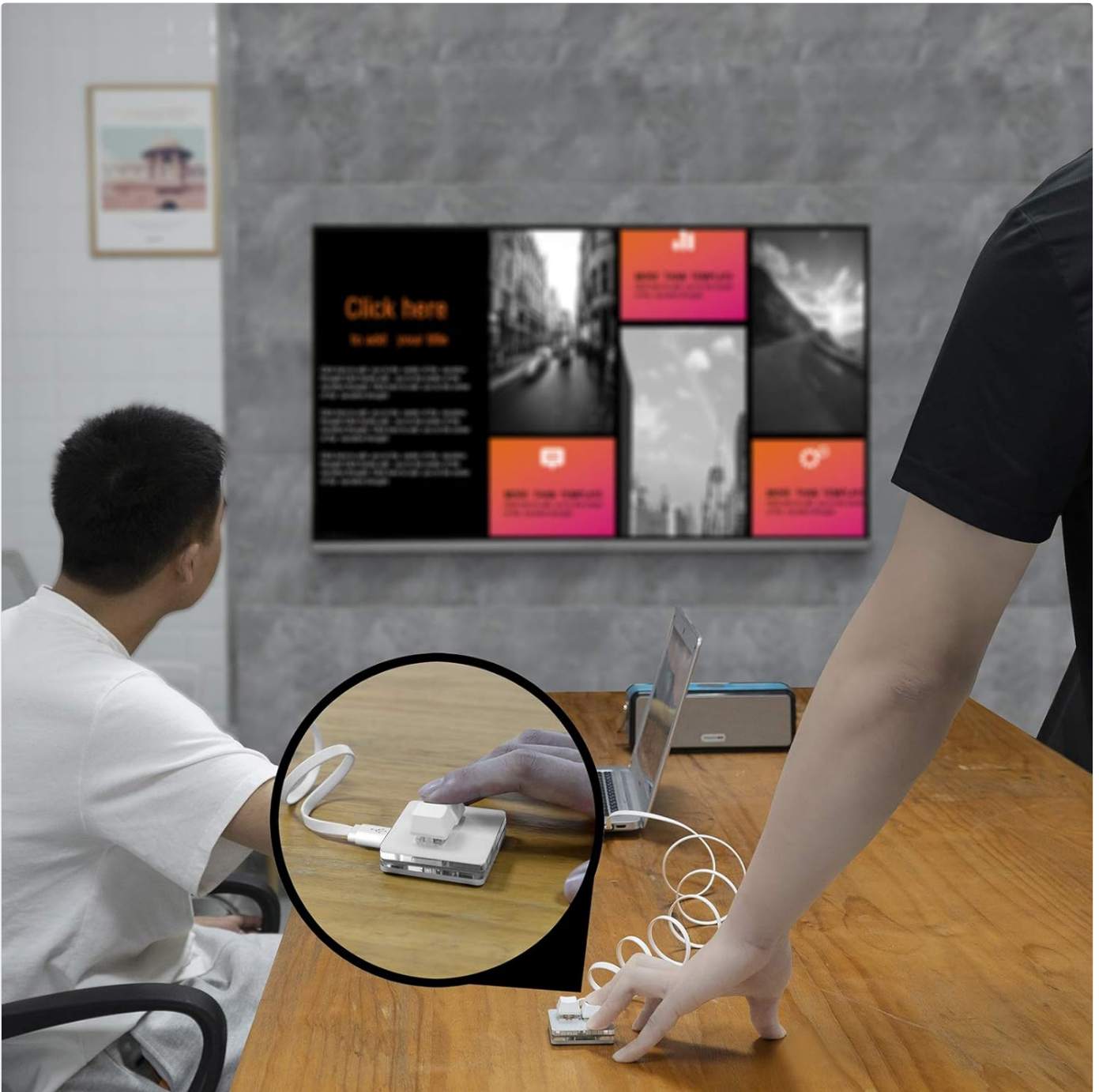
Image: A user's hand is shown pressing the Linkidea USB Zoom Meeting Button, which is connected to a laptop. In the background, a large screen displays a video conference, illustrating the device's use in a typical meeting environment.