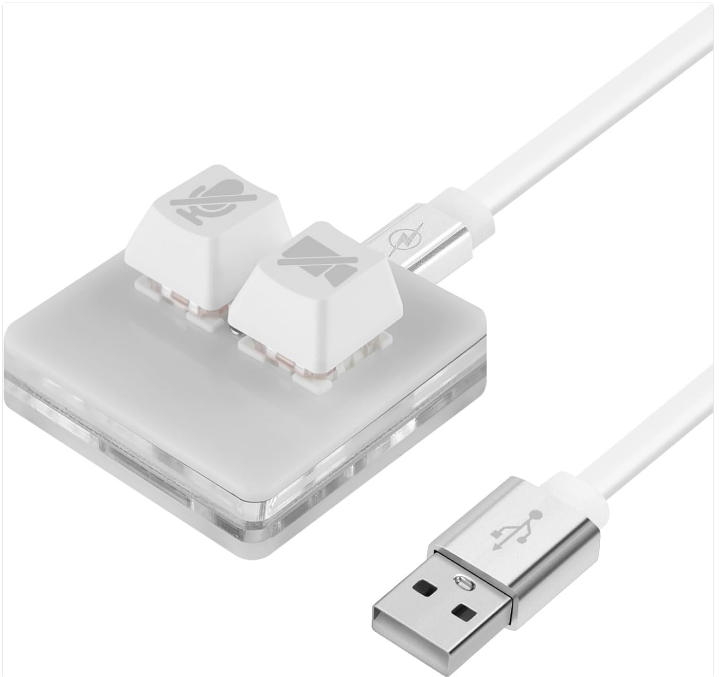
Image: The Linkidea USB Zoom Meeting Button in white, shown with its included USB-A connection cable. The button unit features two distinct keys for control.