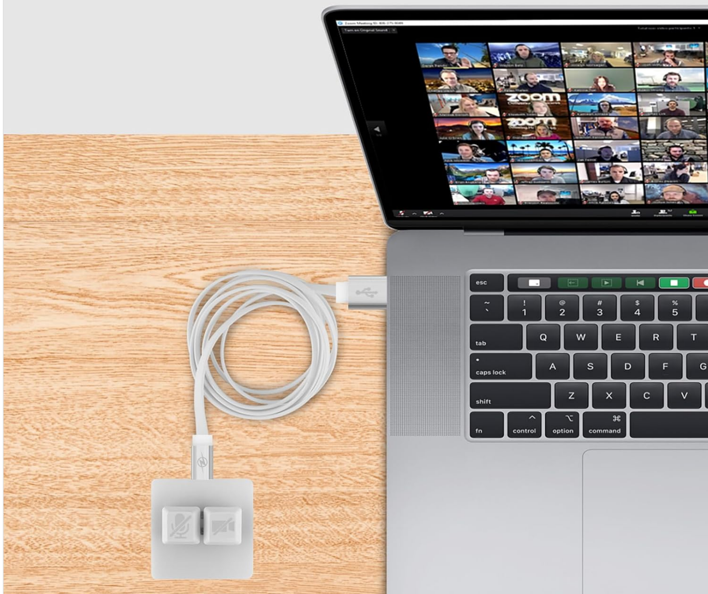
Image: The Linkidea USB Zoom Meeting Button connected via its white USB cable to a laptop, demonstrating a typical setup for use during online meetings.