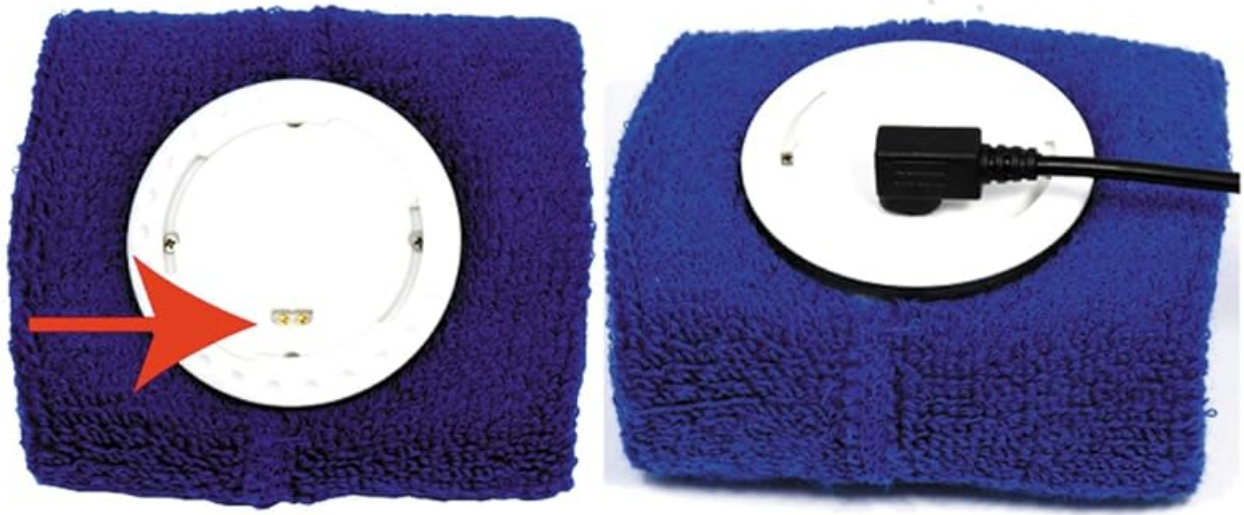
Figure 7: Step-by-step guide for detaching the watch module from the sweatband for cleaning.