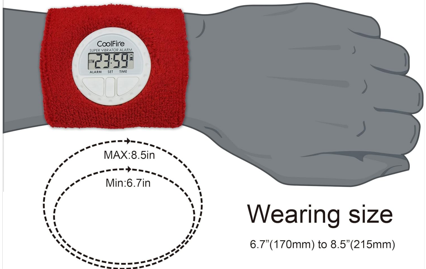
Figure 4: Illustration of the recommended wearing size for the wristband, ensuring a comfortable and effective fit.