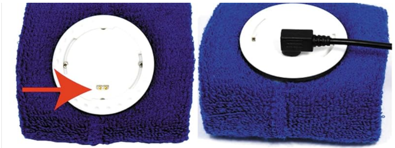
Figure 6: Visual guide for connecting the USB charging cable to the watch module.