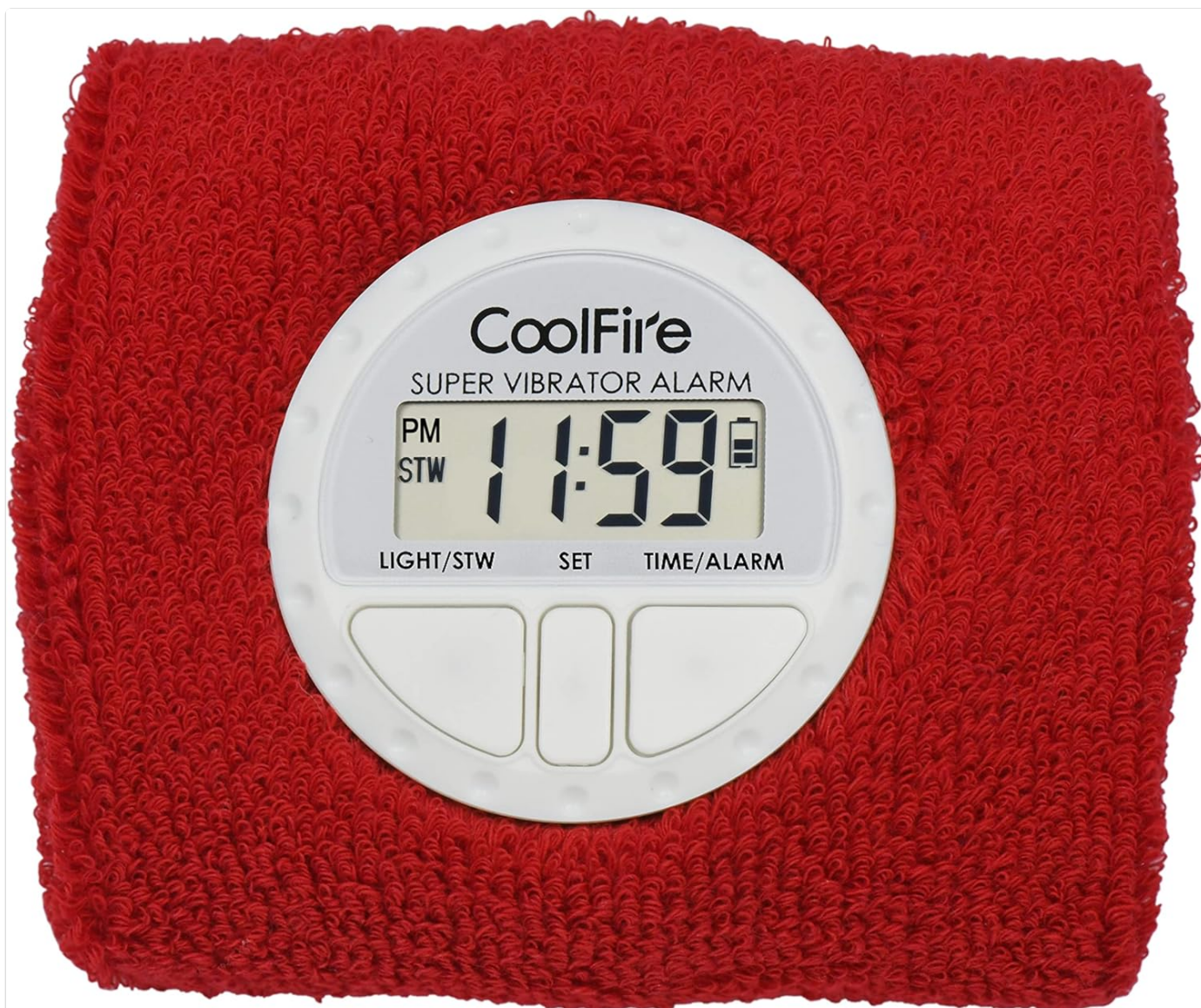
Figure 1: The Coolfire 1685N Vibrating Alarm Wristband, featuring a red fabric band and a white digital clock module.

The Coolfire 1685N is a silent and vibrating wristband alarm clock designed for discreet wake-ups and reminders. It is ideal for individuals who need to wake without disturbing others, those with hearing impairments, or anyone requiring regular, silent reminders throughout the day. This manual provides comprehensive instructions for setting up, operating, and maintaining your Coolfire vibrating alarm wristband.