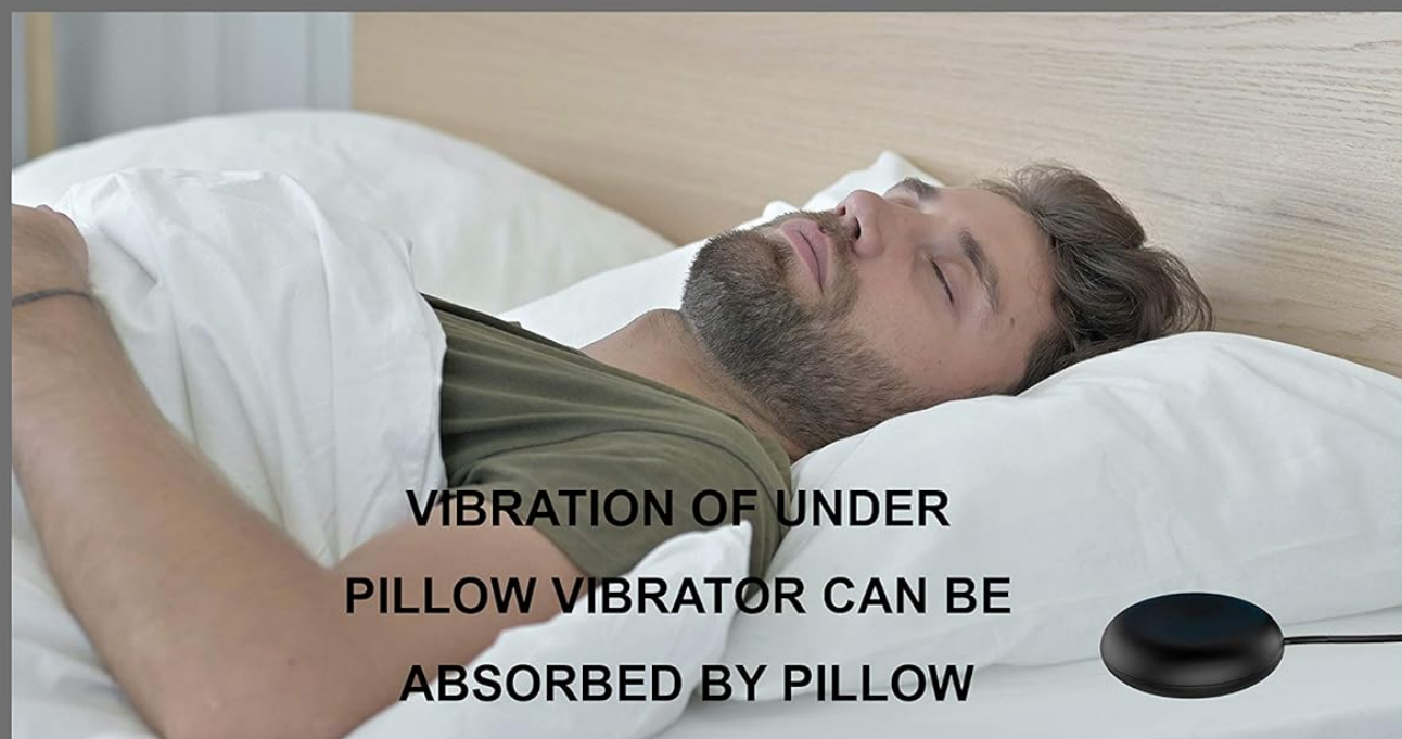
Figure 5: The wristband provides direct vibration for effective wake-up, unlike pillow vibrators which can have their vibration absorbed.