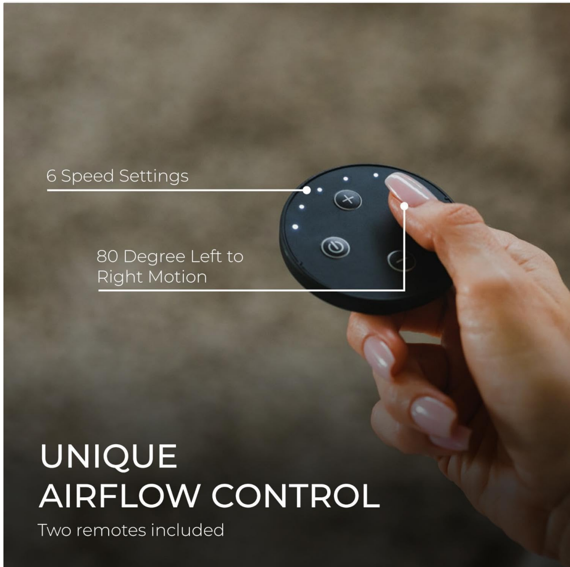
Image 3: The remote control for the Everdure Pedestal Fan, highlighting buttons for 6 speed settings and 80-degree oscillation.

Two remote controls are included for convenient operation from a distance. Store the remote in the hidden fan compartment when not in use.