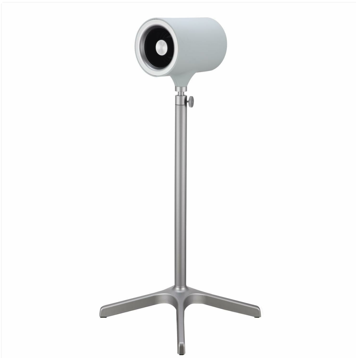
Image 2: The Everdure Pedestal Fan fully assembled, showing its 49.4-inch height and 27.6-inch base width, with a person for scale.