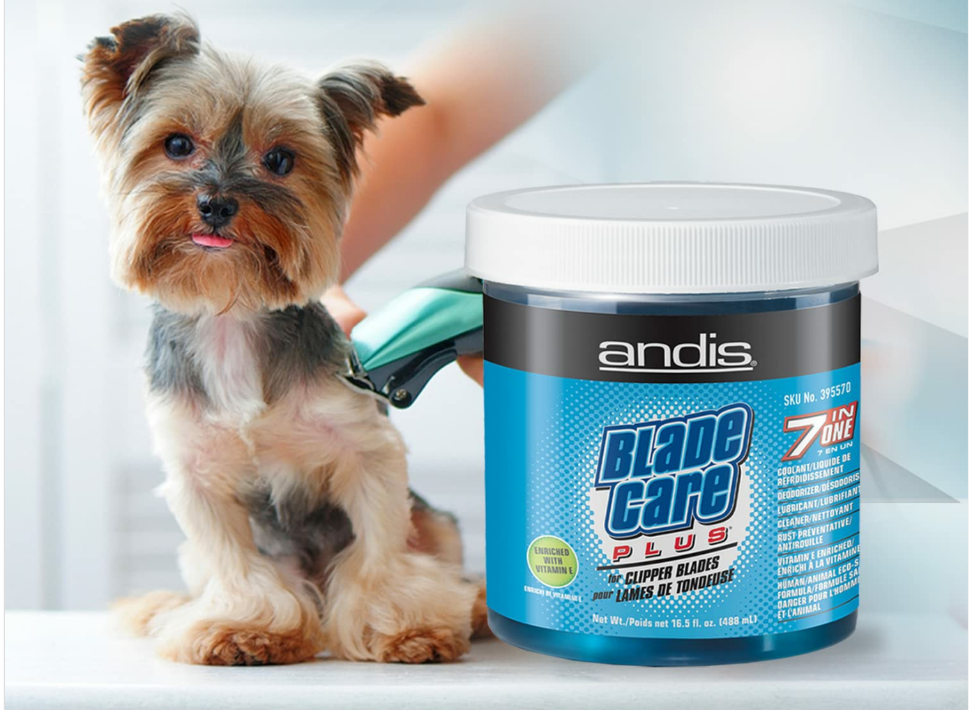
Image: Andis Blade Care Plus Jar with a small dog being groomed, demonstrating its quick and easy application and ability to wash away debris from blades.