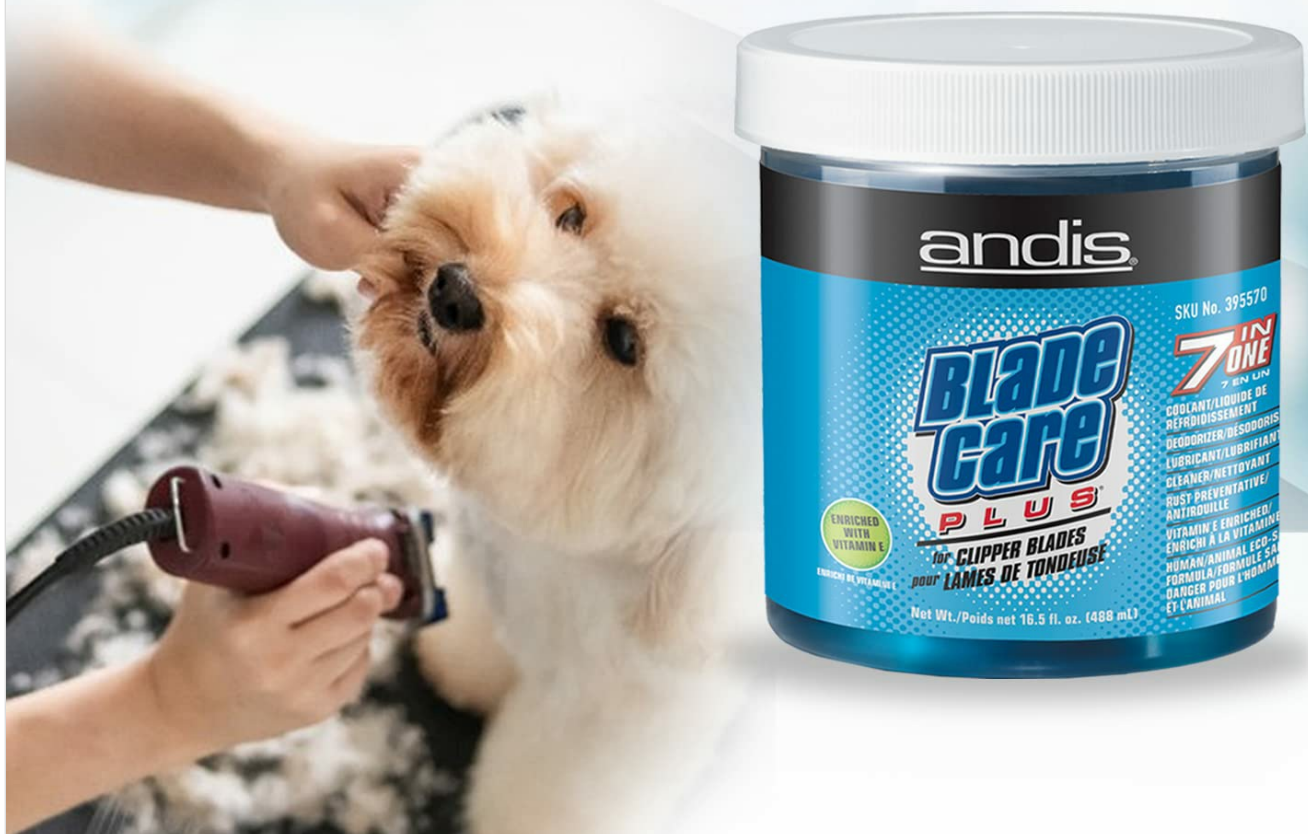
Image: Andis Blade Care Plus Jar with a dog being groomed, indicating it's ideal for use after a grooming session and features an easy-to-use dip jar design.