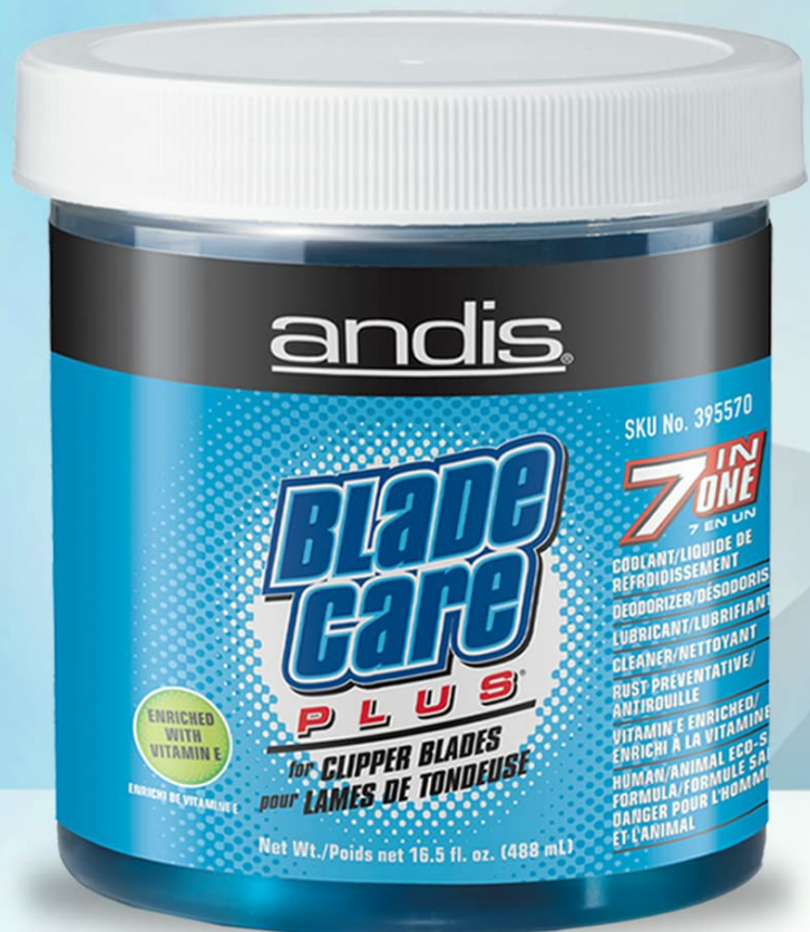
Image: Andis Blade Care Plus Jar illustrating its ability to wash away hair buildup, preservatives, and bacteria from clipper blades.