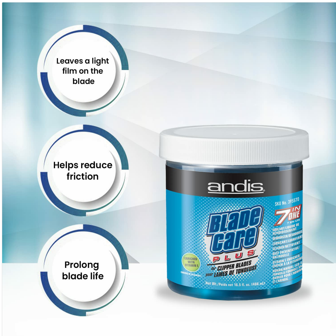
Image: Andis Blade Care Plus Jar highlighting its benefits: leaving a light film on the blade, reducing friction, and prolonging blade life.