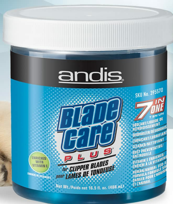
Image: Andis Blade Care Plus Jar next to a golden retriever puppy, illustrating that the product ensures optimal performance within 10 seconds, leaving blades clean, lubricated, and cool.