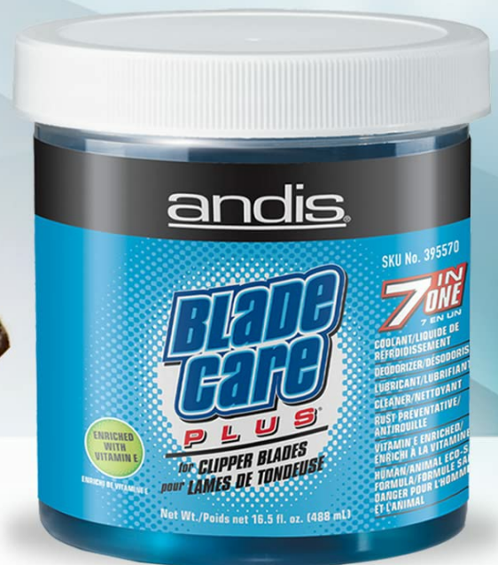
Image: Andis Blade Care Plus Jar with a hand holding an Andis clipper, highlighting that the solution contains Vitamin E, a natural decontaminant, and maintains Andis clippers and trimmers.