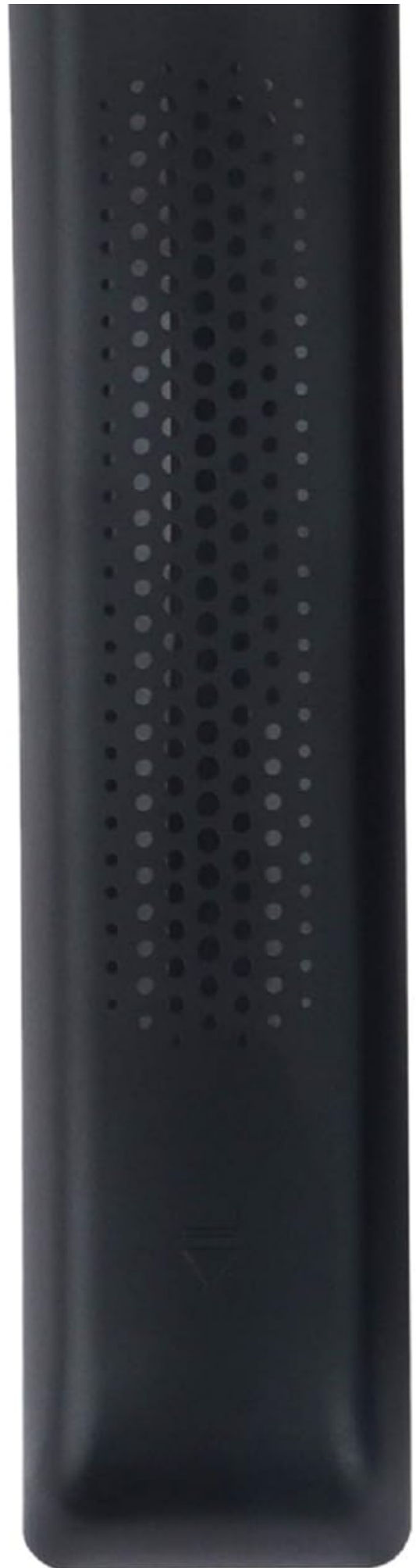
Figure 1: Battery compartment on the back of the remote.