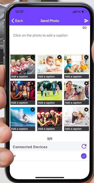
Image: A visual guide to how the OurPhoto app works, showing steps for plugging in, connecting to Wi-Fi, creating an account, and adding photos via app, email, Facebook, or Twitter.