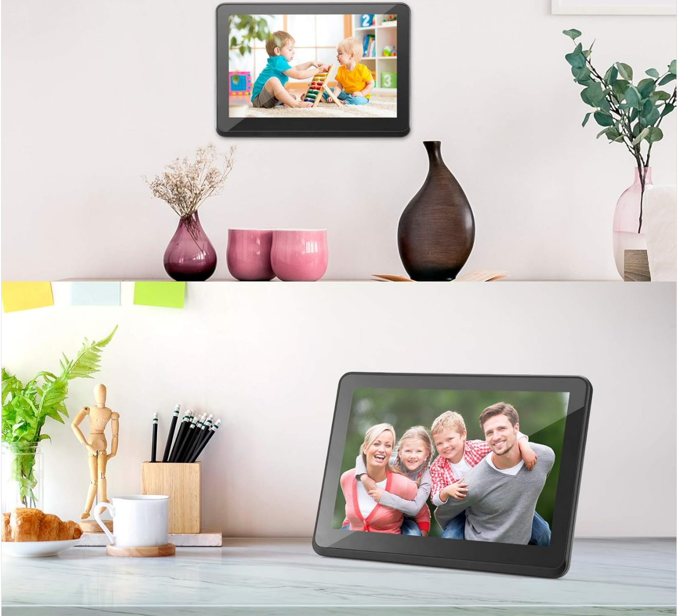
Image: The YEEHAO P802 Digital Picture Frame showcasing its 8-inch screen with a family photo, highlighting its Full HD 1920x1080 resolution and various features like Wi-Fi, video, photo, music, calendar, weather, alarm, and caption display.