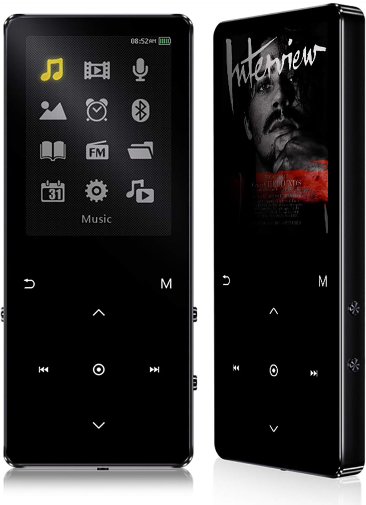
Image: Front and side view of the Tengsen X15 MP3 Player, showcasing its sleek design and screen.