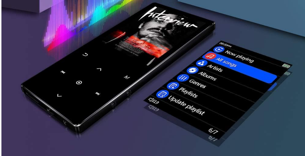
Image: The Tengsen X15 MP3 Player showcasing its HiFi sound quality capabilities and listing supported audio formats.

MP3, WMA, APE, FLAC, WAV, AAC-LC, ACELP etc