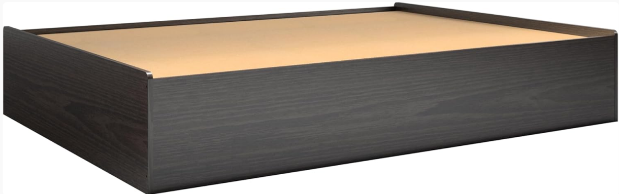
Figure 4.1: Assembly overview and recommendations.

Please refer to the detailed assembly manual included in your packaging for step-by-step instructions, diagrams, and hardware identification. Organize all parts and hardware before you begin.