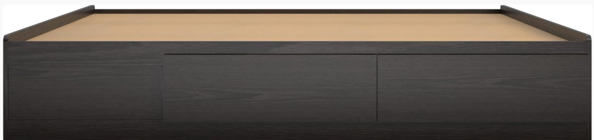
Figure 5.2: Close-up of an open storage drawer.