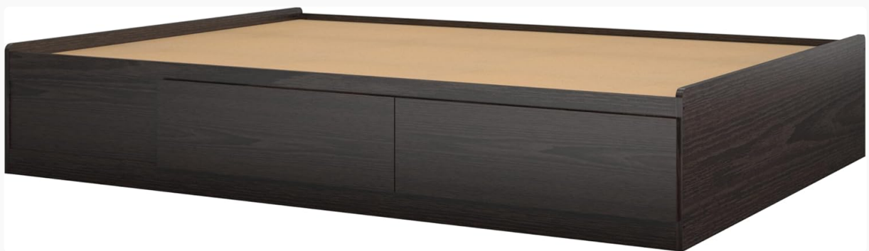
Figure 1.2: Front view of the Ameriwood Home Full Platform Bed with Drawers.