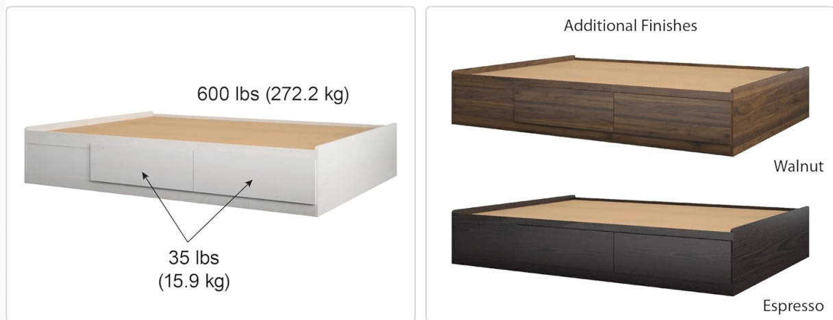
Figure 4.2: Product dimensions and weight capacities.