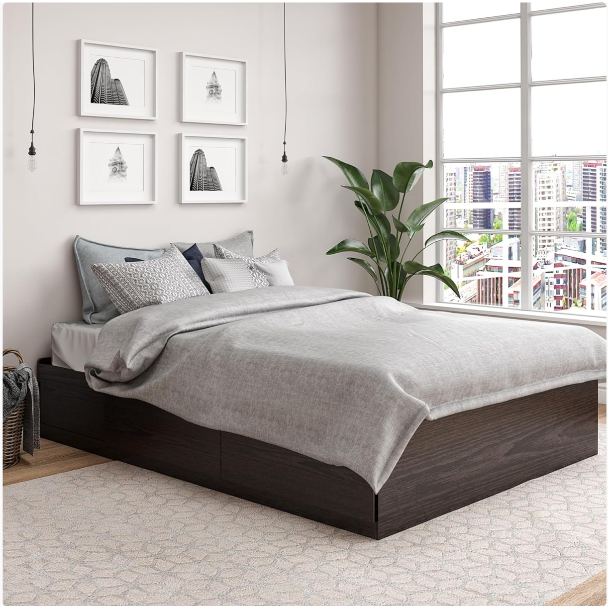
Figure 1.1: Ameriwood Home Full Platform Bed with Drawers (Espresso finish) in a bedroom setting.