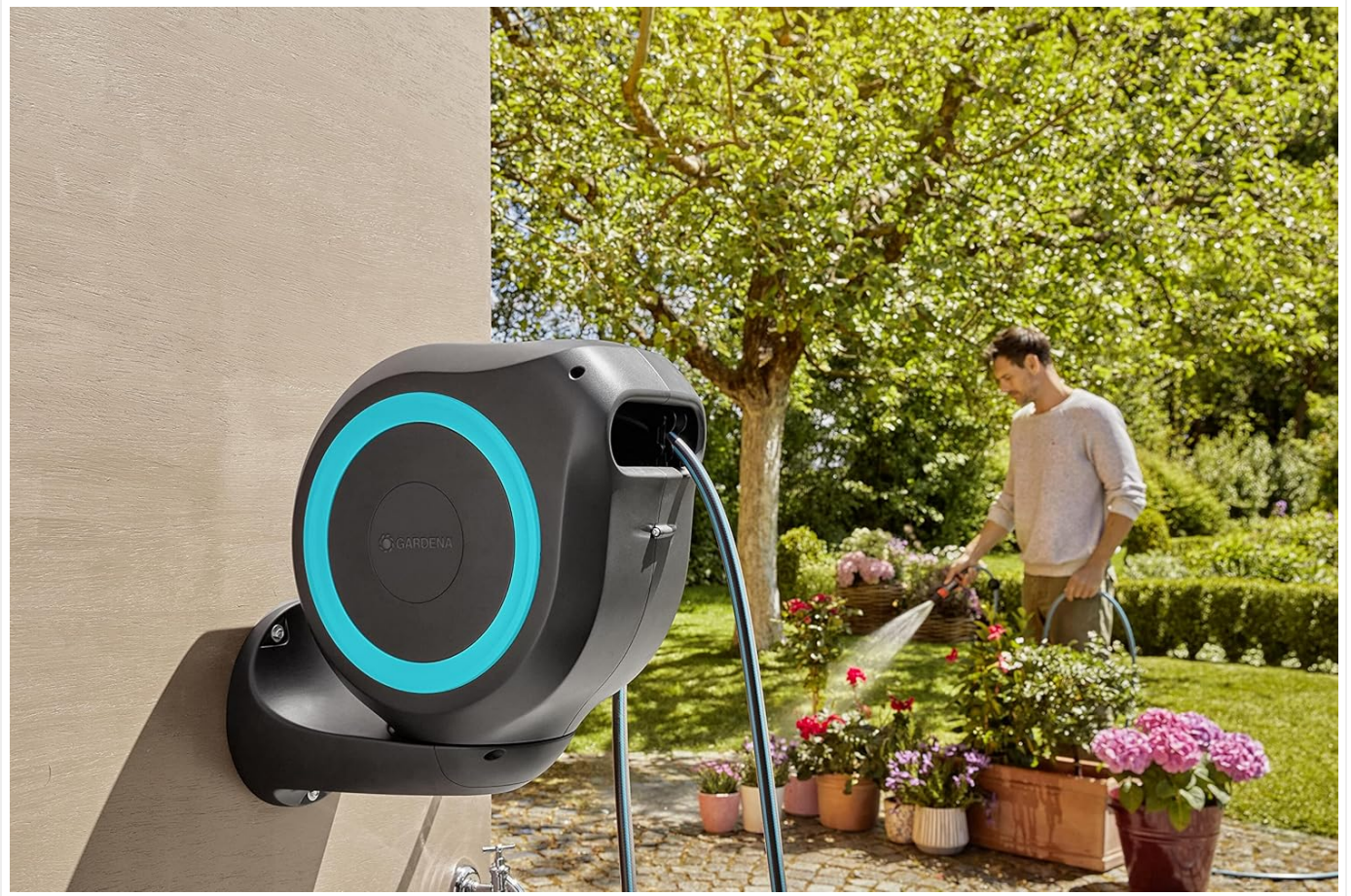
Image: Gardena Wall-Mounted Hose Box installed on a wooden wall, ready for use in a garden setting.