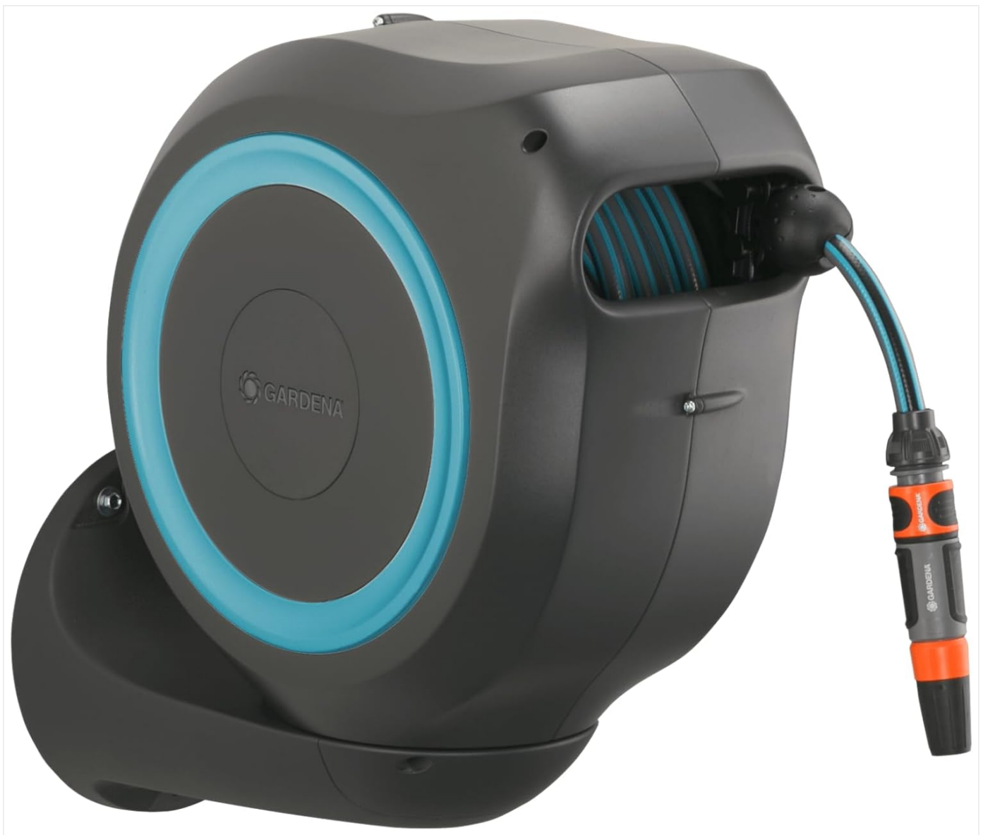
Image: Gardena Wall-Mounted Hose Box Rollup M 20m, showing the main unit with hose and nozzle.