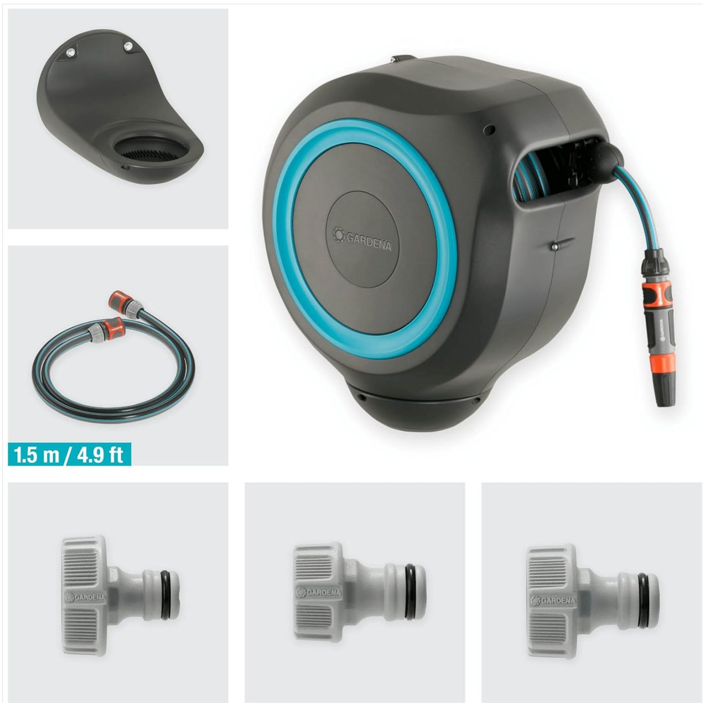
Image: Gardena Wall-Mounted Hose Box showing the hose being retracted, illustrating the RollControl mechanism.