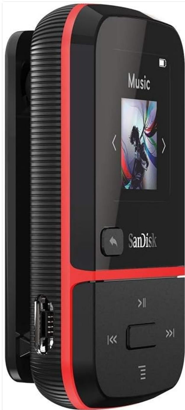
Figure 3.3: Side View with Ports

The side of the device includes the headphone jack and the micro-USB port for charging and data transfer.