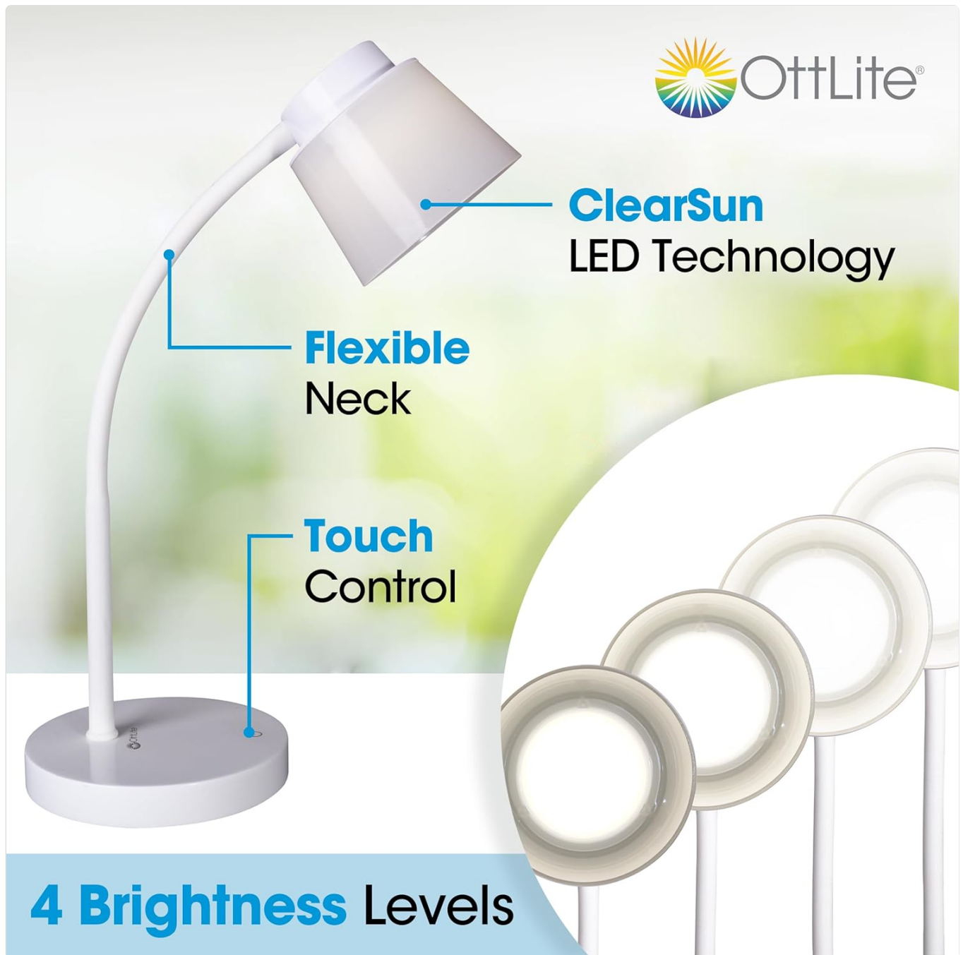
Image: Diagram highlighting the lamp's key features: ClearSun LED Technology, Flexible Neck, Touch Control, and 4 Brightness Levels.