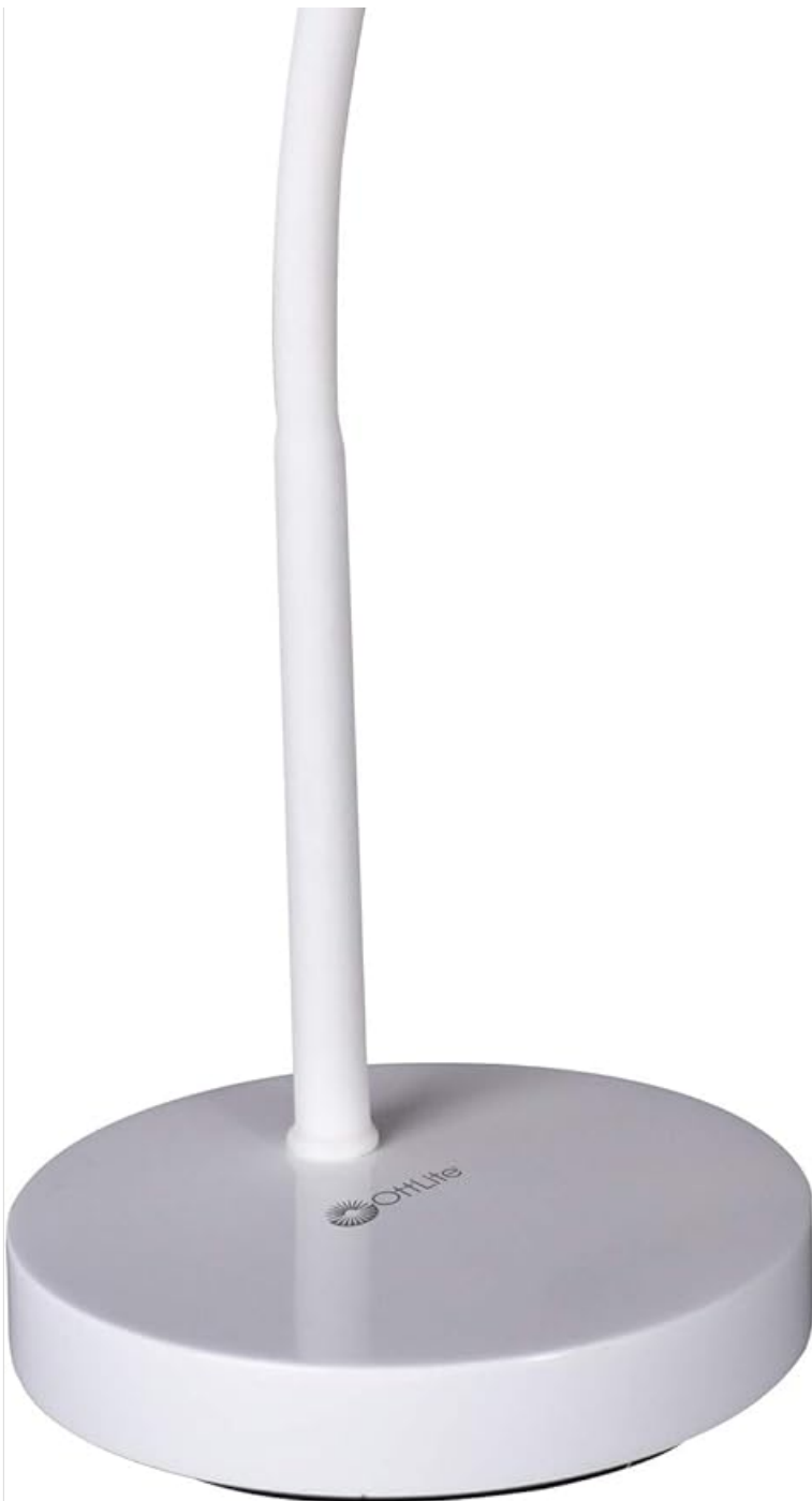
Image: The OttLite Clarify LED Desk Lamp in white, showcasing its sleek design and flexible neck.