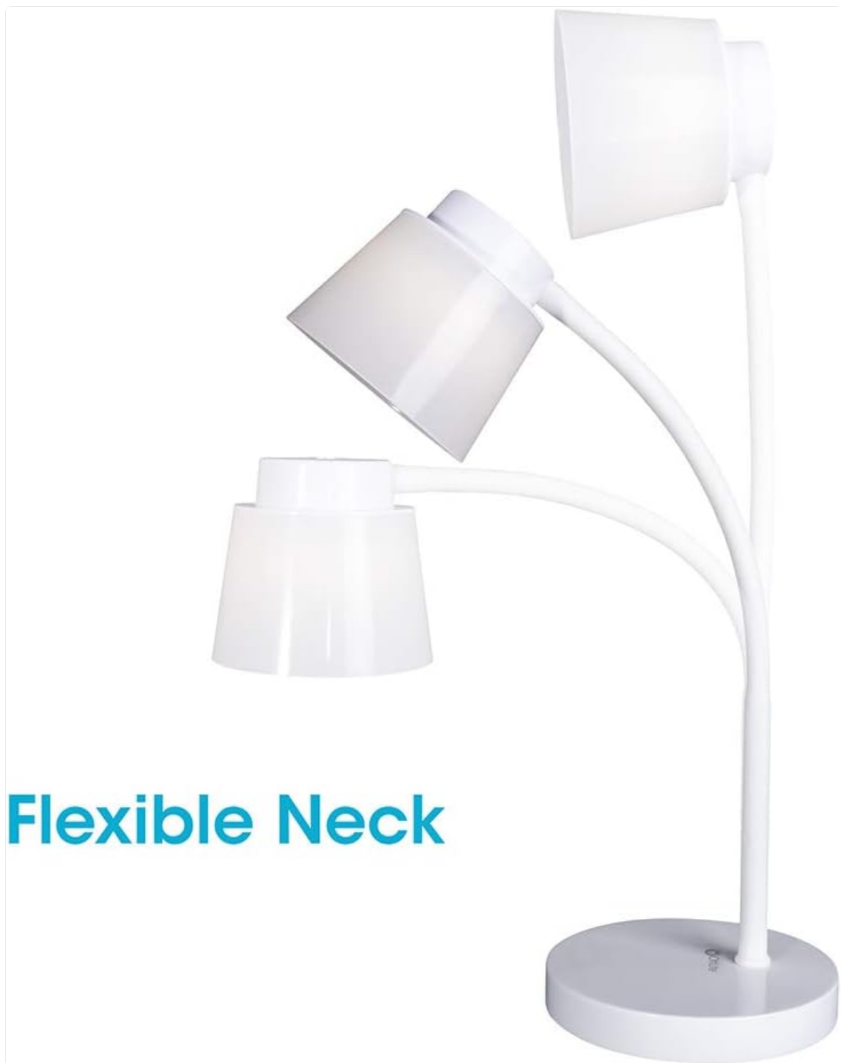
Image: The lamp's flexible neck shown in various positions, illustrating its adjustability.