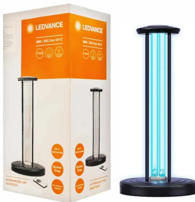
Image: The LEDVANCE Ultraviolet Air Sanitizer shown alongside its product packaging, illustrating the device's appearance and initial presentation.