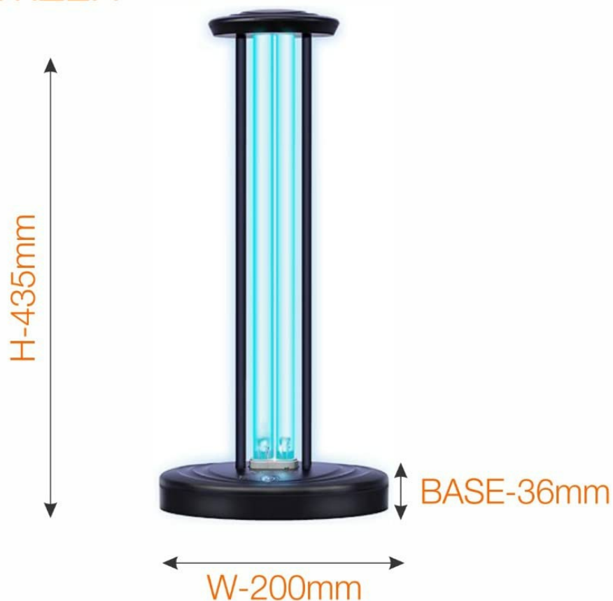
Image: The LEDVANCE Ultraviolet Air Sanitizer displaying its approximate dimensions: Height (H-435mm), Width (W-200mm), and Base (36mm).