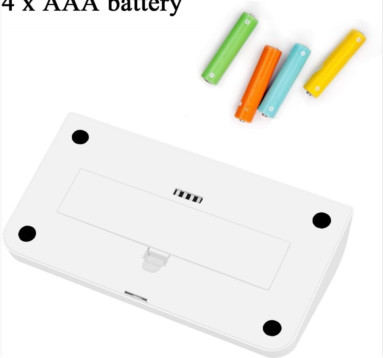
Figure 2: The battery compartment on the underside of the TD018, with AAA batteries shown for installation.