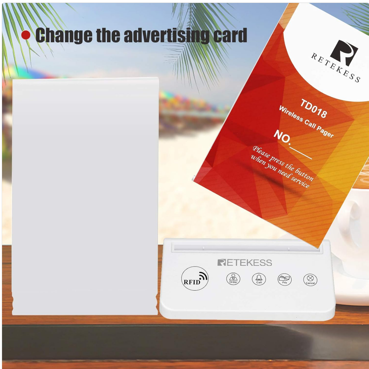
Figure 3: Illustration of how to change the advertising card in the TD018 pager.