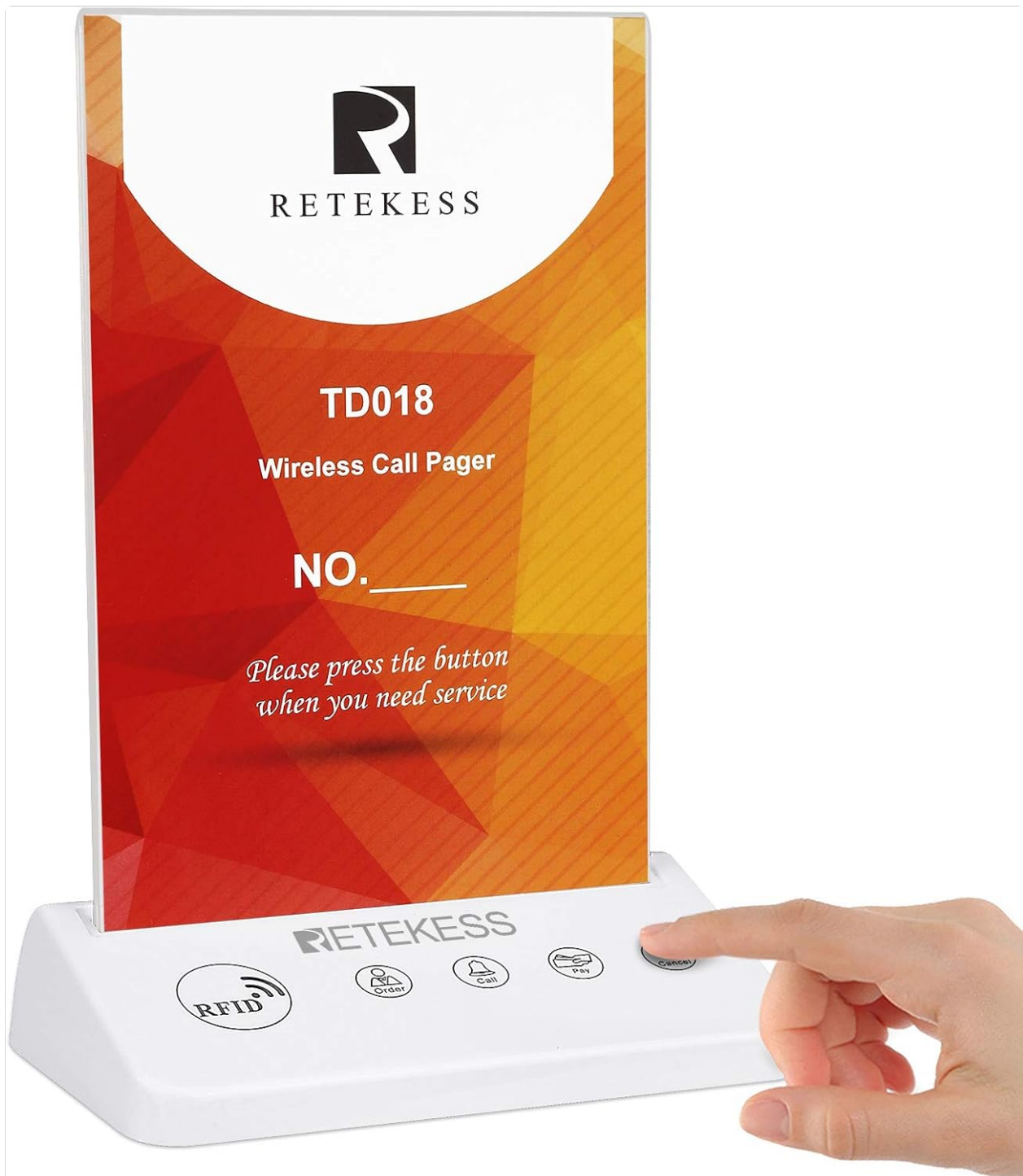
Figure 1: Reteless TD018 Call Button Pager in use, showing a hand interacting with the call button.