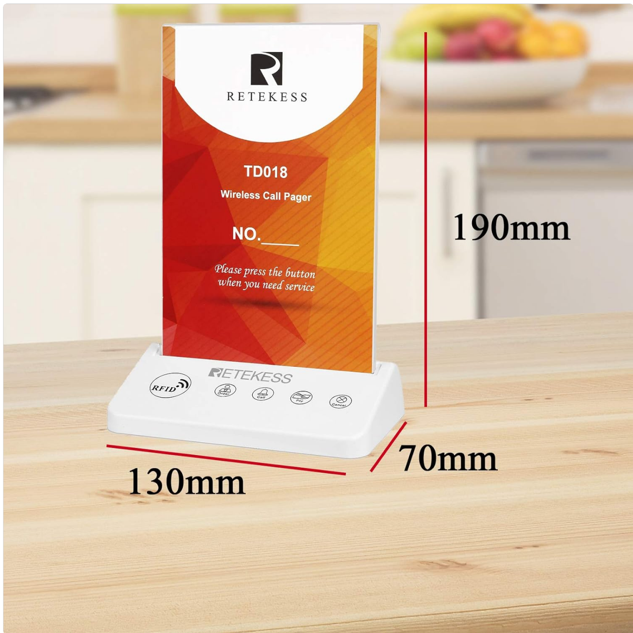
Figure 6: Physical dimensions of the Reteless TD018 Call Button Pager.