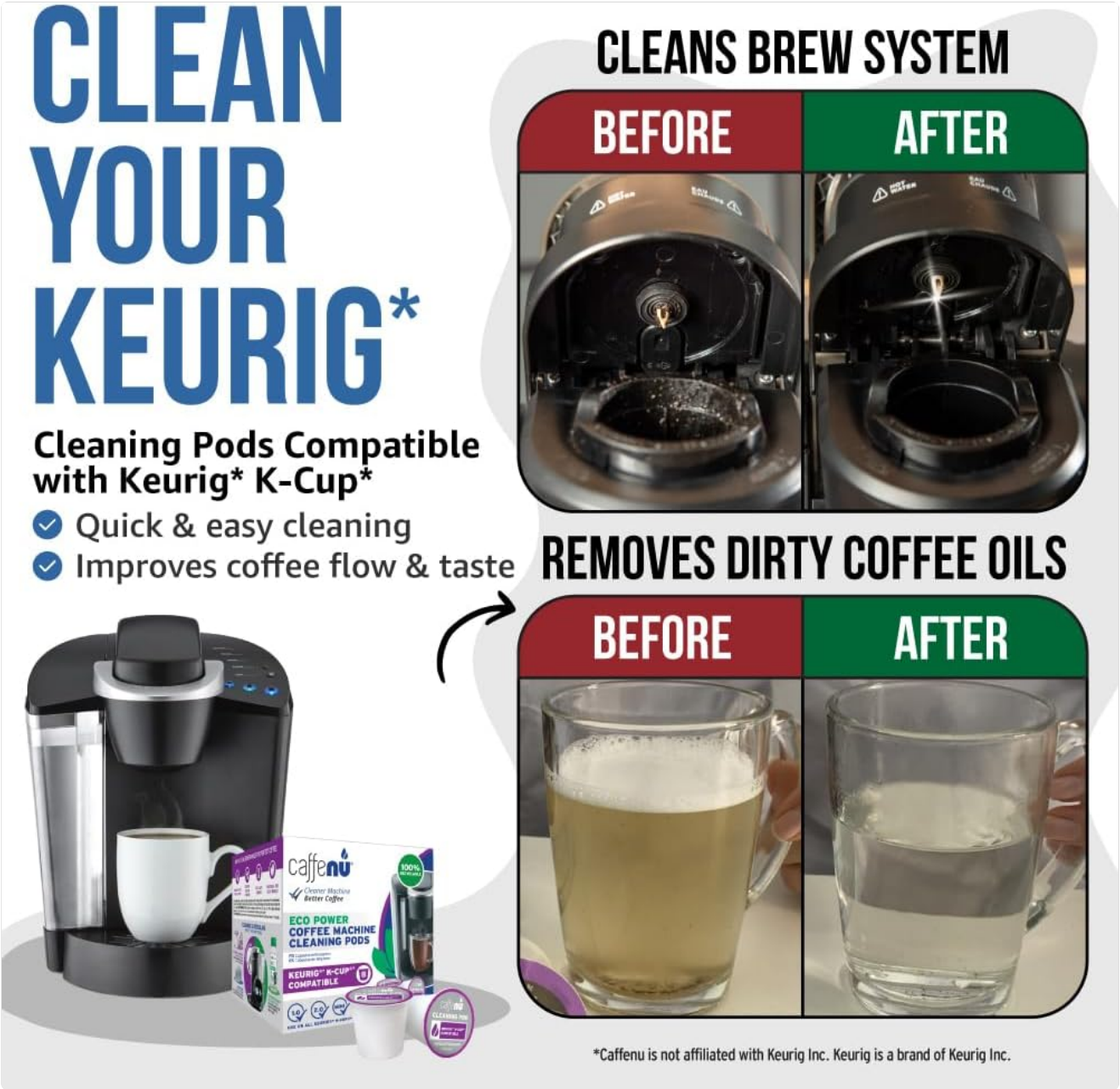
Image: Visual comparison of a coffee machine's brew system and coffee output before and after using Caffenu cleaning pods, highlighting the removal of dirty coffee oils.

It is important to understand the difference between cleaning and descaling. Cleaning pods target coffee oils and residues in the brewing chamber, while descaling addresses mineral build-up (limescale) in the machine's internal heating elements and pipes. For comprehensive machine care, both cleaning and descaling are recommended.