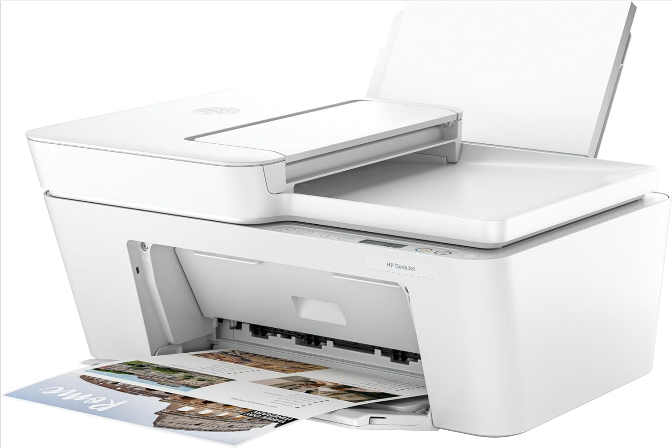
Figure 4.2: HP DeskJet 2722 printer with paper loaded in the input tray and a printed document exiting.