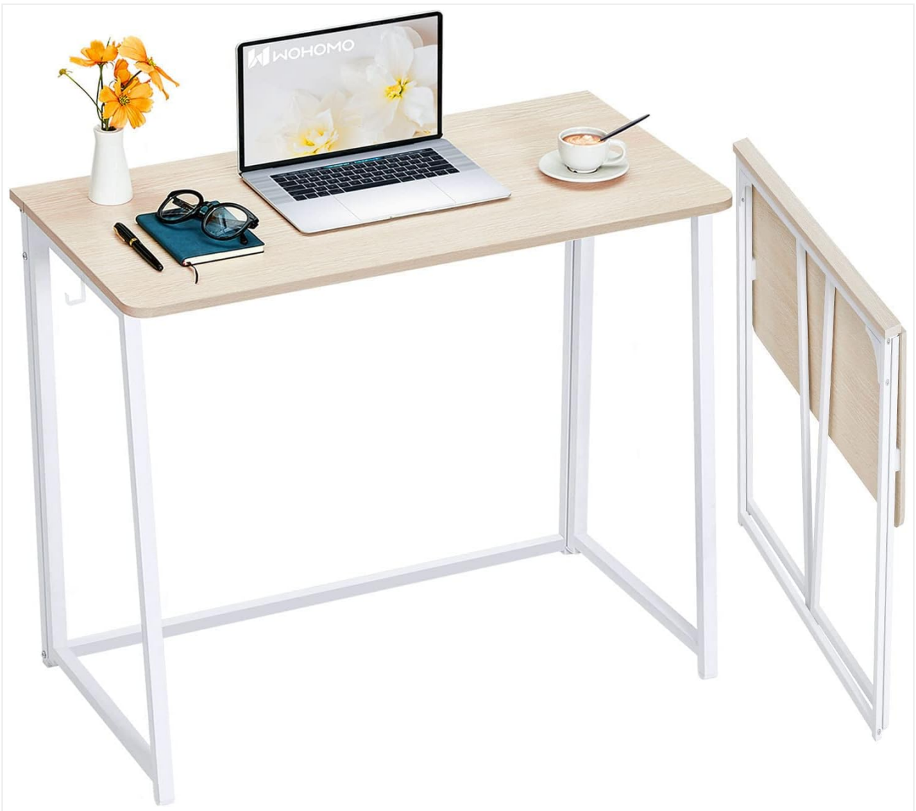
Figure 1.1: WOHOMO Folding Desk in use.