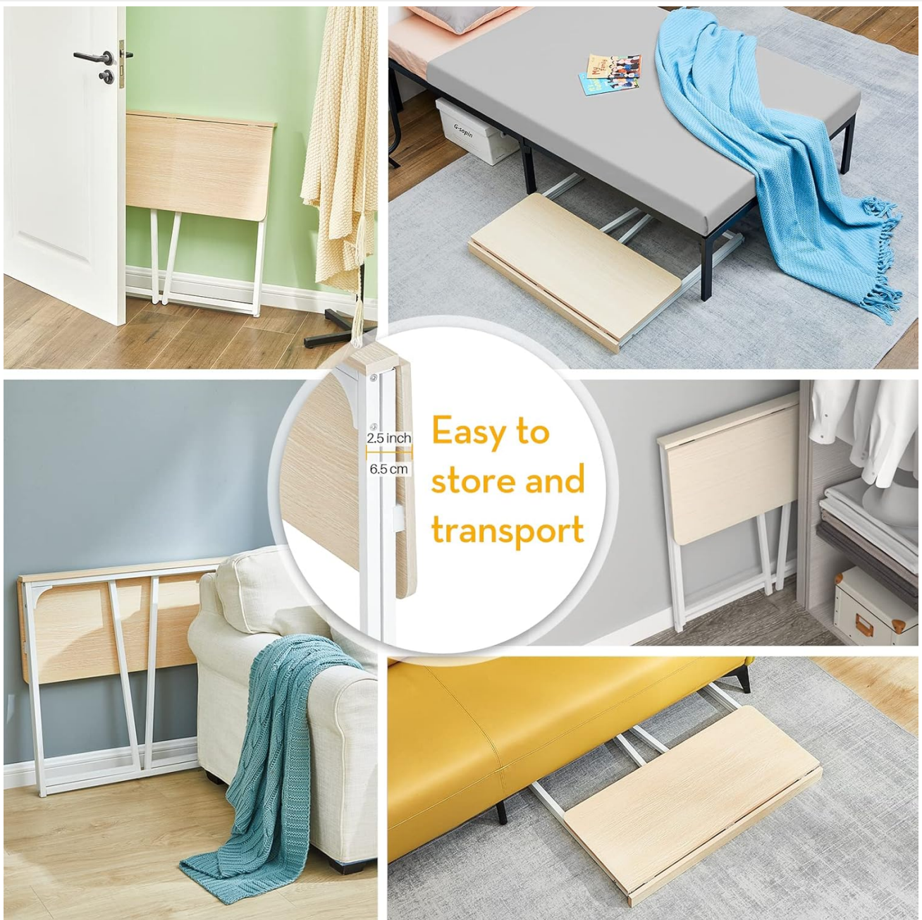
Figure 5.1: Examples of compact storage for the WOHOME Folding Desk.