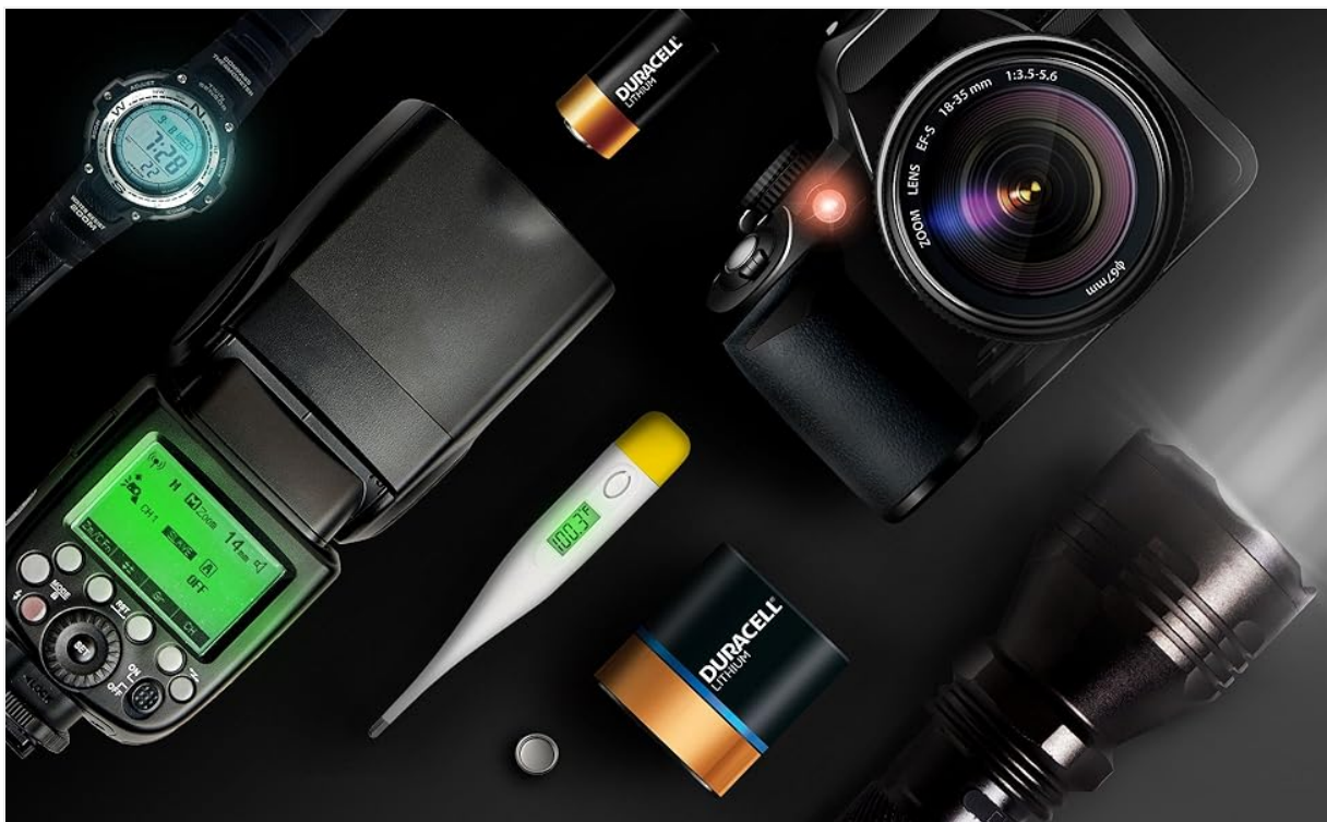
Image: An assortment of devices including a watch, camera, thermometer, and flashlight, illustrating the versatility of Duracell specialty batteries.

Duracell CR123A batteries are designed for optimal performance in high-powered devices. These include, but are not limited to, wireless security systems, home automation devices, high-intensity flashlights, and smoke detectors. Always refer to your device's user manual for specific battery requirements and operating procedures.