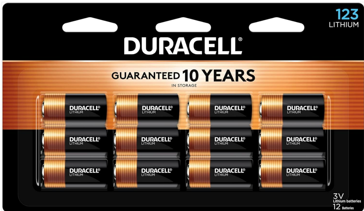
Image: A pack of Duracell CR123A 3V Lithium Batteries, highlighting the product packaging.

The Duracell High Power Lithium CR123A 3 Volt batteries are engineered to deliver reliable power for a variety of specialty devices. These include home safety and security systems, high-intensity flashlights, smoke alarms, and home automation equipment. These CR123 batteries are guaranteed for 10 years in storage, ensuring they are ready for use when needed.