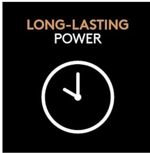
Image: An icon depicting a clock, symbolizing the long-lasting power and storage life of the batteries.