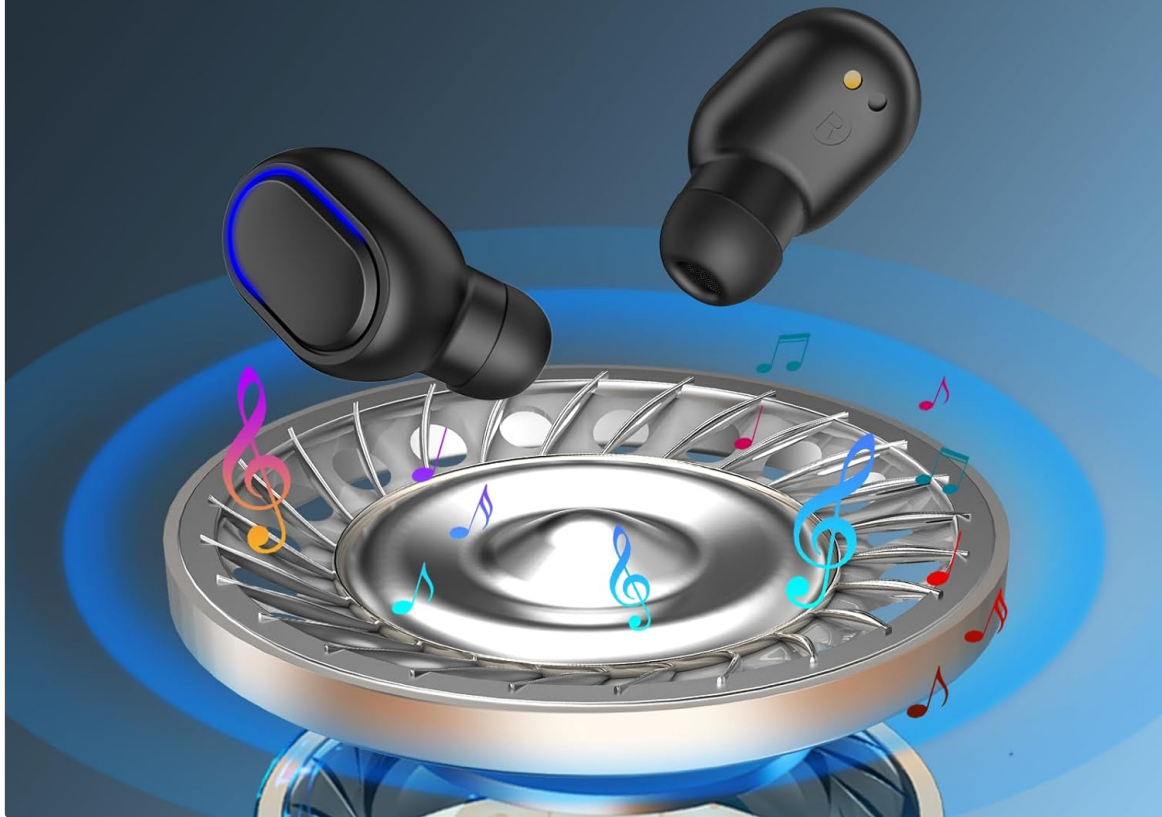
Image: This graphic visually represents the clear stereo sound quality, showing the headphones alongside musical notes and sound waves emanating from an 8mm driver, indicating high-fidelity audio for both music and calls.