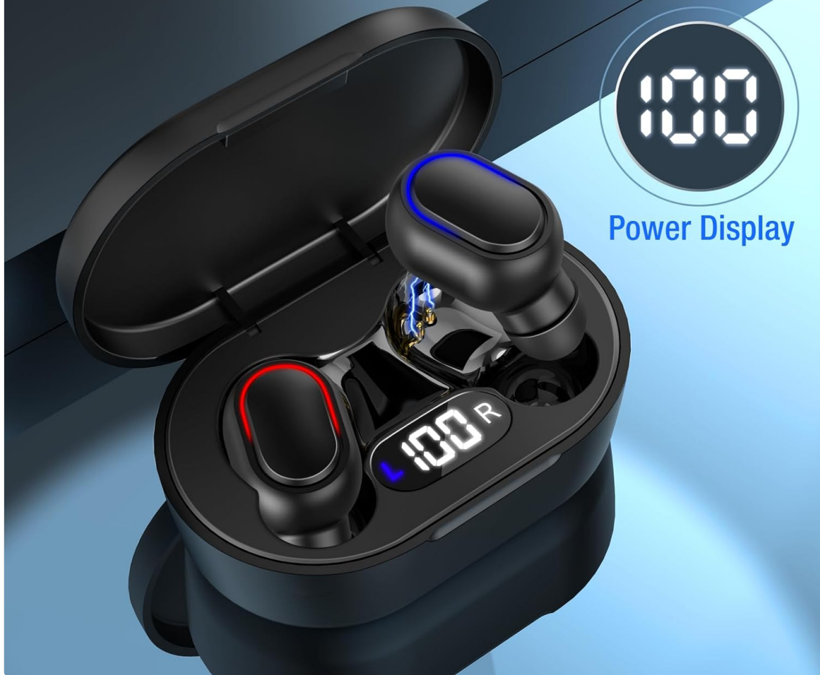
Image: The charging case features an LED digital display that clearly indicates the remaining battery power, ensuring you always know when to recharge.

Easily know the remaining battery power.