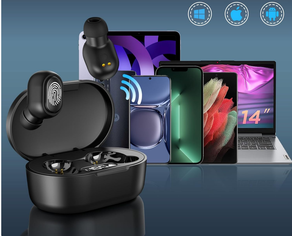
Image: This image illustrates the wide compatibility of the headphones, showcasing them alongside a variety of devices such as laptops, tablets, and smartphones, indicating seamless connectivity across different platforms.