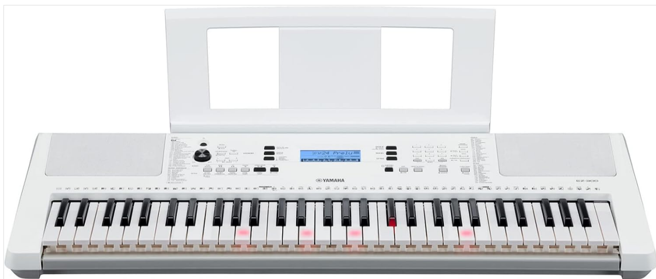
Image: A detailed view of the Yamaha EZ300's control panel, showing the various buttons for voice, style, song selection, and the LCD screen.