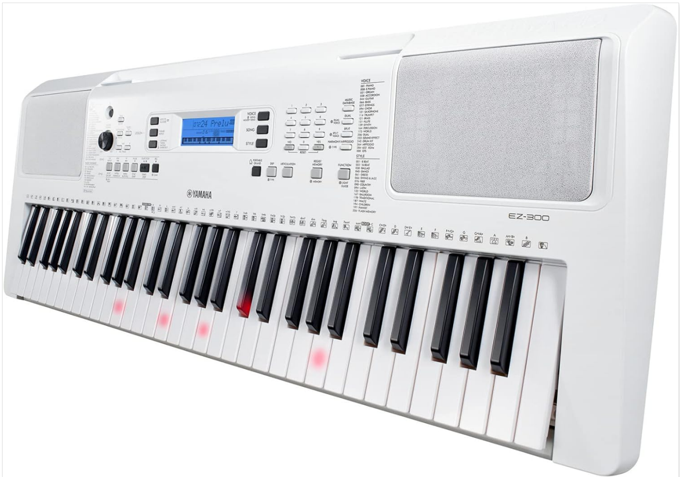
Image: The Yamaha EZ300 keyboard with several white keys glowing red, demonstrating the lighted key feature for learning.