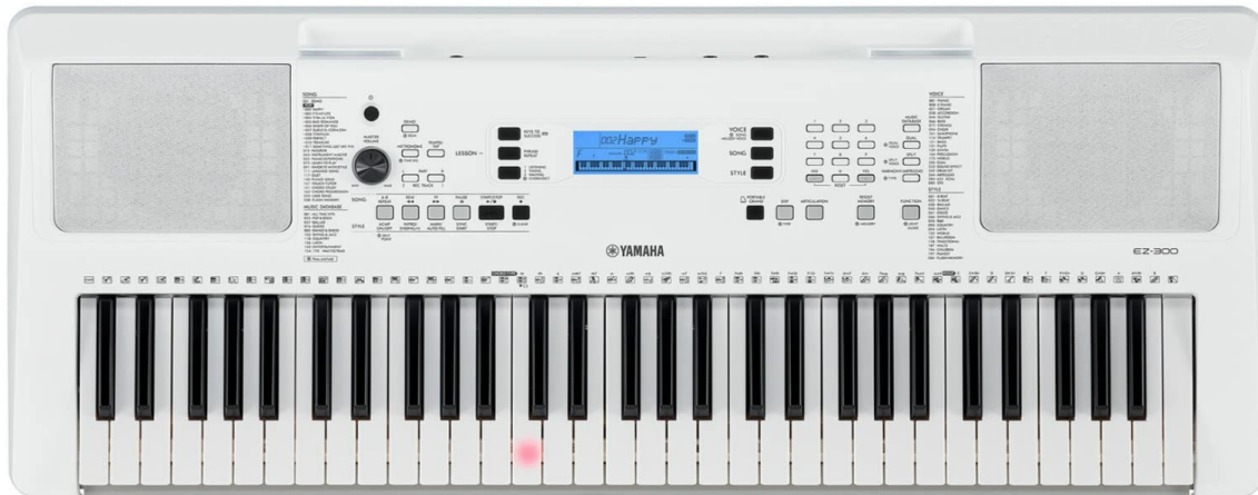
Image: Top-down view of the Yamaha EZ300 61-Key Portable Keyboard, showcasing its white keys, black keys, control panel, and built-in speakers.