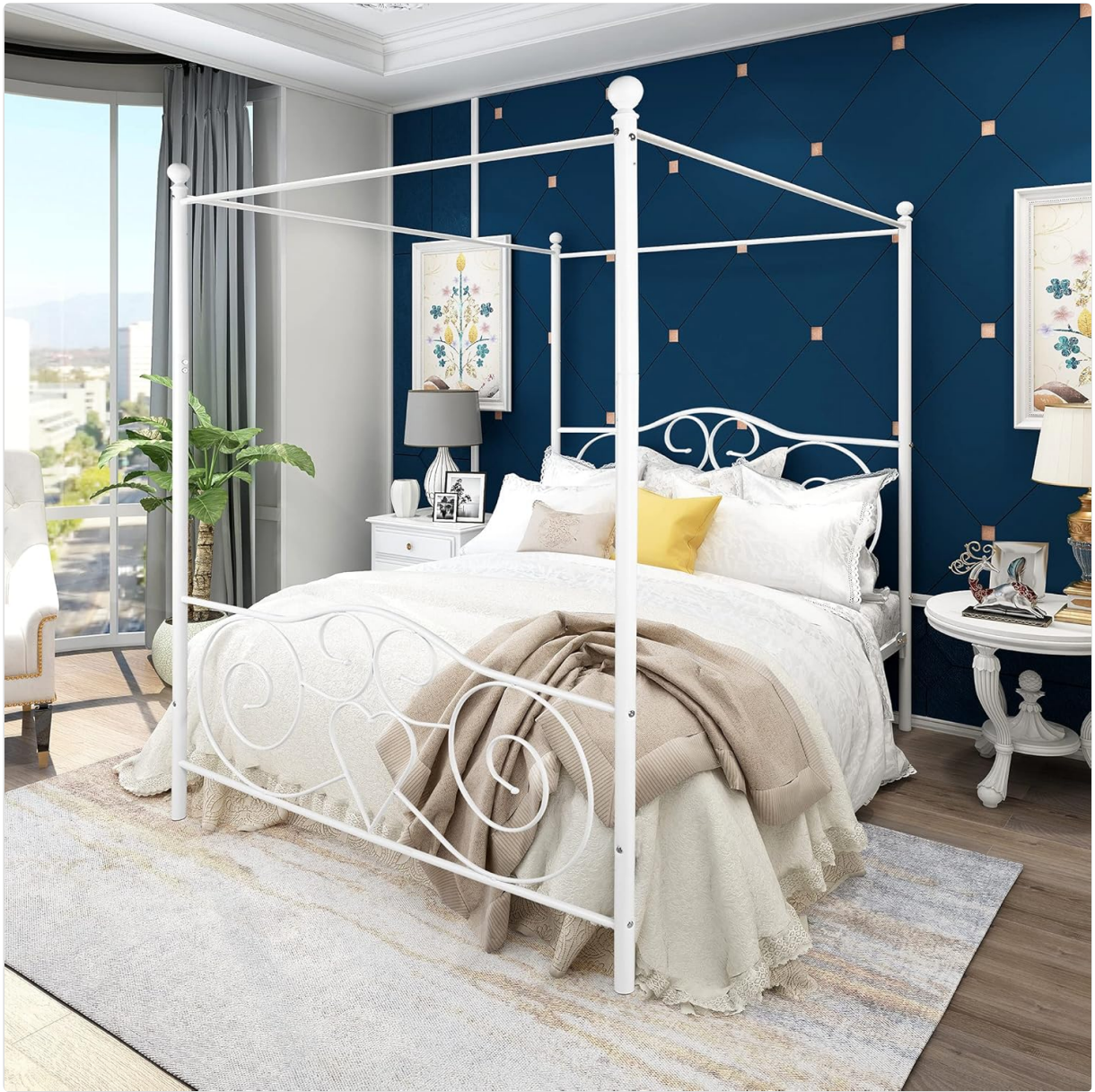
Figure 1.1: The Albearing Canopy Full Bed Frame, showcasing its elegant design and white finish.