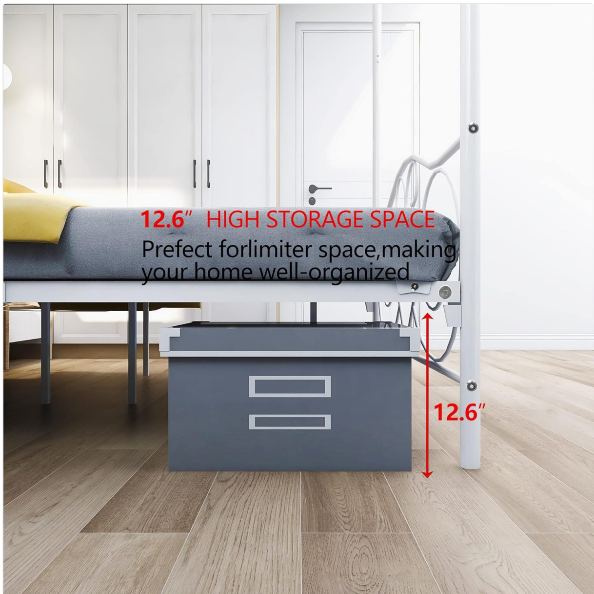
Figure 1.2: Illustration of the 12.6-inch high storage space available under the bed frame.