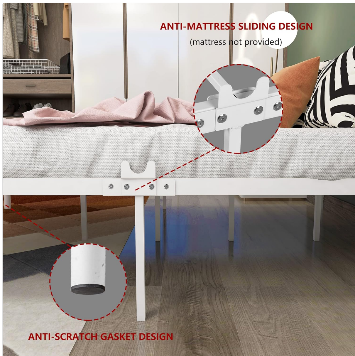
Figure 4.2: Detail of the anti-mattress sliding design on the frame and the anti-scratch gasket on the legs.