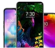
LG G7 G8/G8X