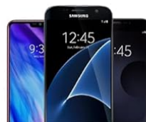
Other Qi phones