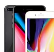
iPhone 8/ 8 Plus