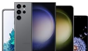
Samsung S24-S8 Series