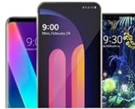
LG V60 V50 V40+/V30+