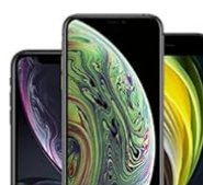
iPhone SE XR/XS