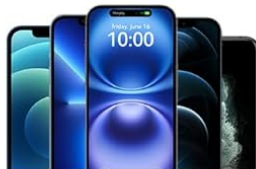
iPhone 16-11 Series