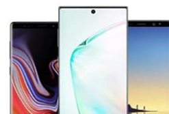
Samsung Note 10 Note 9/Note 8