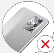
Grips + Stands