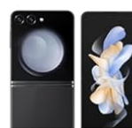
Samsung Z Flip 5/4