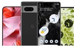
Pixel 9 - 3XL Series