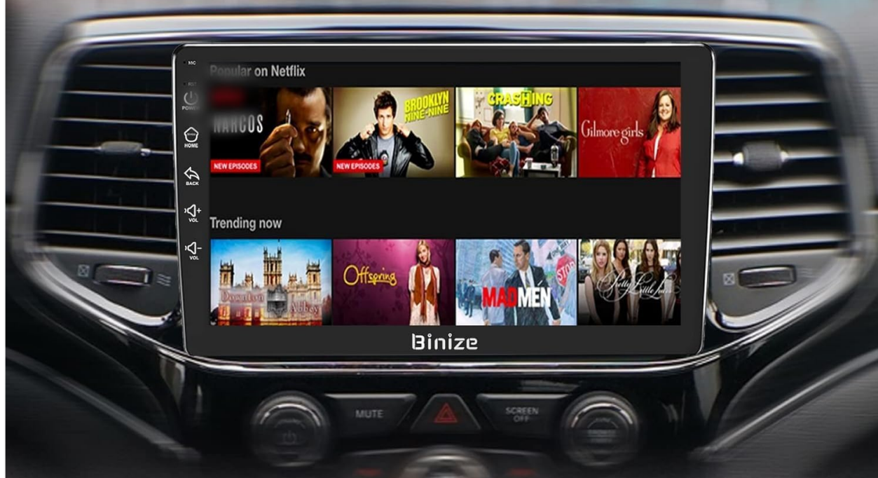
Image Description: The BINIZE car stereo screen displaying various popular applications such as YouTube and Netflix, highlighting its capability to support a wide range of Android apps.