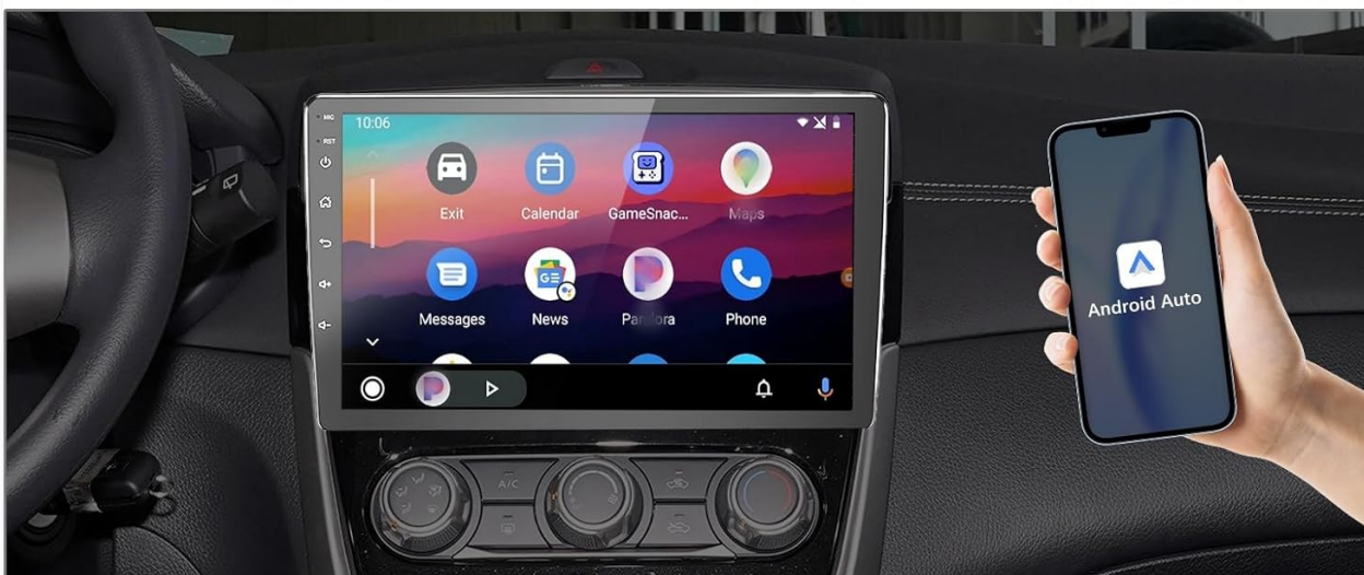
Image Description: The BINIZE car stereo displaying both Wireless CarPlay and Android Auto interfaces. Two smartphones are shown alongside, illustrating the seamless connection and mirroring of phone functionalities onto the larger car display. See how to use Wireless CarPlay and Android Auto:

Your browser does not support the video tag.