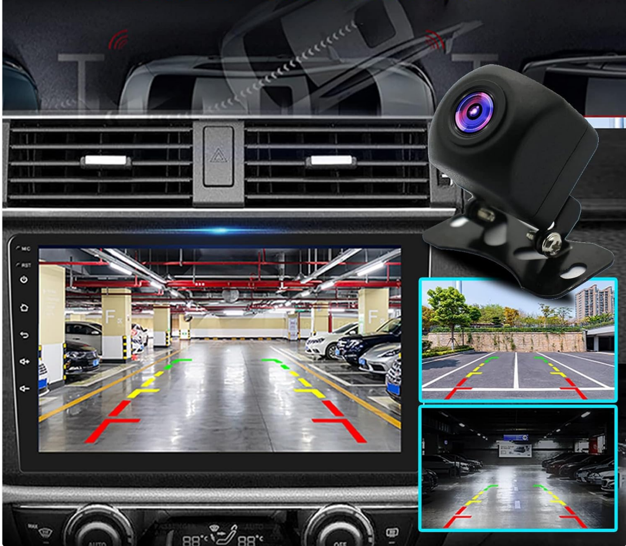
Image Description: The BINIZE car stereo screen displaying the view from a backup camera, complete with dynamic parking guidelines. An inset image shows the physical backup camera unit.