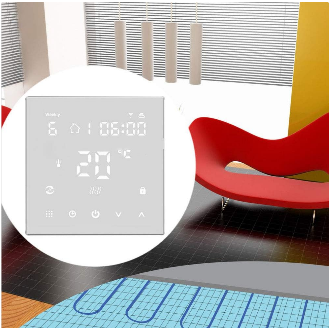
Figure 3: Example installation of the Decdeed HY607 Smart Thermostat in a room with floor heating.