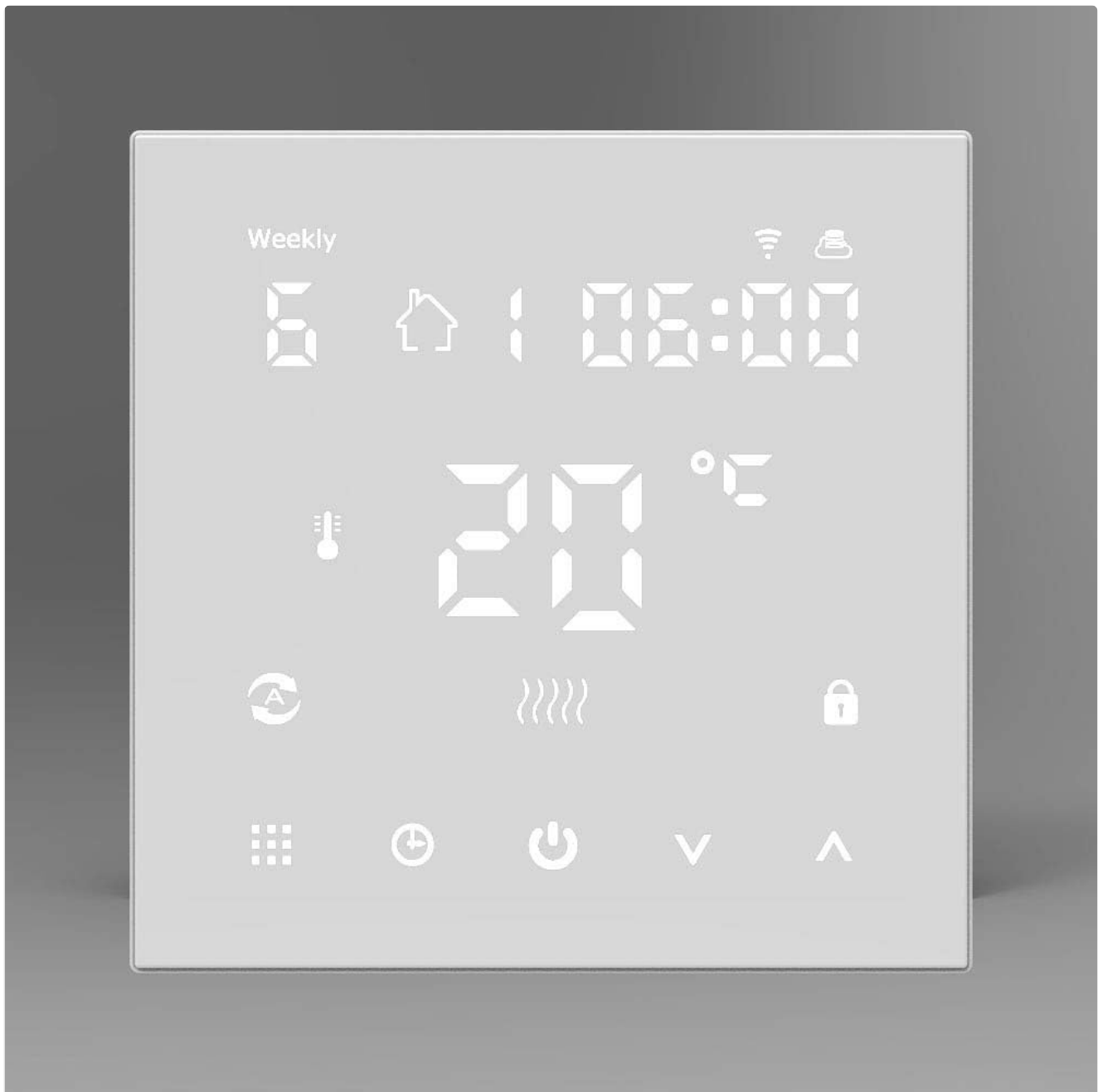
Figure 1: Front view of the Decdeal HY607 Smart Thermostat display.

The Decdeal HY607 thermostat features a clear LCD digital display and intuitive touch controls for easy operation.