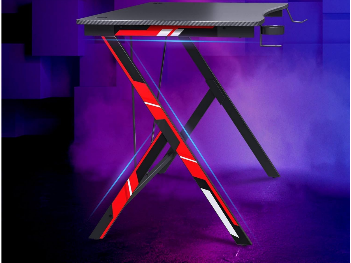
Image: Detailed view of the cup holder, headphone hook, cable management holes, and adjustable feet, highlighting their placement and function.