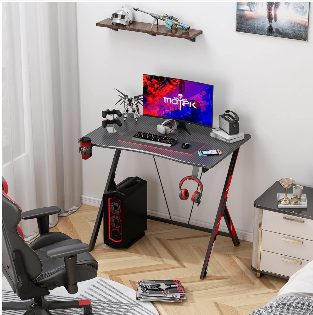
Image: The assembled desk, showcasing the carbon fiber desktop securely fastened to the Y-shaped metal frame.