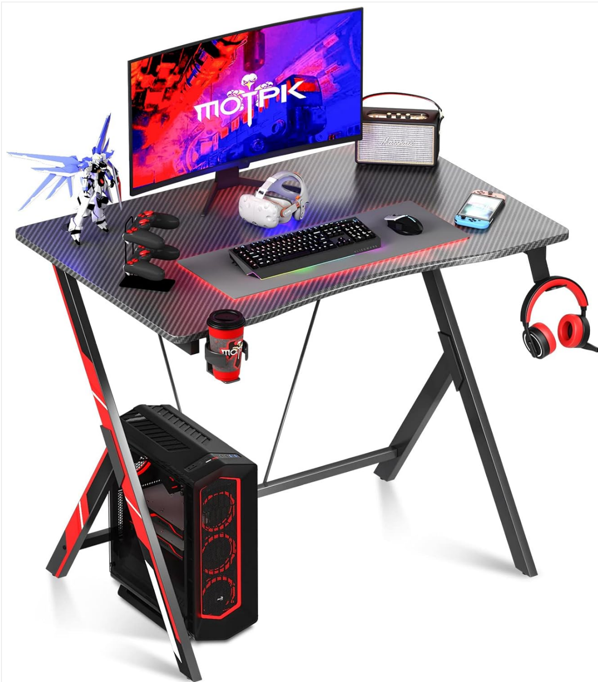
Image: The fully assembled MOTPK Gaming Desk, featuring the optional red and black leg stickers, ready for use.