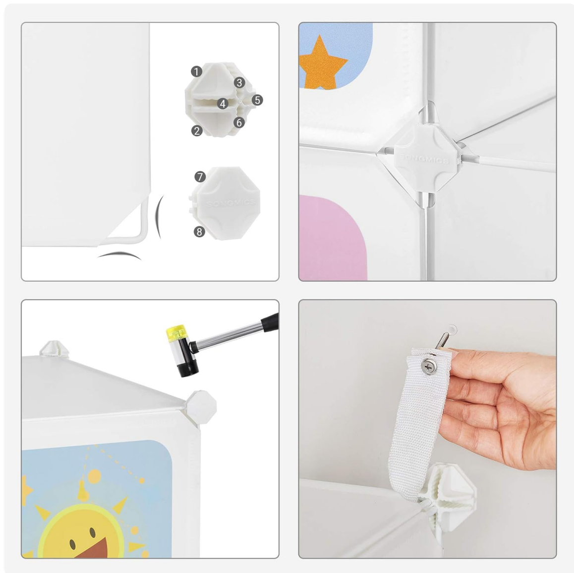
Image 4.1: Details on connector usage, mallet application, and anti-tip kit installation.