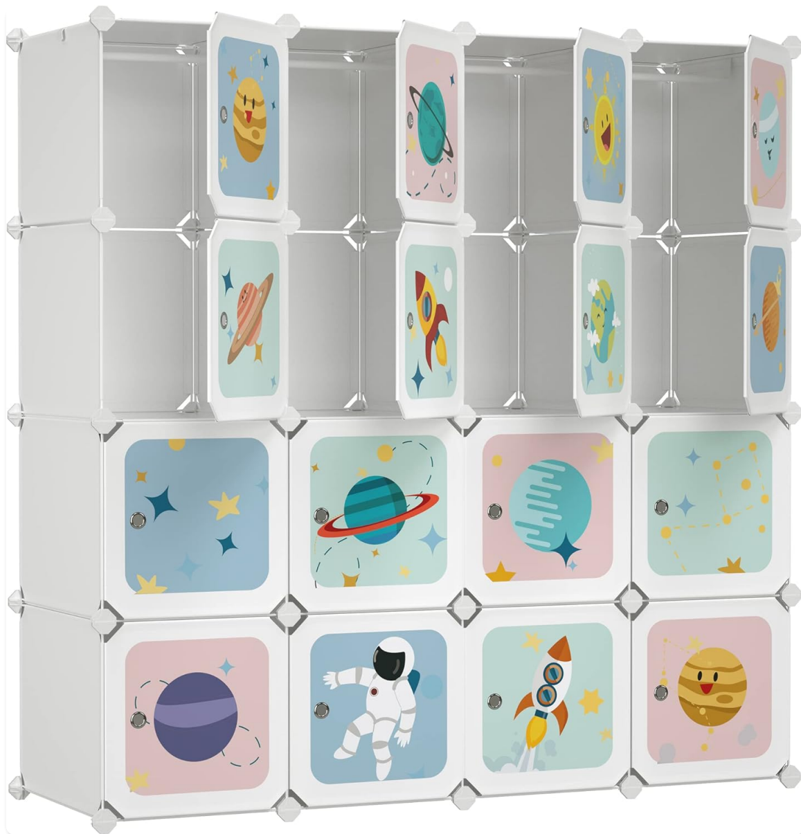
Image 1.1: Fully assembled SONGMICS DIY Kids Wardrobe with space-themed doors.