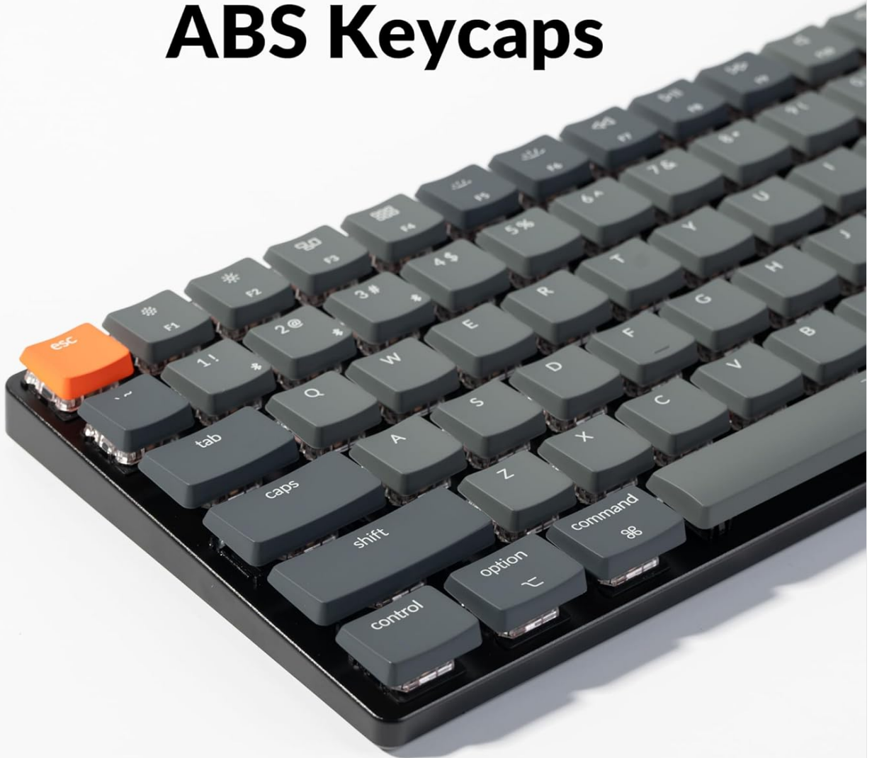
Image: Low-profile ABS keycaps on the Keychron K3.