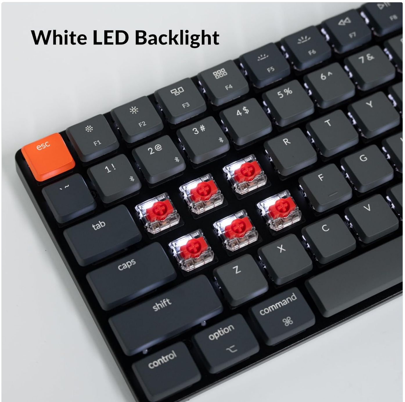
Image: White LED backlighting illuminates the keys and low-profile red mechanical switches.