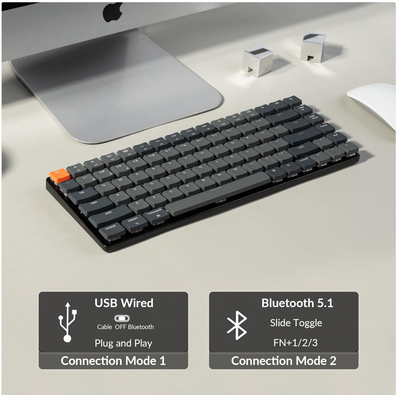
Image: Visual guide for connecting the Keychron K3 via USB or Bluetooth.