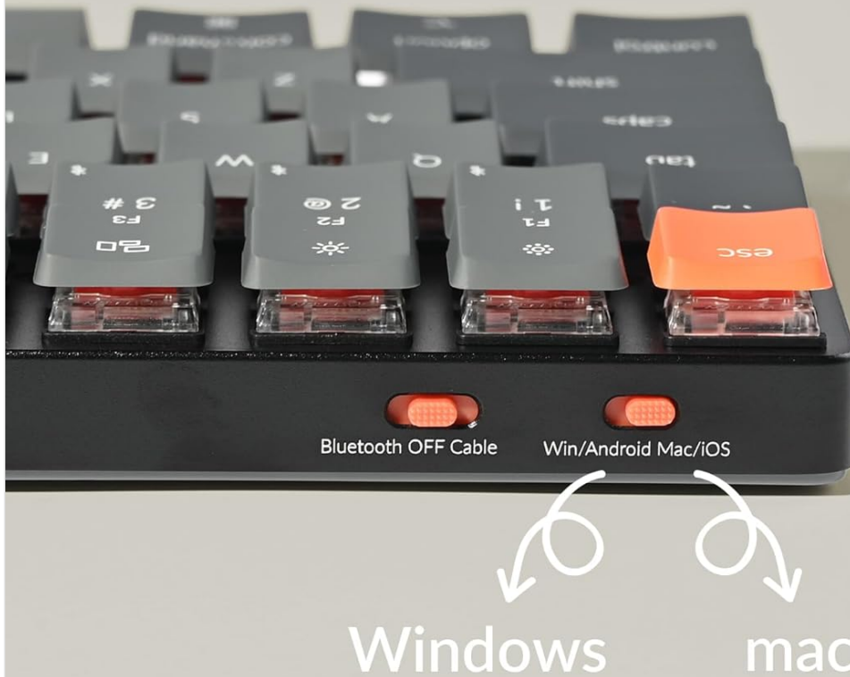
Image: Side switches for selecting operating system layout and connection type.

Use the dedicated switch on the side of the keyboard to select between Win/Android and Mac/iOS layouts. Ensure the correct layout is selected for optimal functionality.