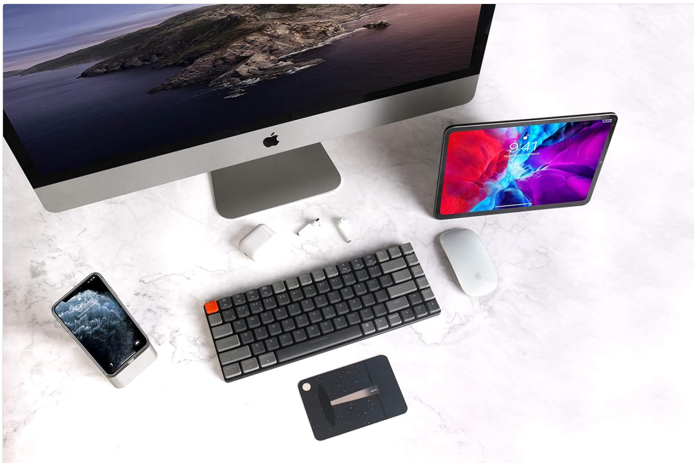
Image: Keychron K3 keyboard integrated into a multi-device workspace.