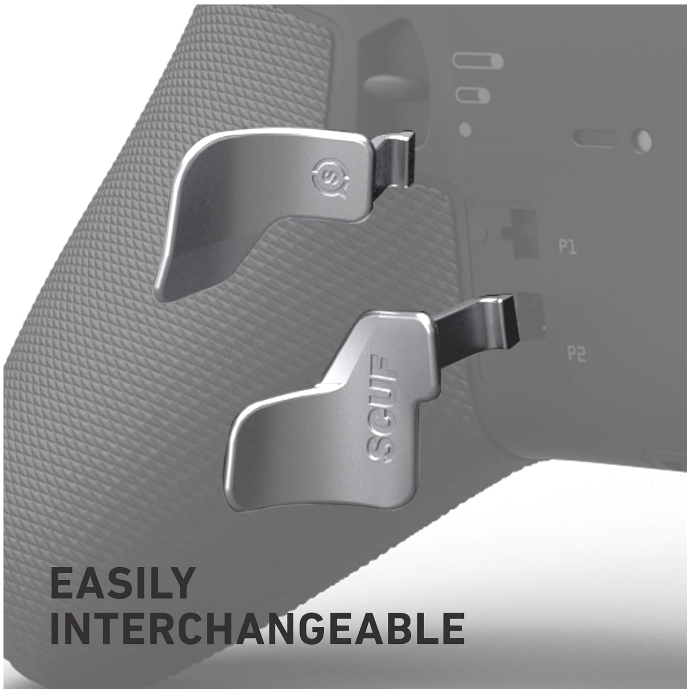
Figure 4: The magnetic design allows for easy interchangeability of the paddles.