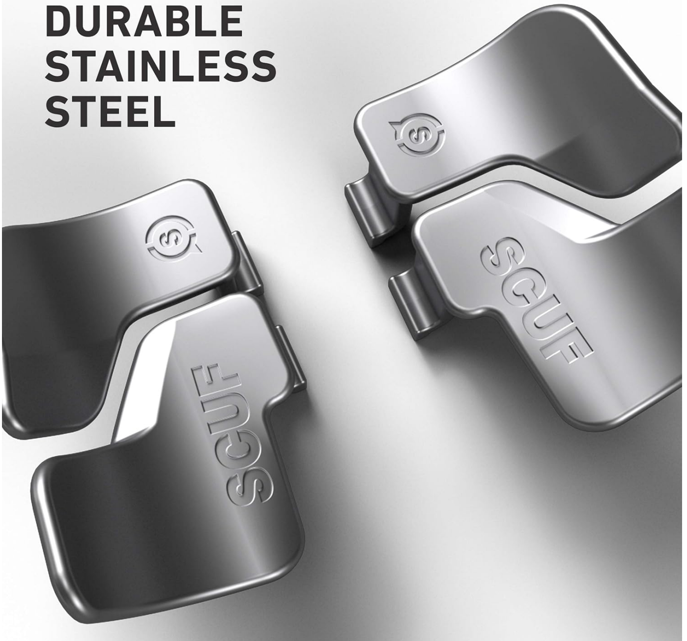
Figure 2: The paddles are constructed from durable stainless steel, ensuring long-lasting performance.