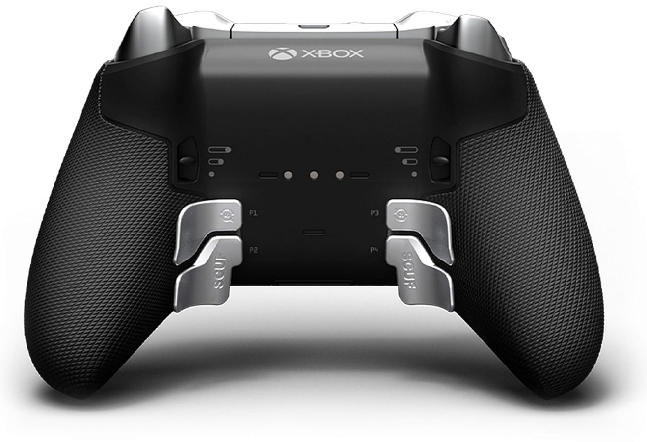
Figure 3: The intuitive placement of the paddles on the back of the Xbox Elite Series 2 controller.