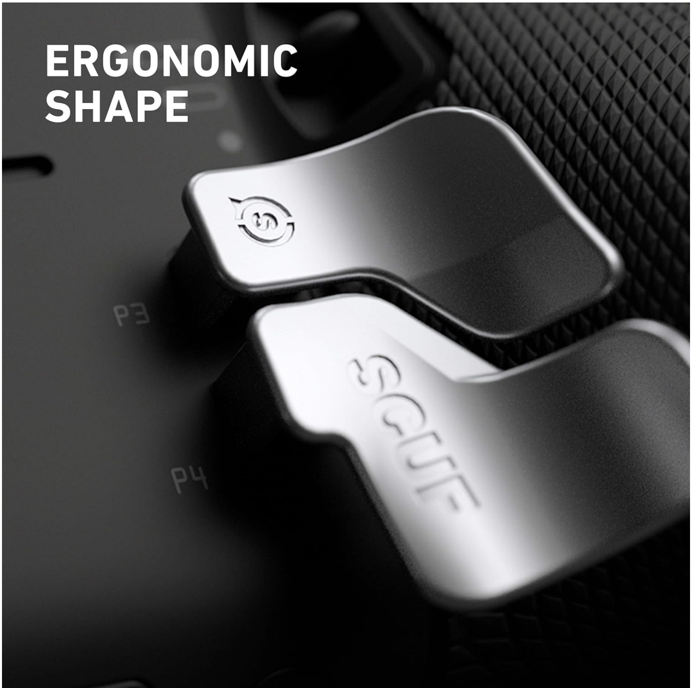
Figure 1: The ergonomic shape of the SCUF Elite Series 2 Paddles, designed for comfortable and efficient use.