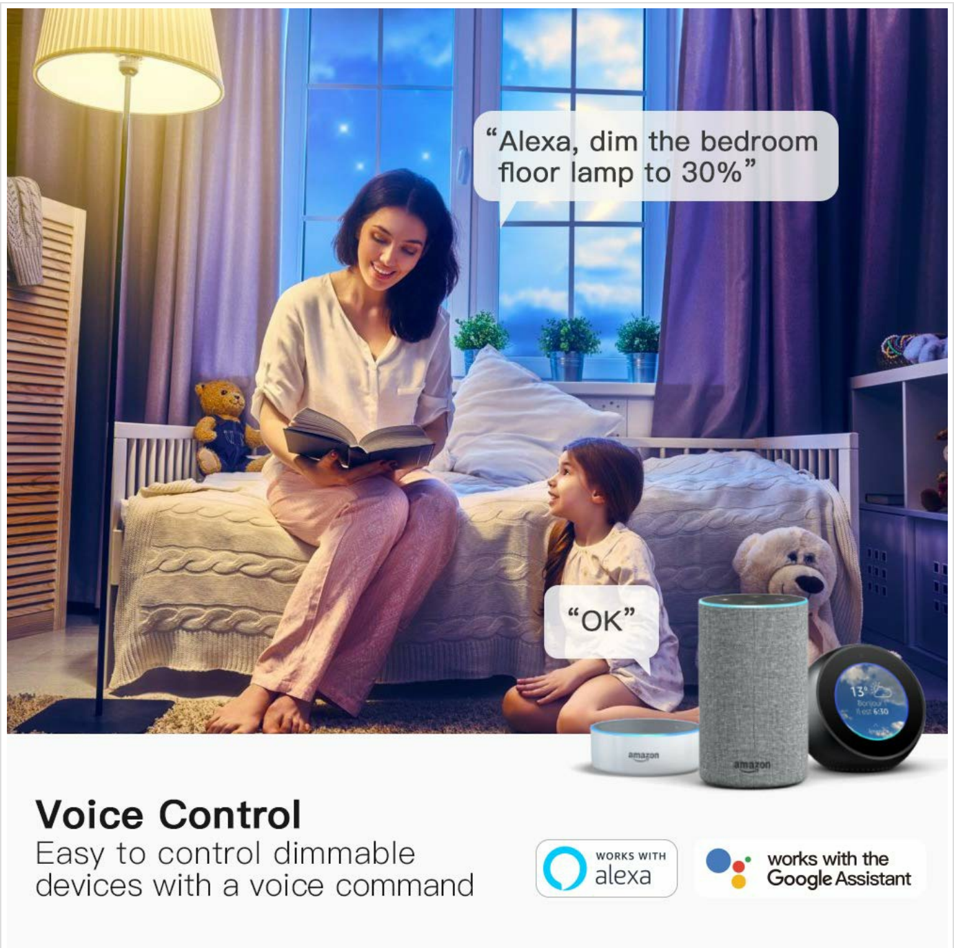
Image: A woman and child in a bedroom, with an Amazon Echo device, demonstrating voice control functionality. A speech bubble shows "Alexa, dim the bedroom floor lamp to 30%."