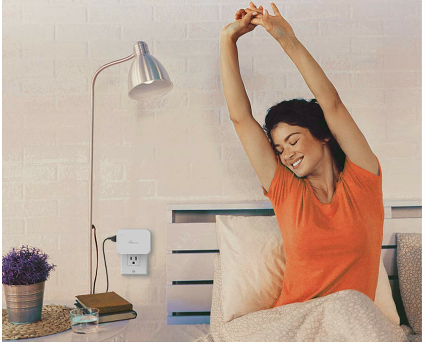
Image: A woman stretching in bed, illuminated by a lamp connected to a TREATLIFE smart plug, illustrating the sunrise simulation feature for a gentle wake-up.

Wake you up with nature brightness and aid you sleep with ideal brightness