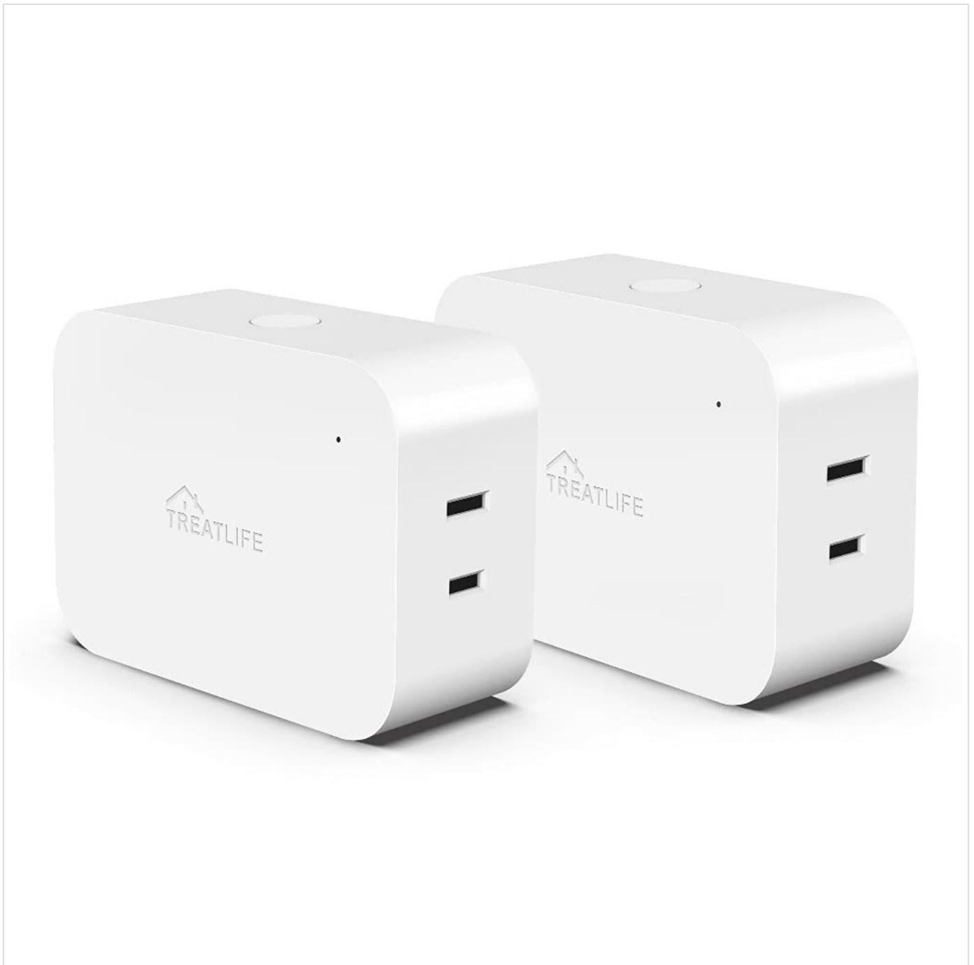
Image: Two white TREATLIFE DP20 Dimmable Smart Plugs, shown from an angled front view, highlighting their compact design and dual outlets.