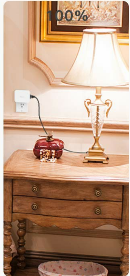
Image: A visual representation showing three different light intensities (10%, 50%, 100%) in a bedroom setting, illustrating the full dimmability range of the smart plug.