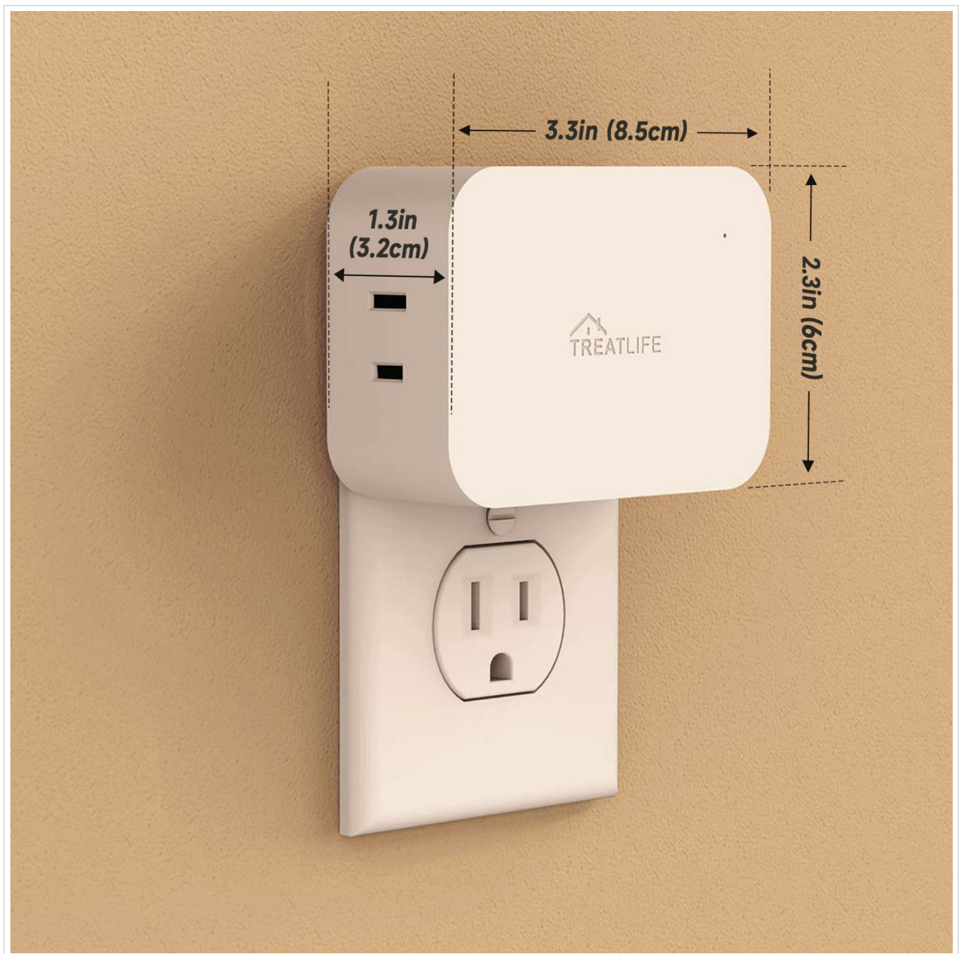
Image: A TREATLIFE DP20 Dimmable Smart Plug plugged into a wall outlet, with measurements indicating its compact size: 3.3 inches (8.5cm) width, 2.3 inches (6cm) height, and 1.3 inches (3.2cm) depth from the wall.