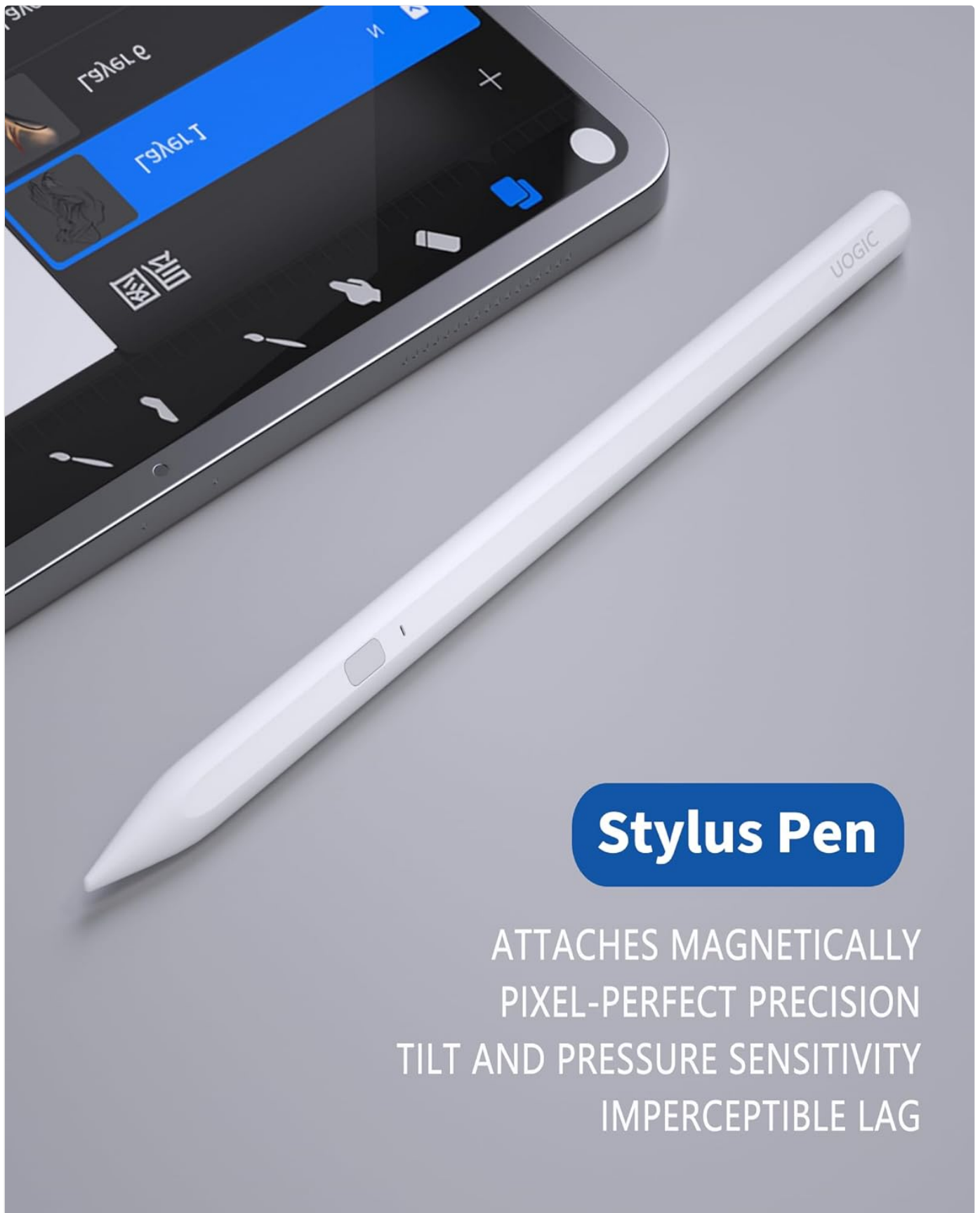
Figure 2: The stylus magnetically attaching to the side of an iPad for convenient storage.