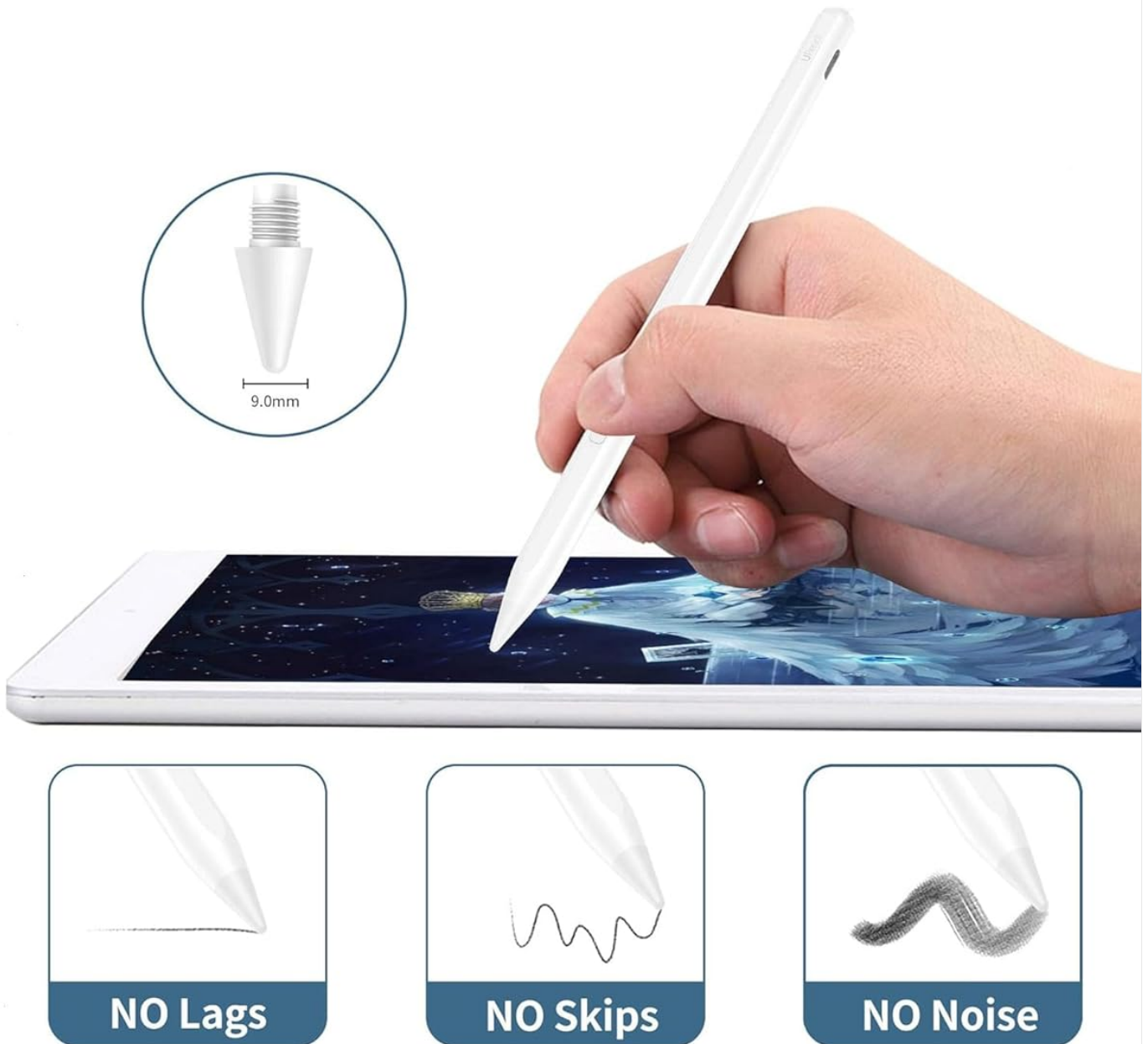
Figure 5: The stylus with its replaceable POM fine tip, emphasizing its key performance features.