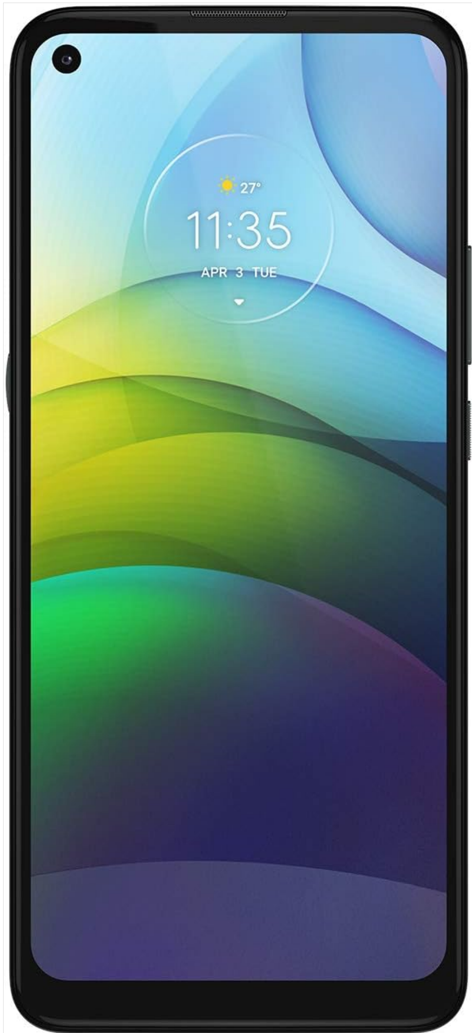
Figure 3.2: Front Display of the Moto G9 Power. This image focuses on the 6.8-inch Max Vision display, showcasing the punch-hole front