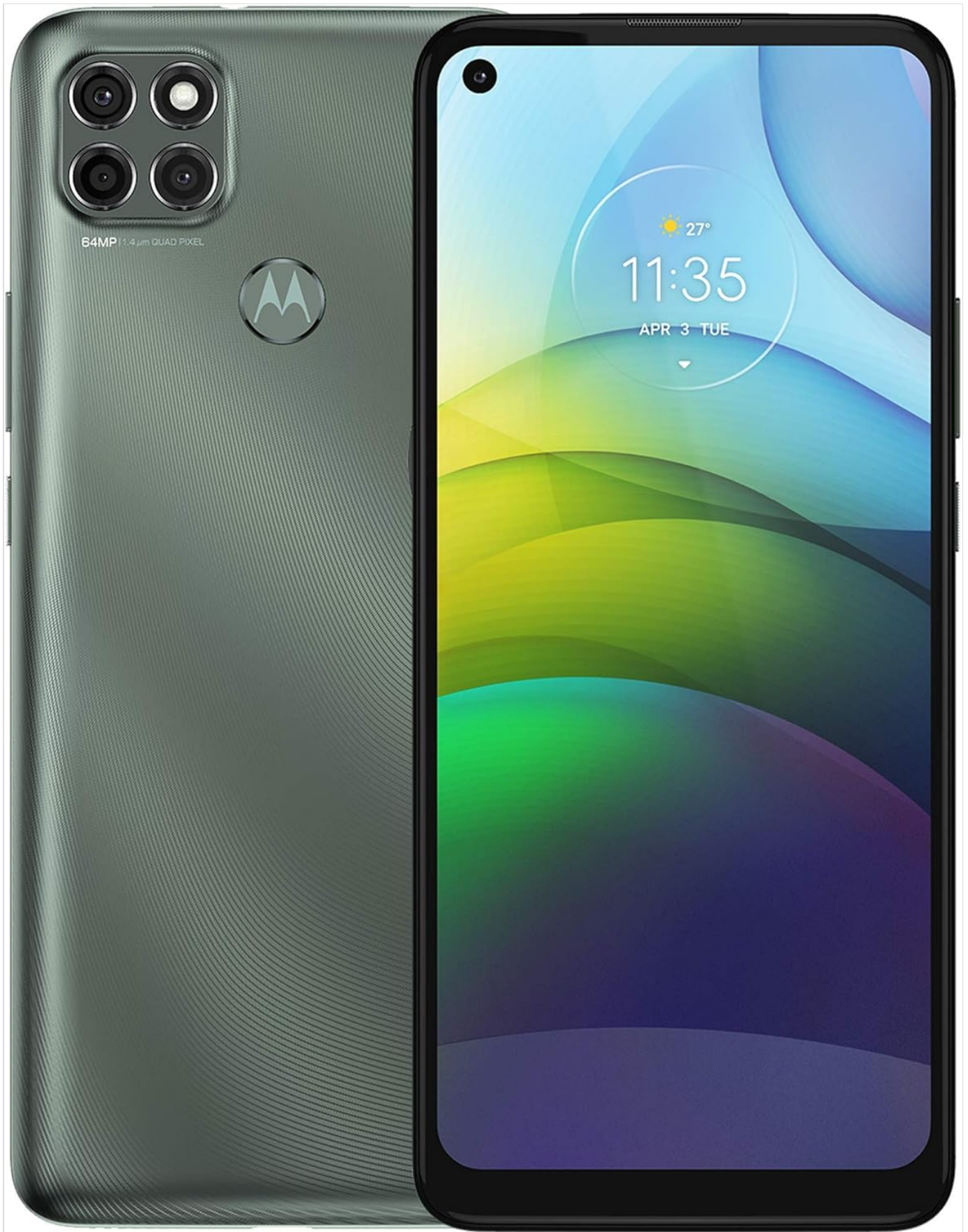
Figure 3.1: Front and Back View of the Moto G9 Power. This image displays the smartphone from both the front, showing the display and front camera, and the back, highlighting the triple camera module and fingerprint sensor.