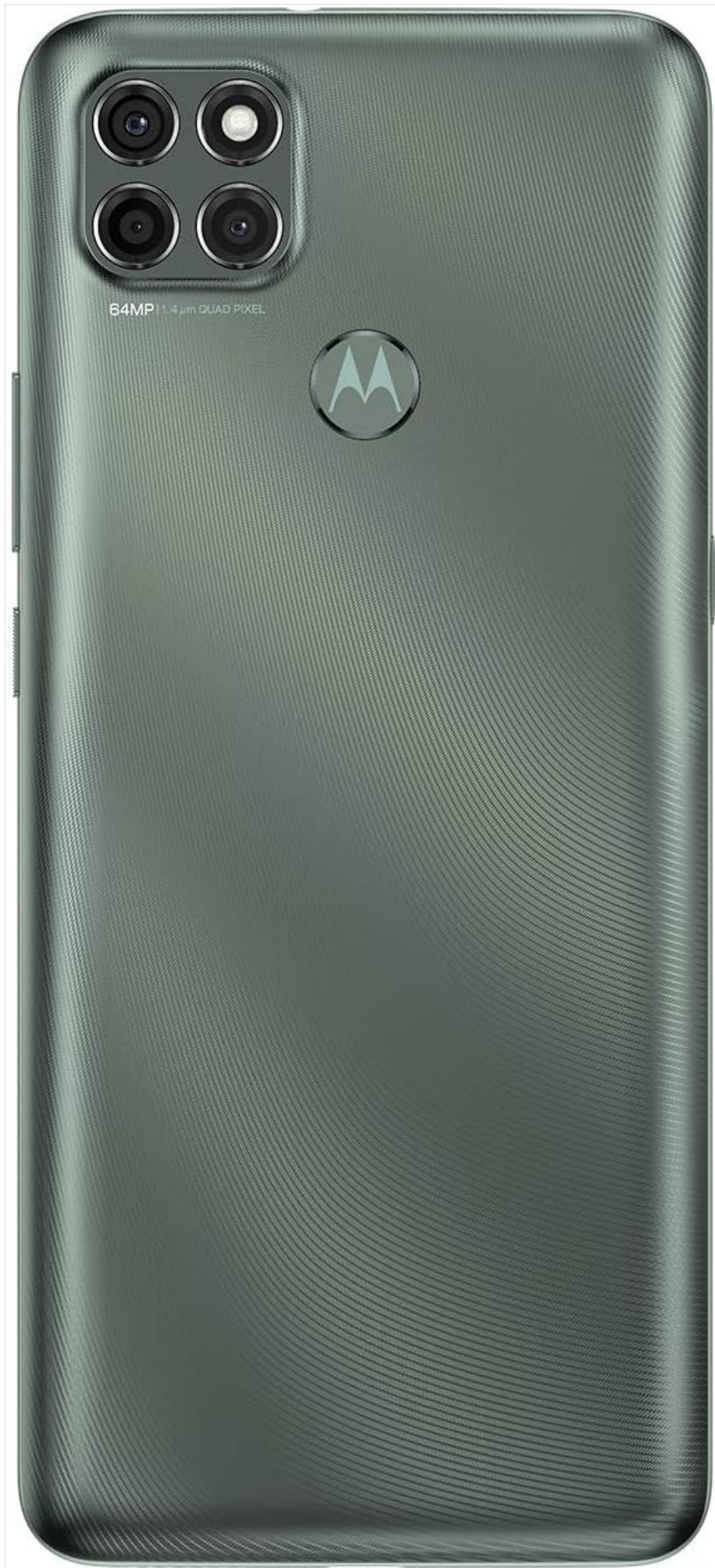
Figure 3.4: Back View of the Moto G9 Power. This image provides a clear view of the rear panel, highlighting the 64MP triple camera