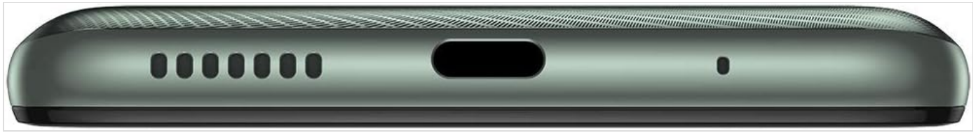
Figure 3.6: Bottom Edge of the Moto G9 Power. This image details the bottom of the phone, typically showing the USB-C charging port, speaker grille, and primary microphone.