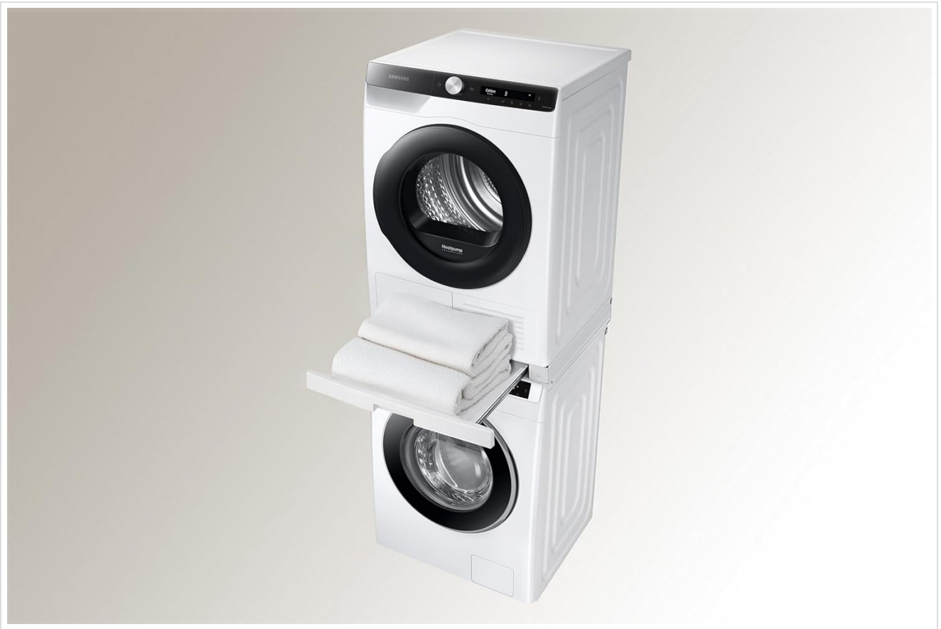
Figure 4: A stacked Samsung washing machine and dryer setup, demonstrating the extendable tray holding folded towels.