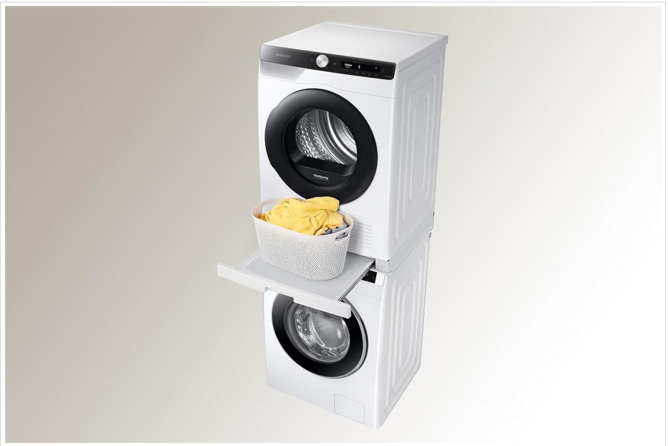
Figure 5: A stacked Samsung washing machine and dryer setup, illustrating the extendable tray supporting a laundry basket.