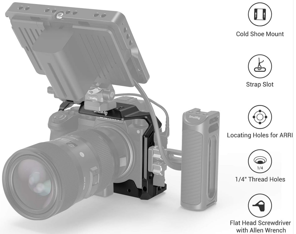
Figure 6.1: Multiple Mounting Points.

Features 1/4" screw holes, 3/8" screw holes for Arri , cold shoe mount, NATO rail, Strap Slots and Flat Head Screwdriver with Allen Wrench.