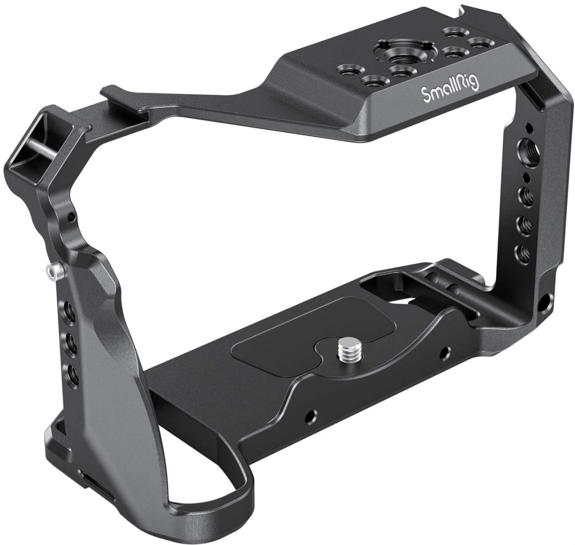
Figure 3.1: Package Contents - One SmallRig Camera Cage.