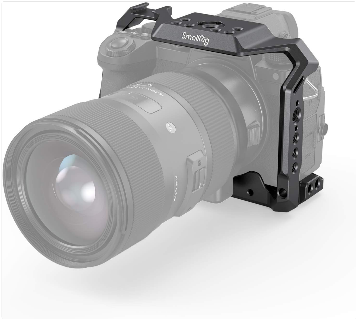
Figure 5.2: SmallRig Cage installed on Panasonic LUMIX S5.