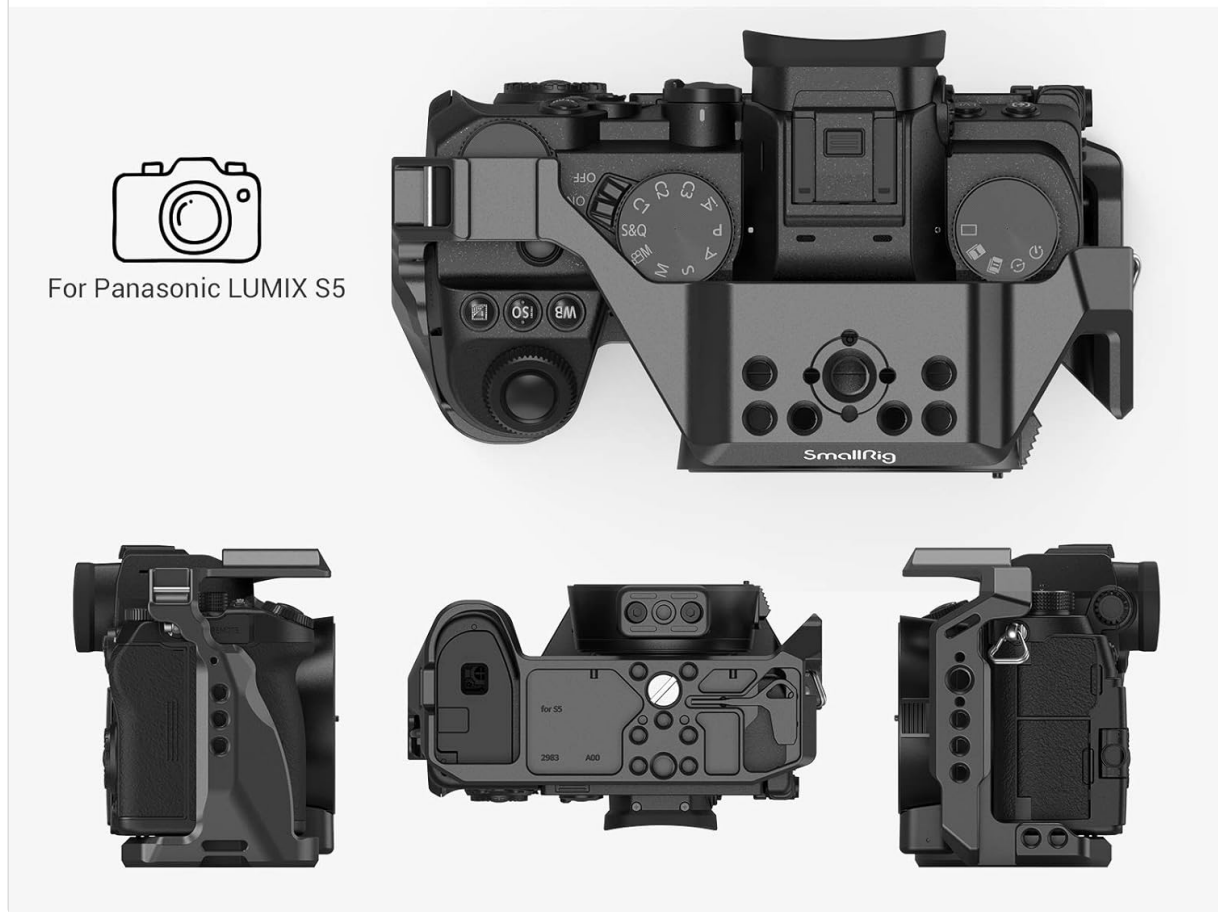
Figure 4.1: Compatibility with Panasonic LUMIX S5.

SmallRig Cage for Panasonic S5 Camera 2983 is a formfitting full cage designed to provide protection and accessory mounts.