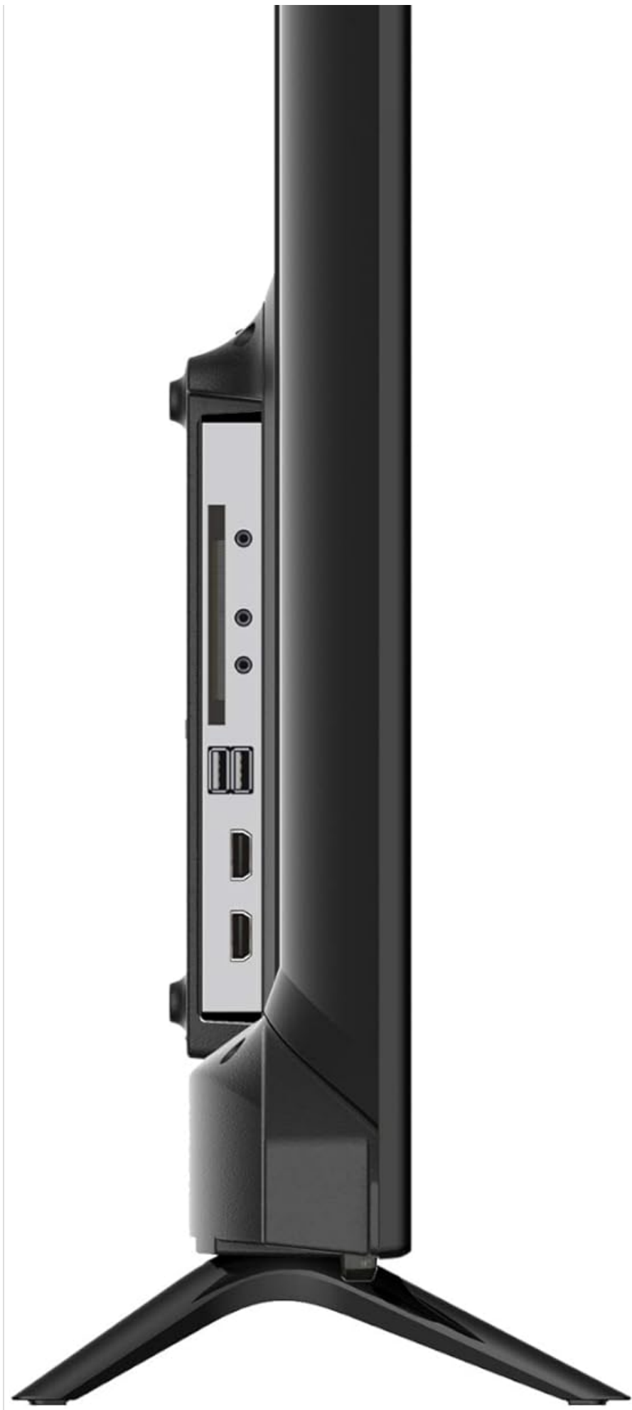
Image: Side view of the EMtronics 40 inch TV, showing the conveniently located USB and HDMI ports.