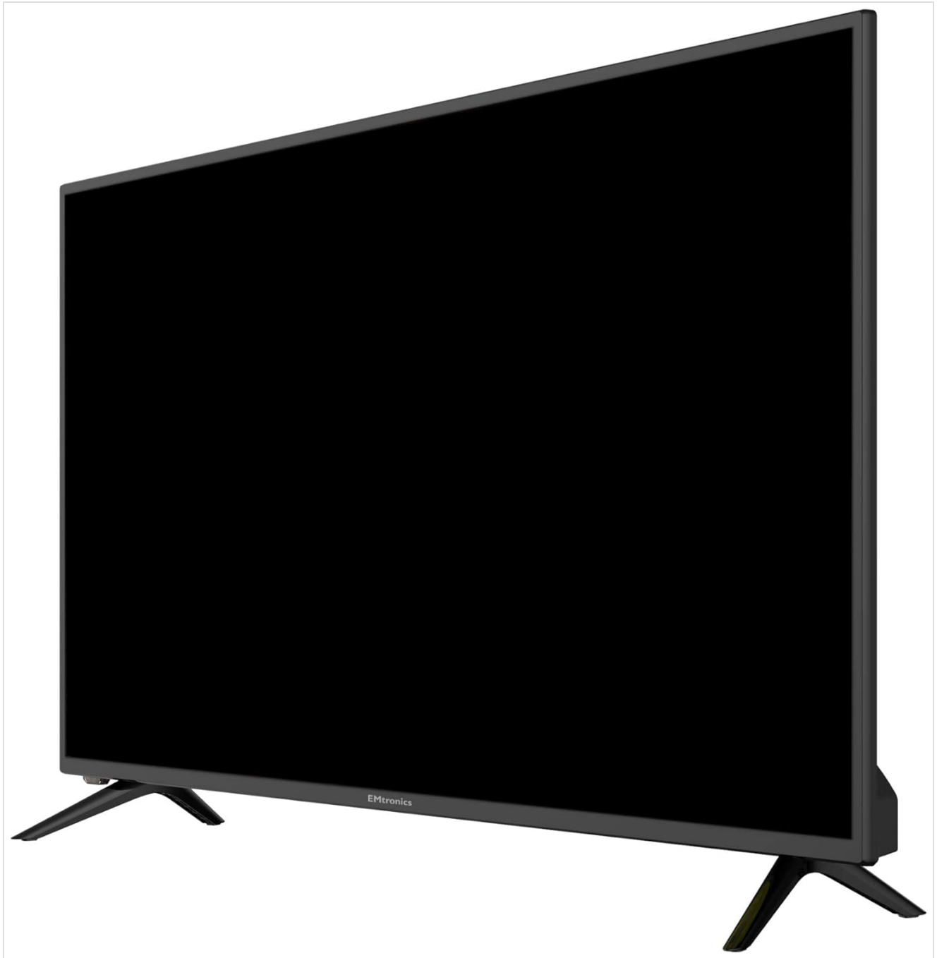
Image: Angled view of the EMtronics 40 inch TV with its stand attached.

Note: This TV supports VESA wall mount dimensions of 200 x 200 mm. A wall mount bracket is not included.