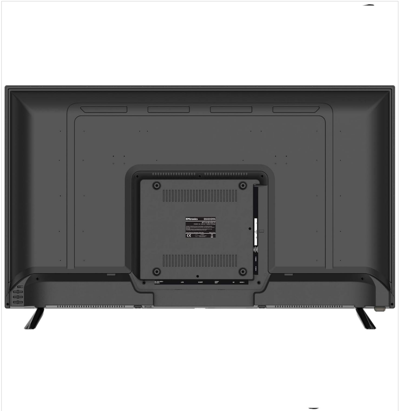
Image: Rear view of the EMtronics 40 inch TV, highlighting the arrangement of input and output ports.