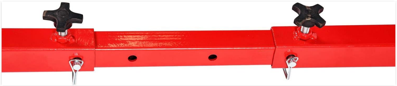
Figure 4.4: A close-up of the length adjustment points, featuring black knobs and metal pins that allow the dolly to extend or retract its overall length.