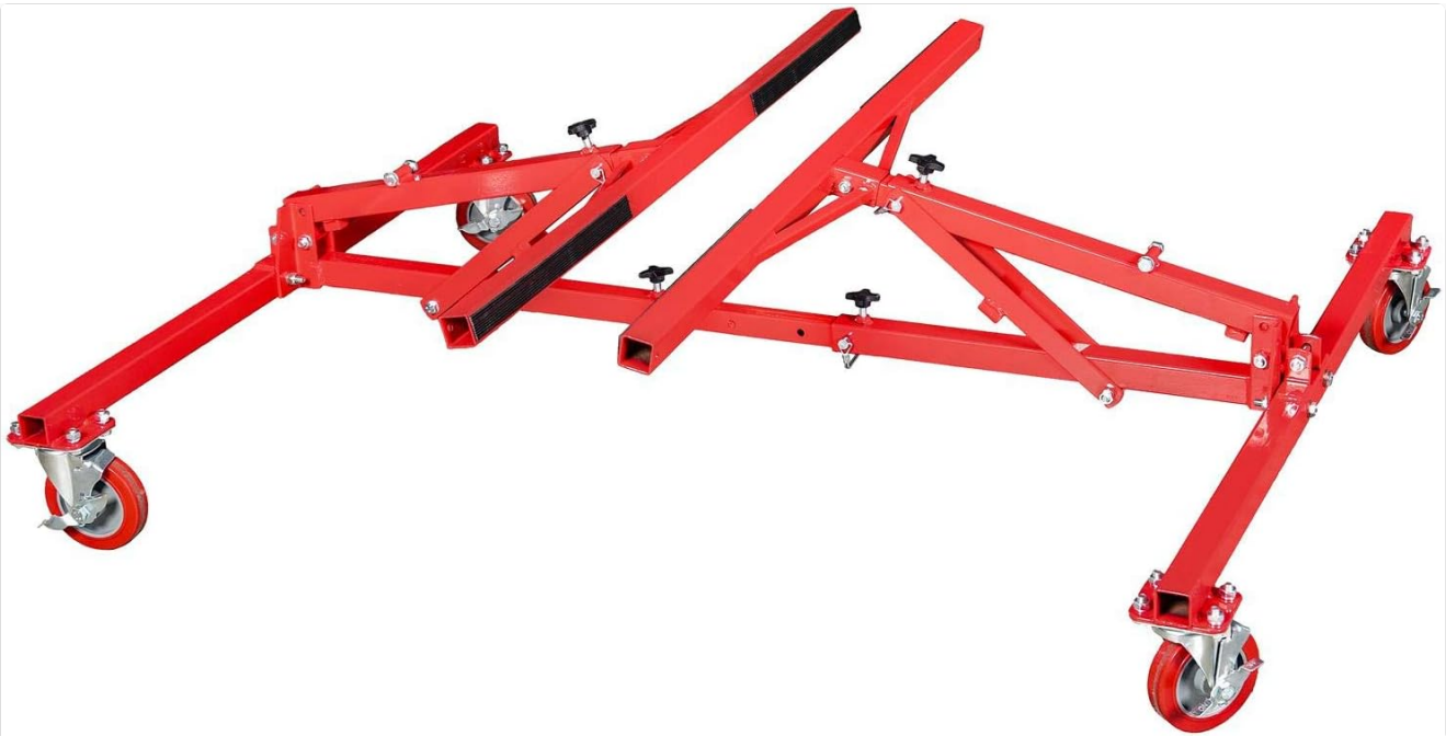
Figure 6.1: The JEGS 81243 Truck Bed Dolly folded for compact storage, demonstrating its space-saving design.