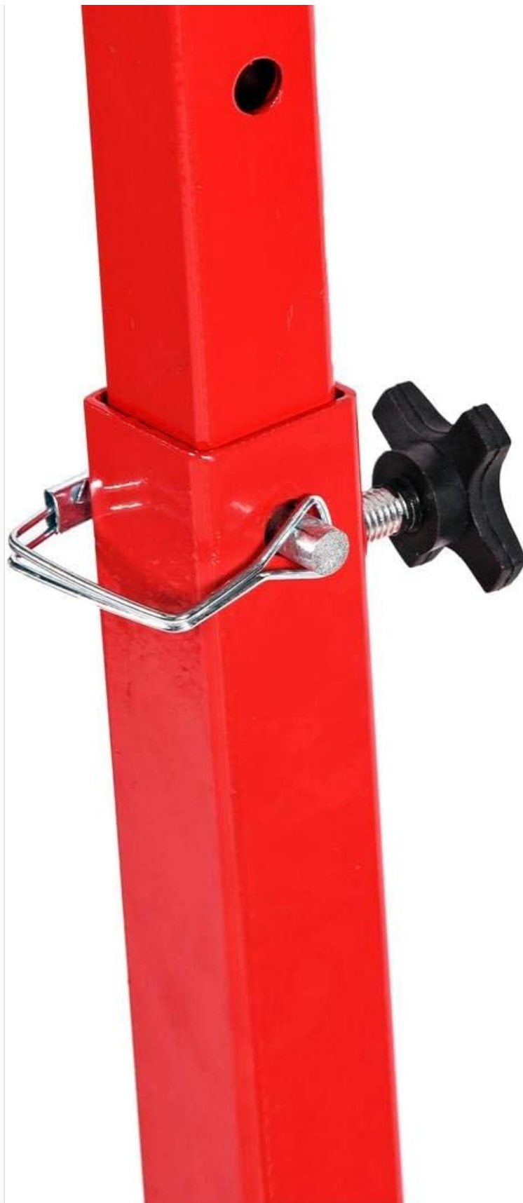
Figure 4.3: Detail of the height adjustment mechanism, showing the pull-pin and threaded knob used to secure the vertical support at various heights.