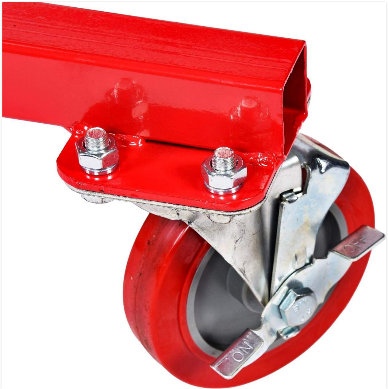
Figure 4.1: Detail of a 5-inch locking caster, showing its attachment point and the 'ON/OFF' lever for locking the wheel and swivel.