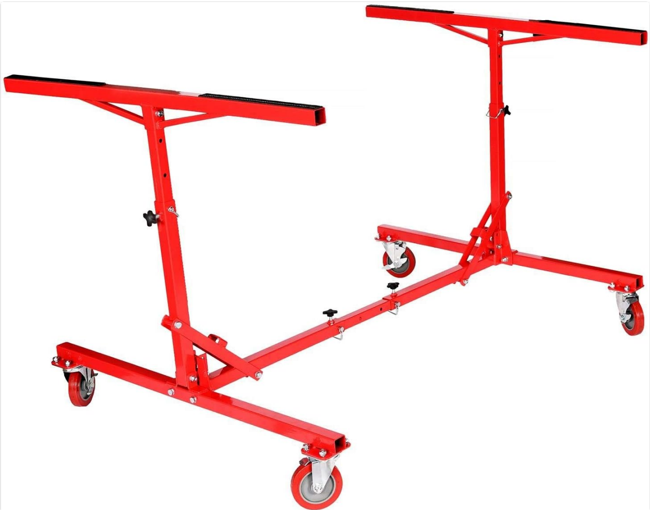
Figure 1.1: The JEGS 81243 Truck Bed Dolly in its fully assembled and extended configuration, showcasing its red frame and four swivel casters.