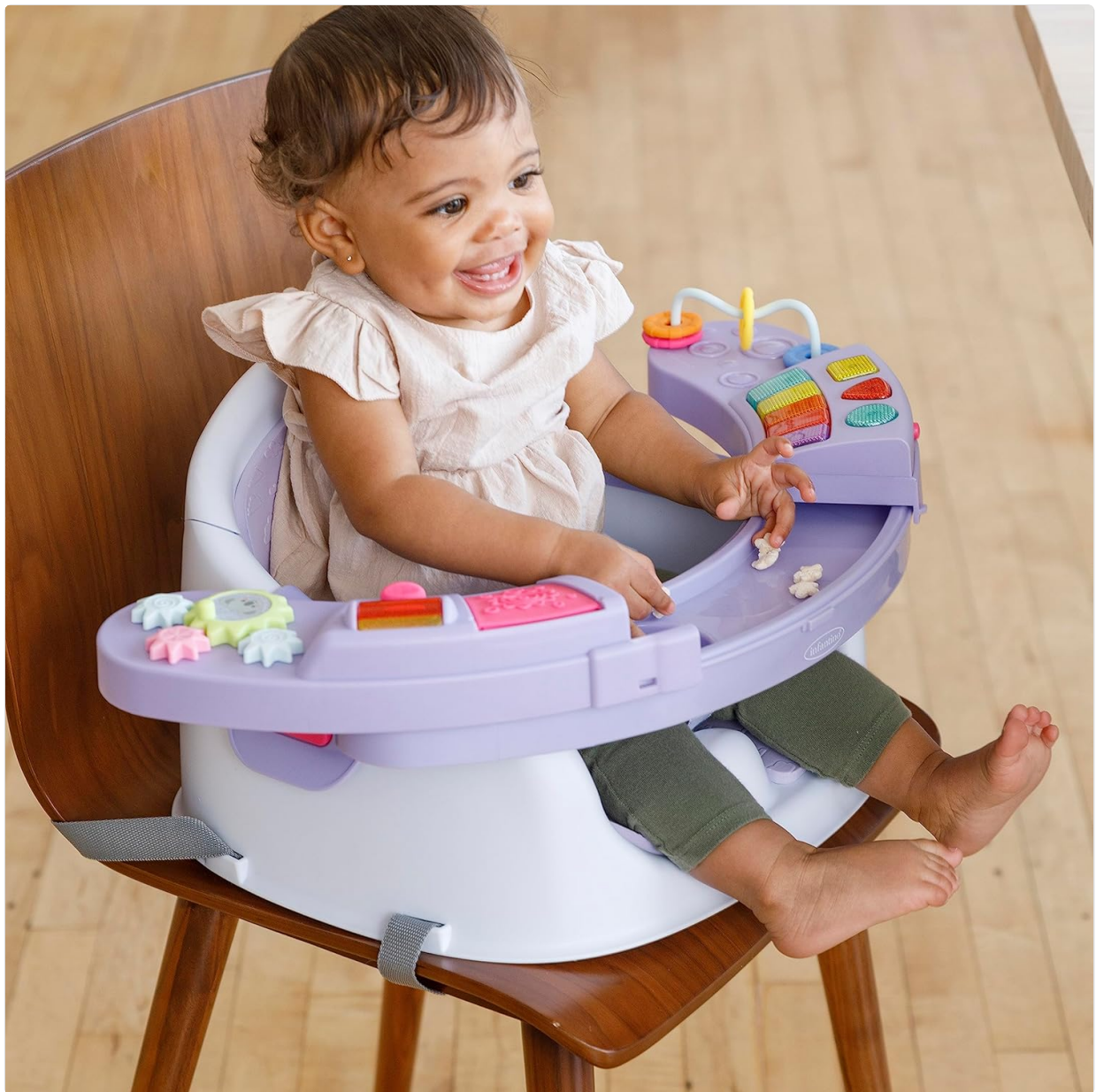
Image: A baby happily using the booster seat with the snack tray extended, showing its practical use during meal times.