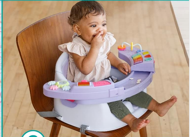
2 Snack time booster