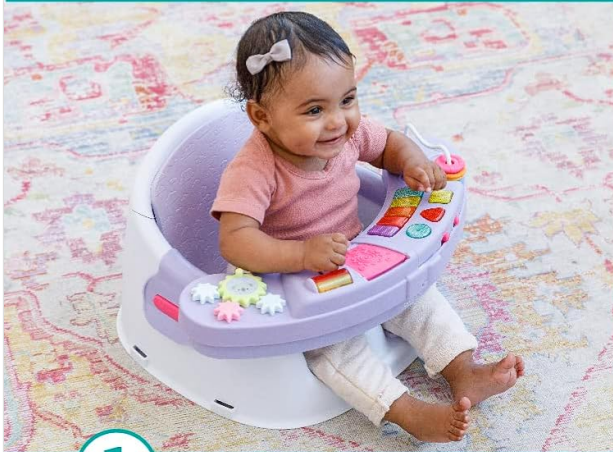
1 Seated positioner