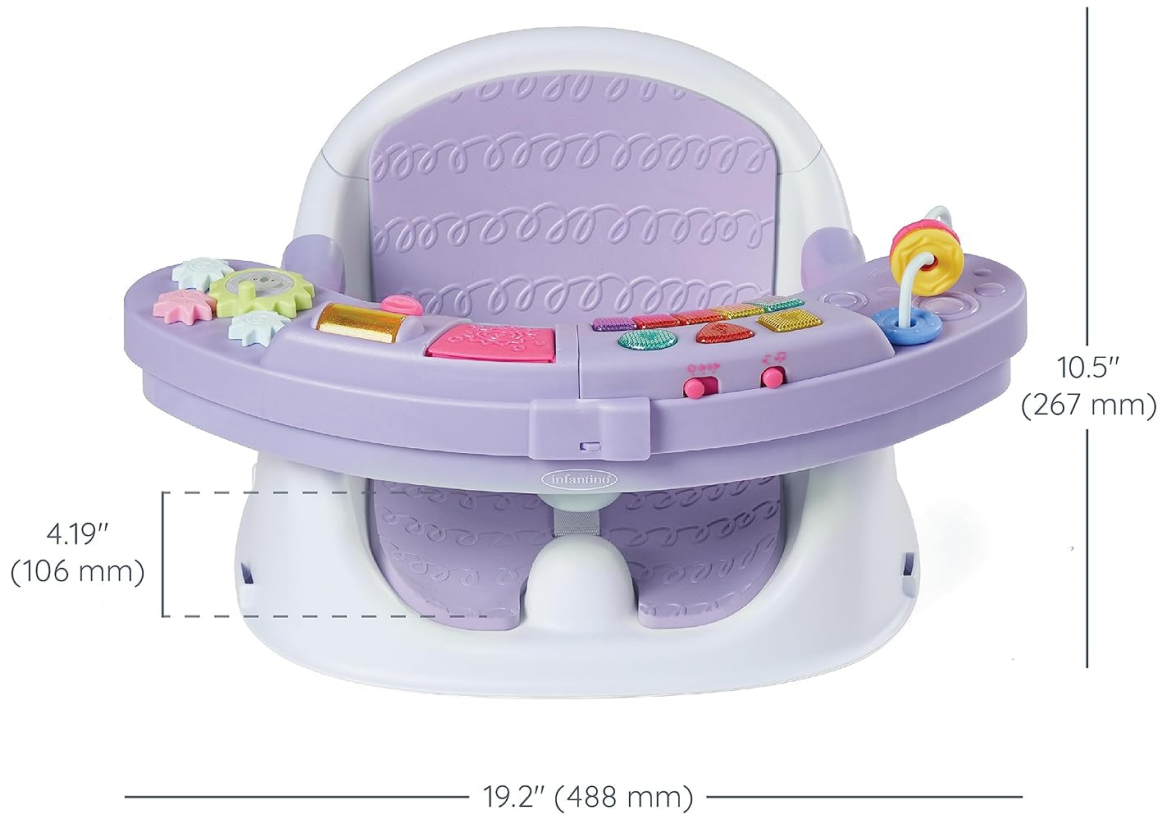
Image: Front view of the booster seat with key dimensions (depth, width, height) indicated.