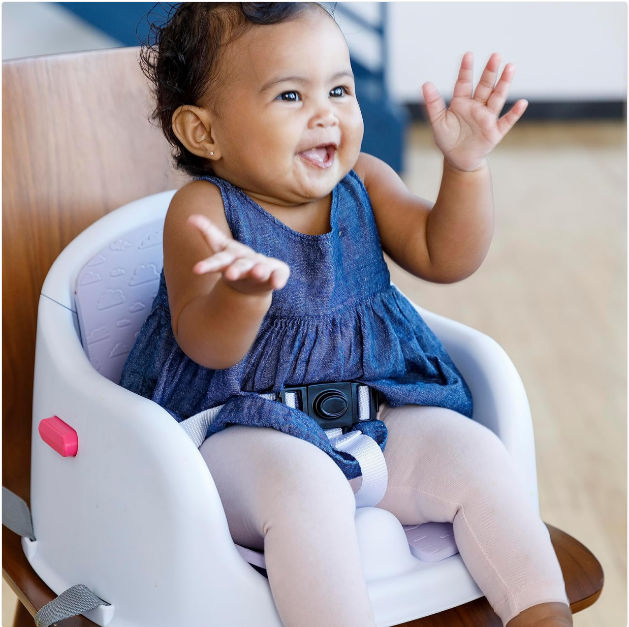
Image: A baby comfortably seated in the booster seat, demonstrating its use as a secure seating option.