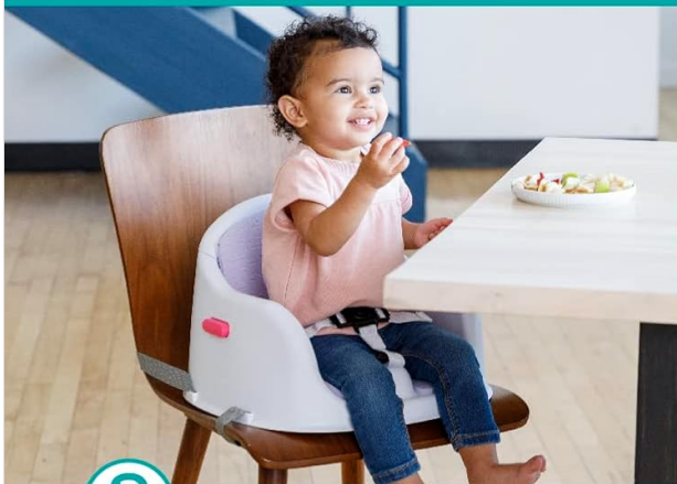
3 Table booster seat