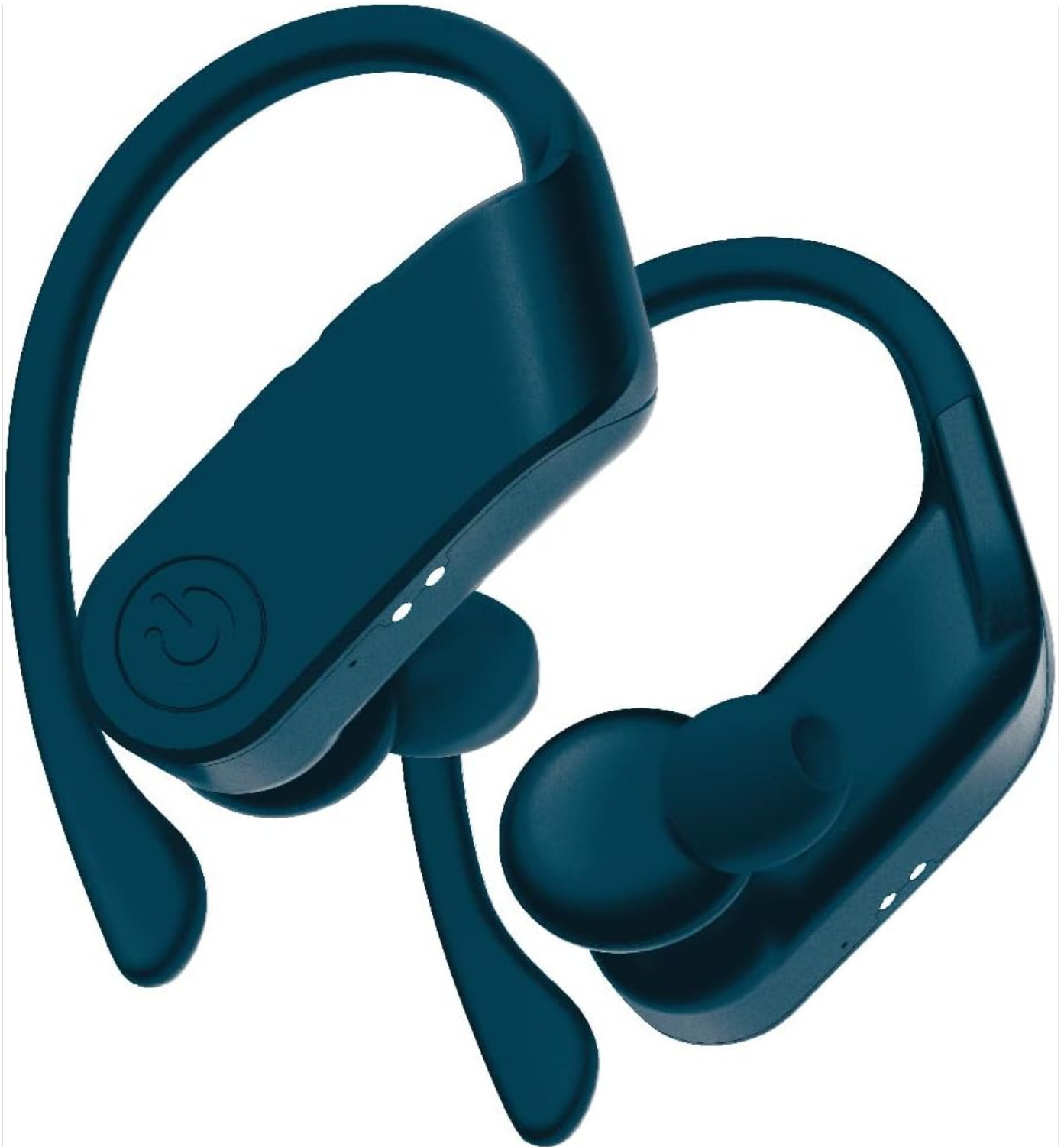
Image: Both Coby True Wireless Sport Earbuds are shown outside their charging case, illustrating their readiness for use or pairing.