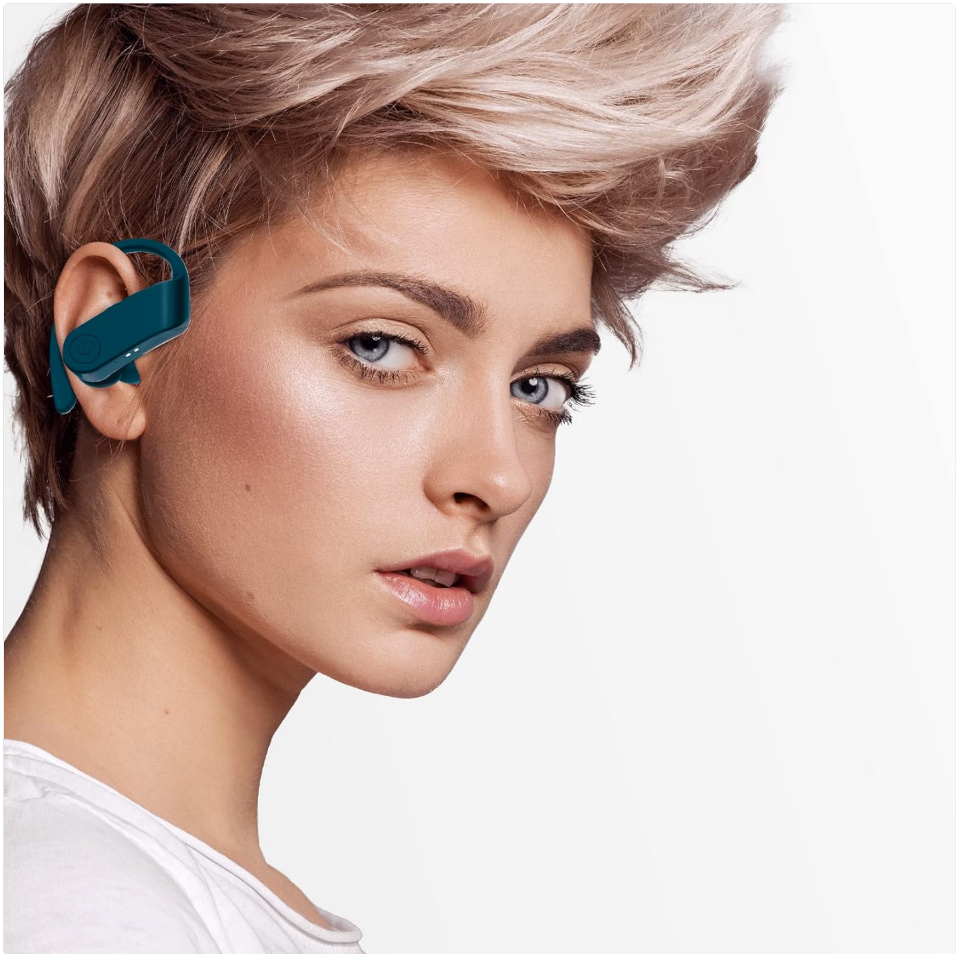
Image: A woman wearing one of the Coby True Wireless Sport Earbuds, demonstrating how the ear hook fits securely around the ear.