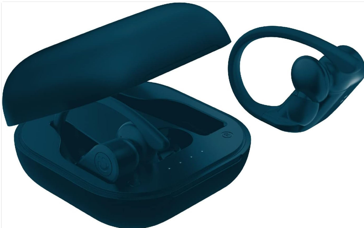
Image: The Coby True Wireless Sport Earbuds, one earbud placed inside its open charging case, and the other earbud shown separately, highlighting its design.

Thank you for purchasing the Coby True Wireless Sport Earbuds. This manual provides detailed instructions on how to set up, operate, and maintain your earbuds to ensure optimal performance and longevity. Please read this manual thoroughly before using the product.